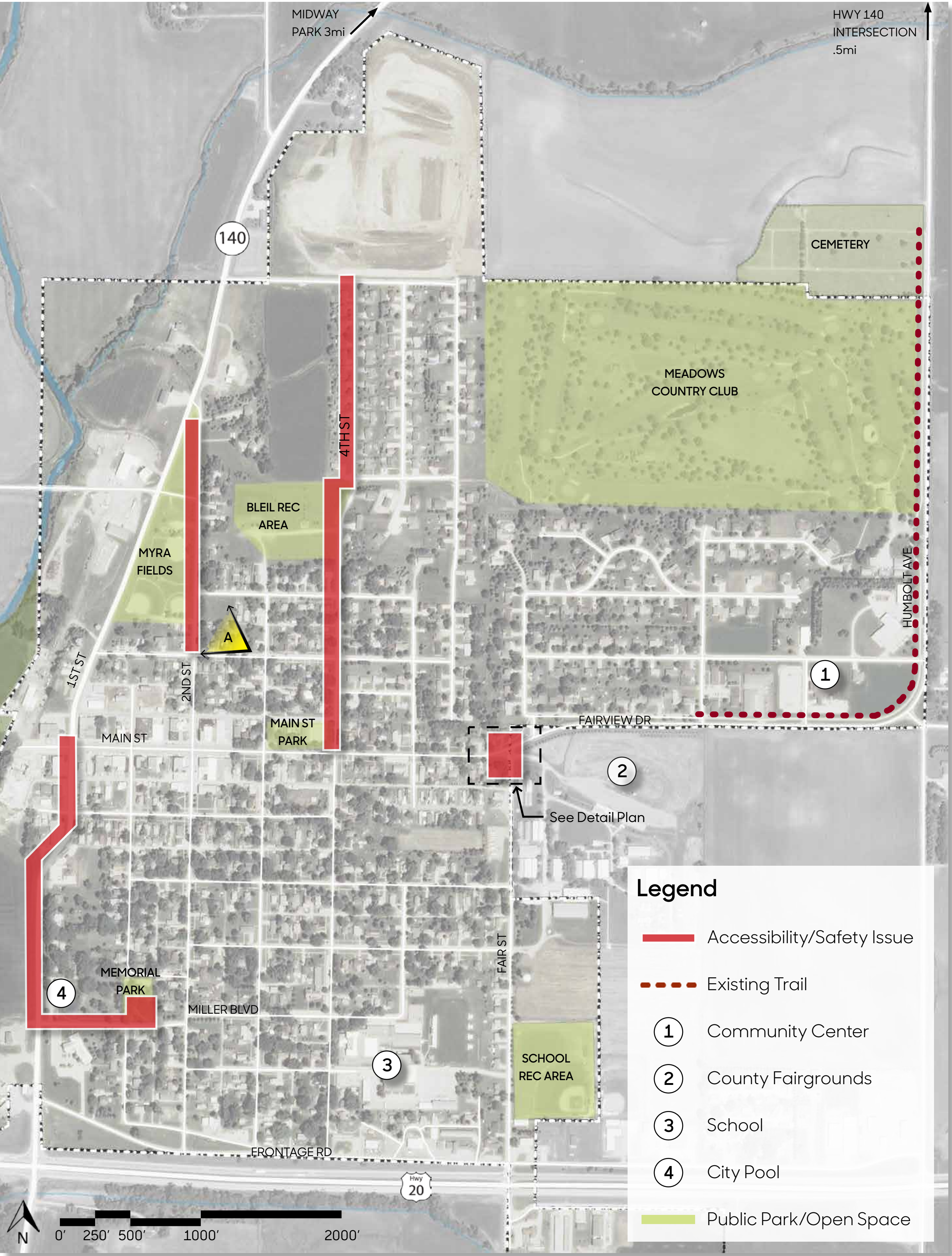
Merville map showing existing trail, destinations, and the desired connections around the community.