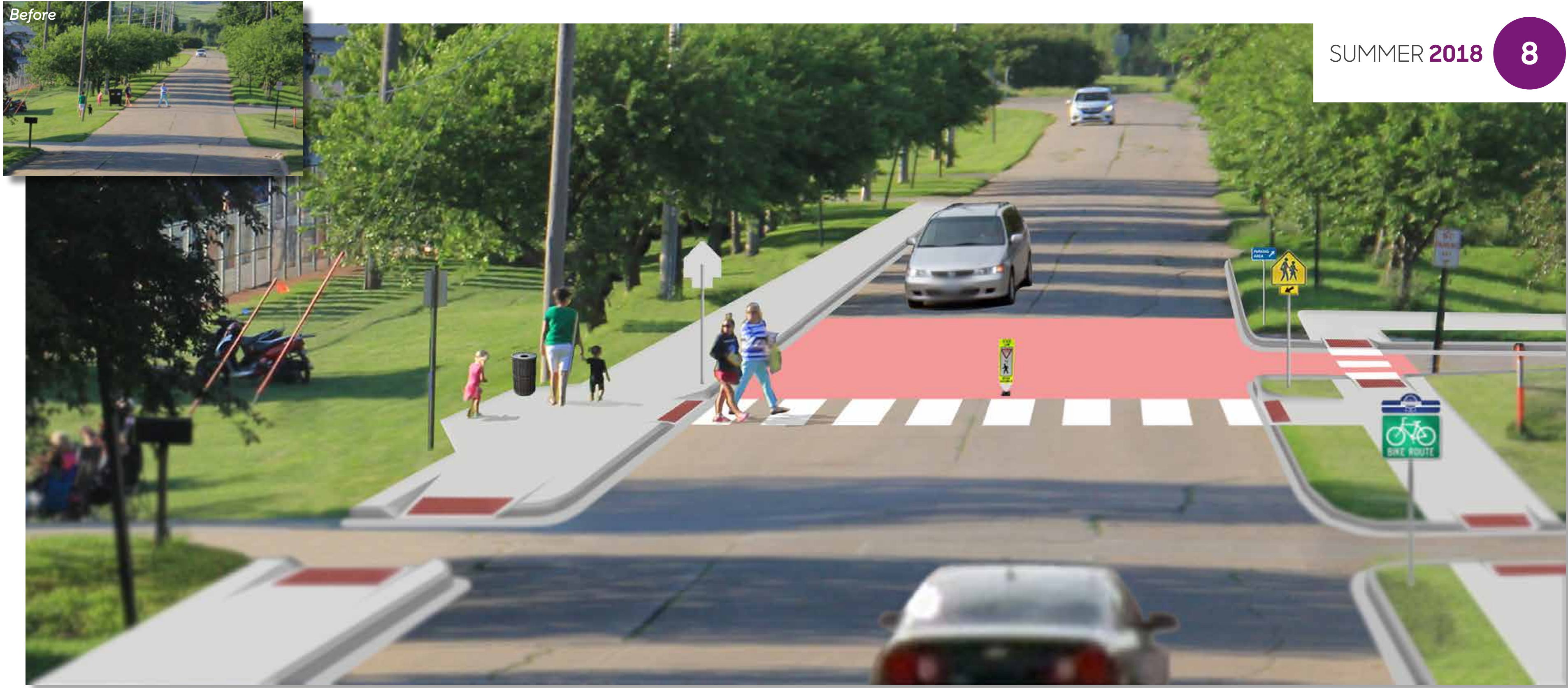
Perspective looking north on 2nd Street at MYRA fields showing an improved crossing at Elm Street, including colored pavement, sidewalks, and bike signage.