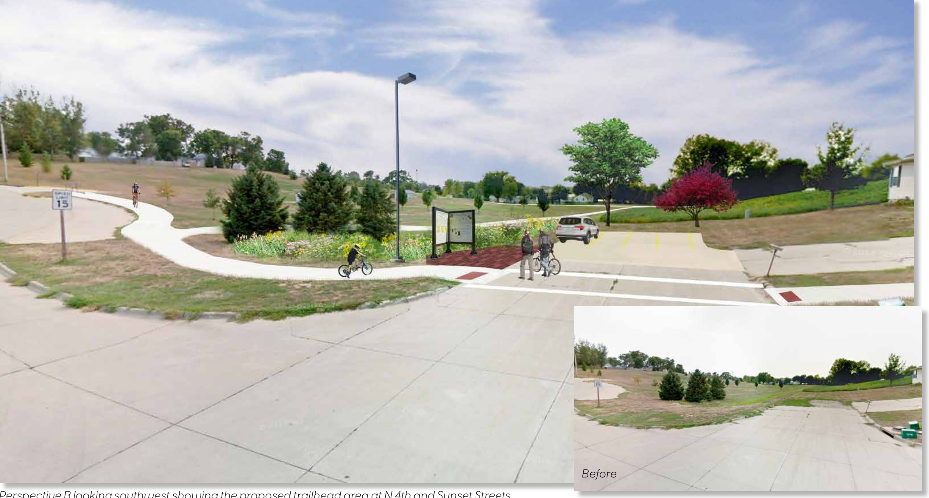
Perspective B looking southwest showing the proposed trailhead area at N 4th and Sunset Streets.