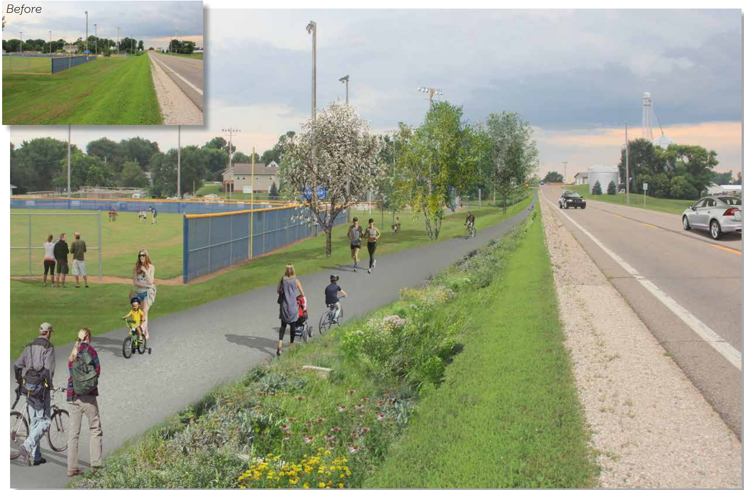
A. Perspective looking south showing the proposed separate trail that runs west of the MYRA Fields.

A separate trail is proposed as an extension from the existing trail, cutting west into town through the cemetery. Separate bike trails provide a safe space for people who find it challenging to bike alongside high-speed vehicular traffic. Areas of the proposed route run through privately-owned land and landowners would need to be consulted to discuss the addition of such trails in Moville.