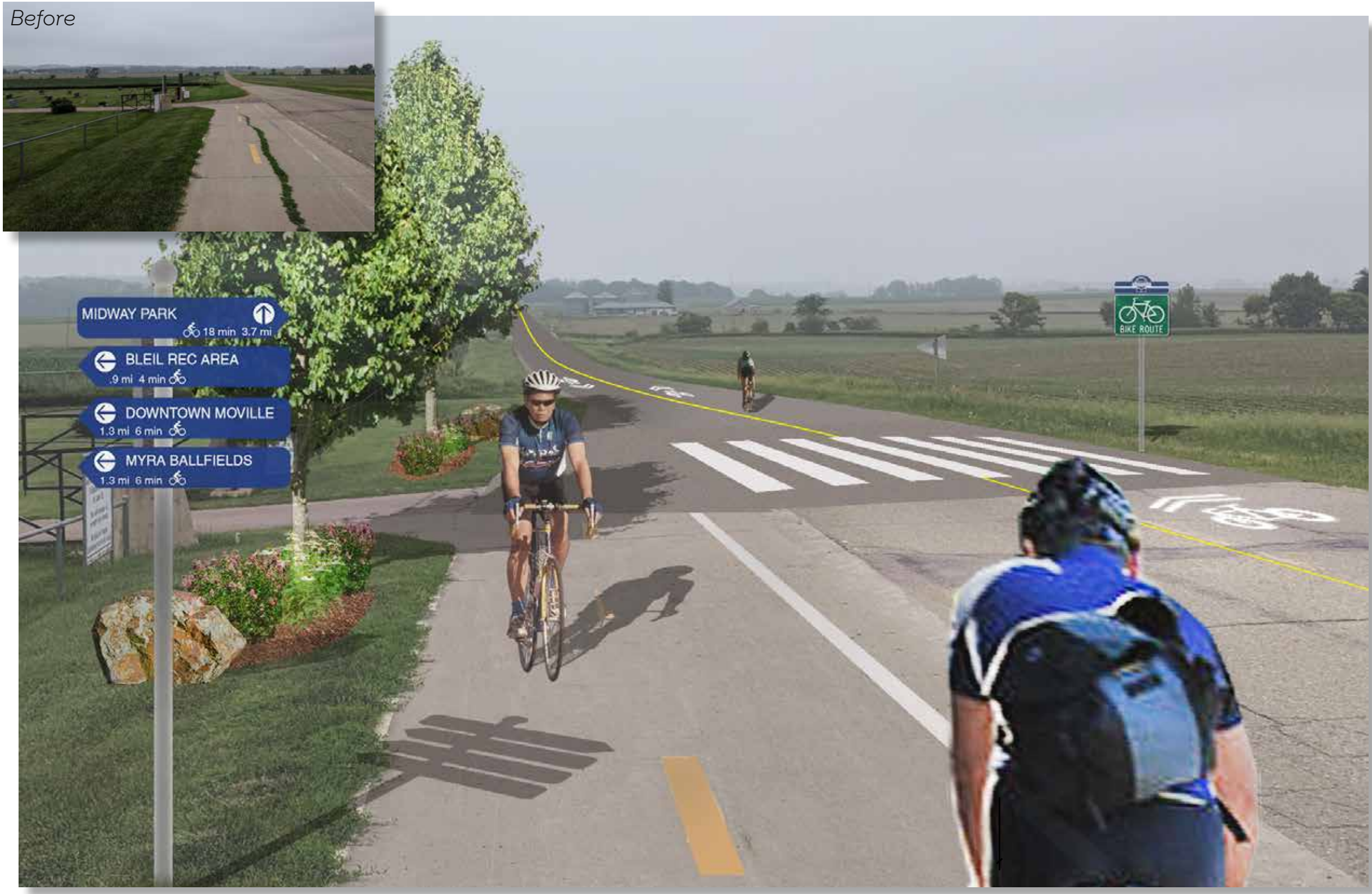
B. Perspective of proposed shared road trail along paved Humbolt Avenue at the entrance to the cemetery.

Many towns across the nation have chosen to make bicyclists a common roadway element by designating roads as shared roadways. This designation must be accompanied by ample signage and painted pavement markings as seen in the image to the left. Along residential roads, directing cyclists to use the road will free up sidewalks for pedestrians.