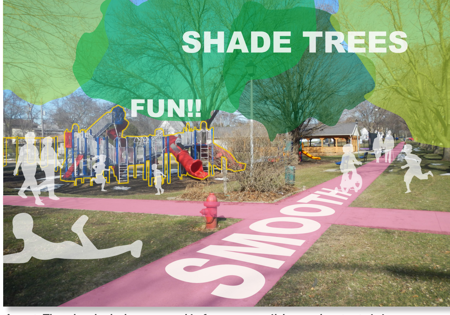
Asset: The shaded playground is fun, accessible, and entertaining.