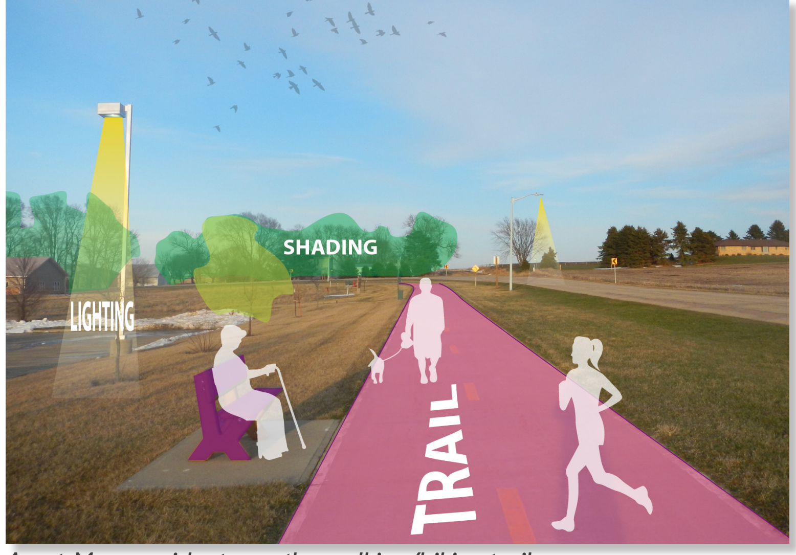
Asset: Many residents use the walking/biking trail.