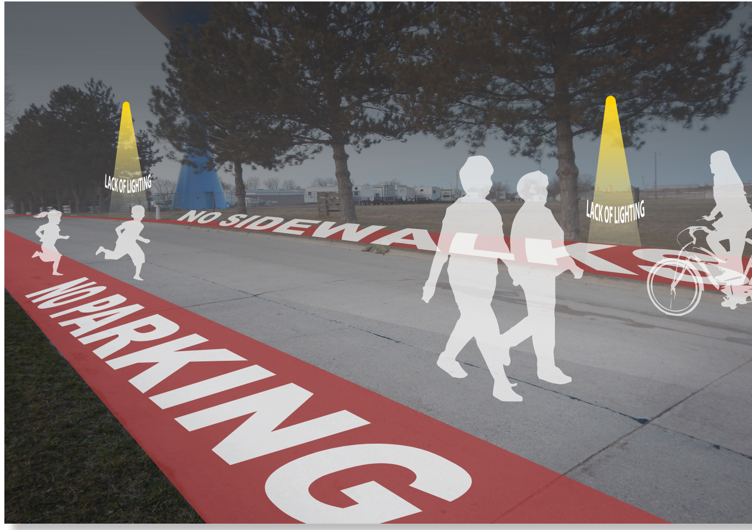
Barrier: There is no parking or sidewalks near the sports fields, making game days inconvenient.