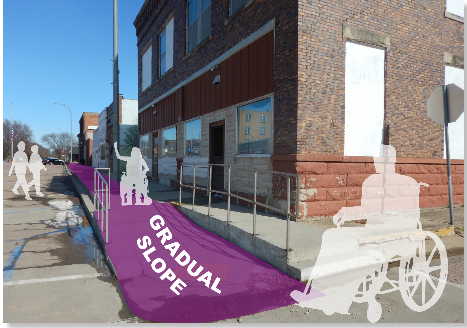
Asset: A ramp at the end of Main Street allows access to businesses.