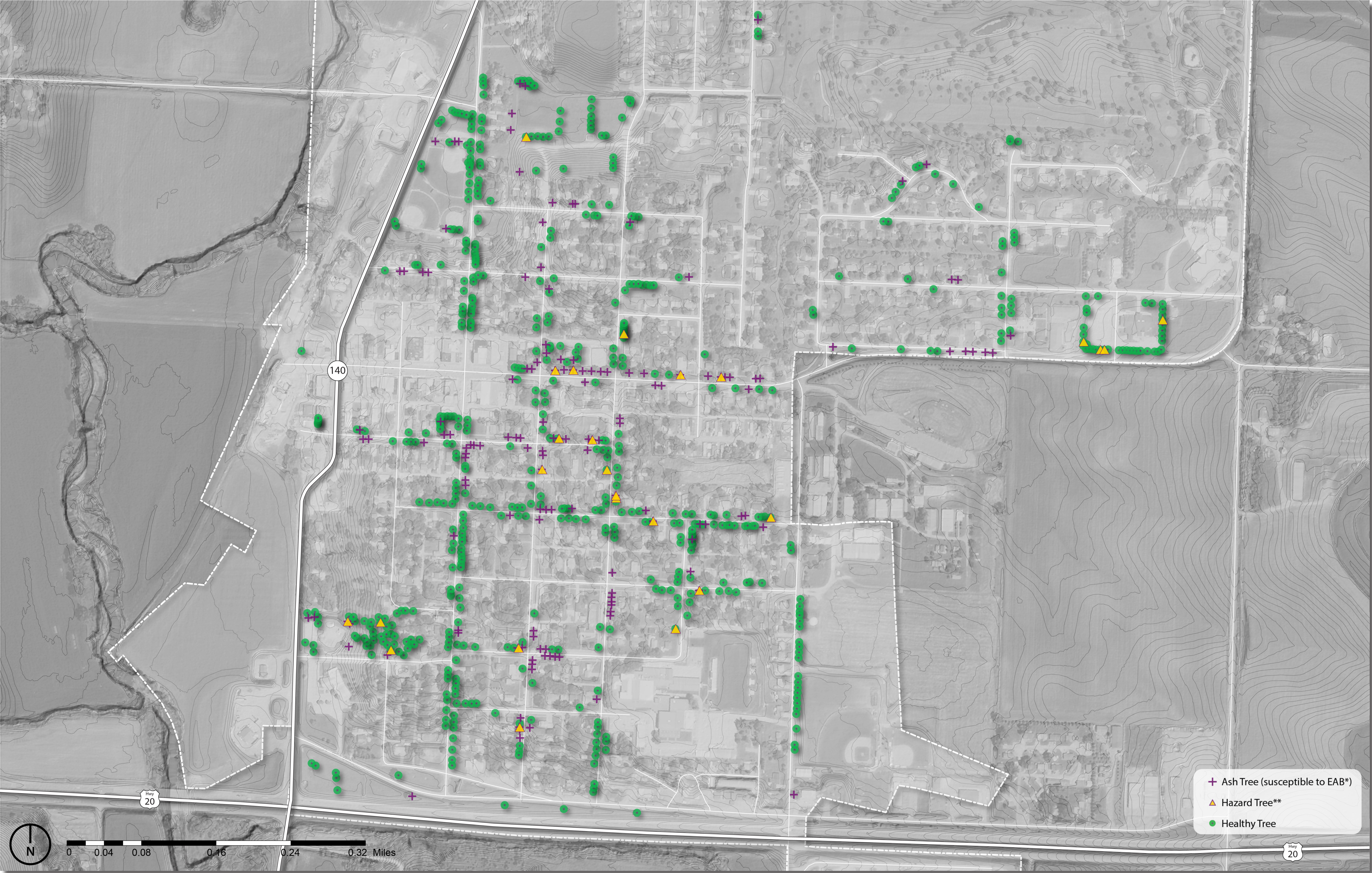
Map Source: Iowa Department of Natural Resources, “Natural Resources Geographic Information Systems Library,” http://www.igsb.uiowa.edu/nrgislib/ .

The map on the left depicts city owned trees that have been surveyed by the Iowa Department of Natural Resources (Iowa DNR). 1 The trees are divided into three categories: healthy trees, hazard trees, and ash trees.