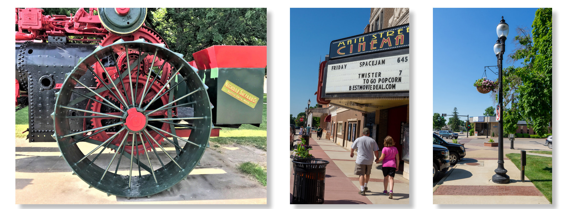
Elements integral to town aesthetics and identity, left to right: old thresher in the town square; historic downtown district; ornamental light posts, plantings, and pavement details throughout town