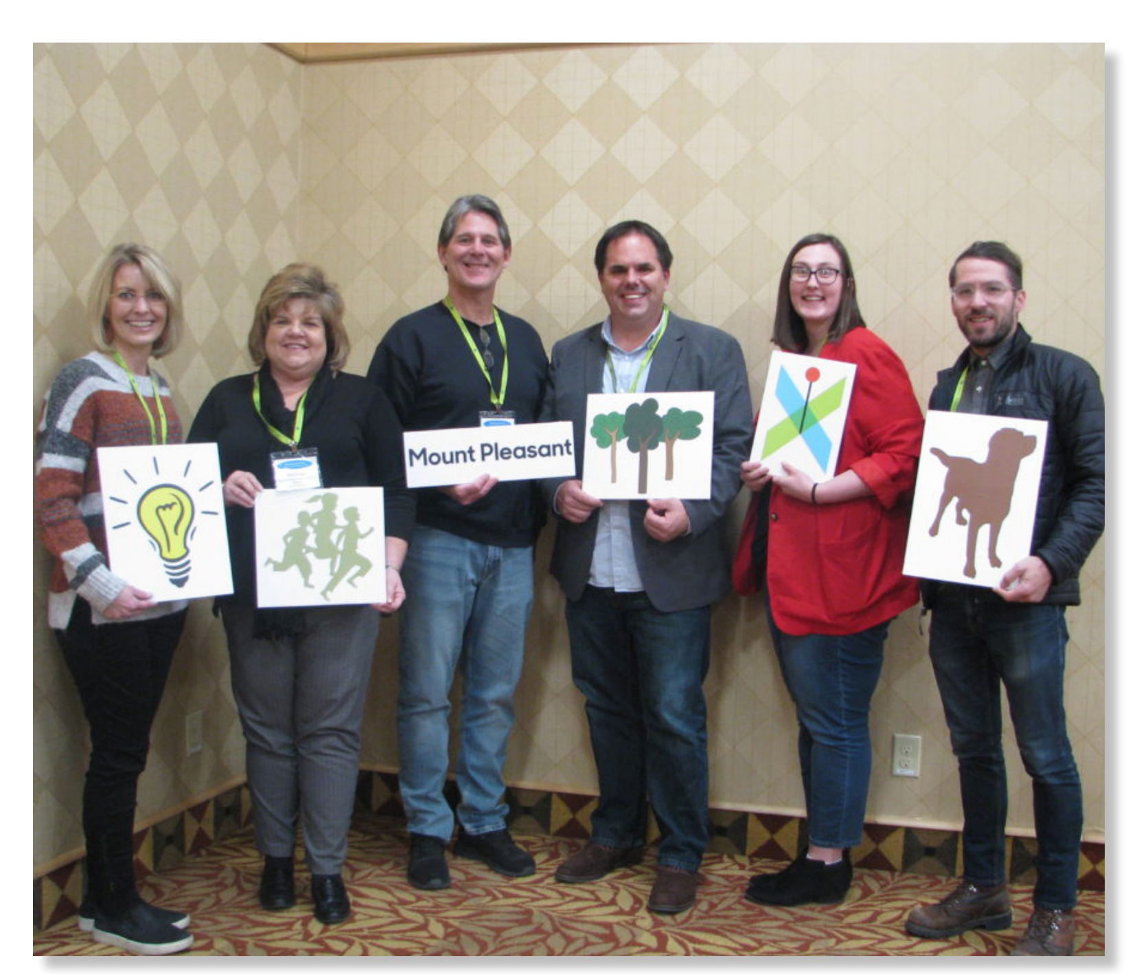
Representatives from the steering committee and design team kick off the Visioning process at a November 2019 training session