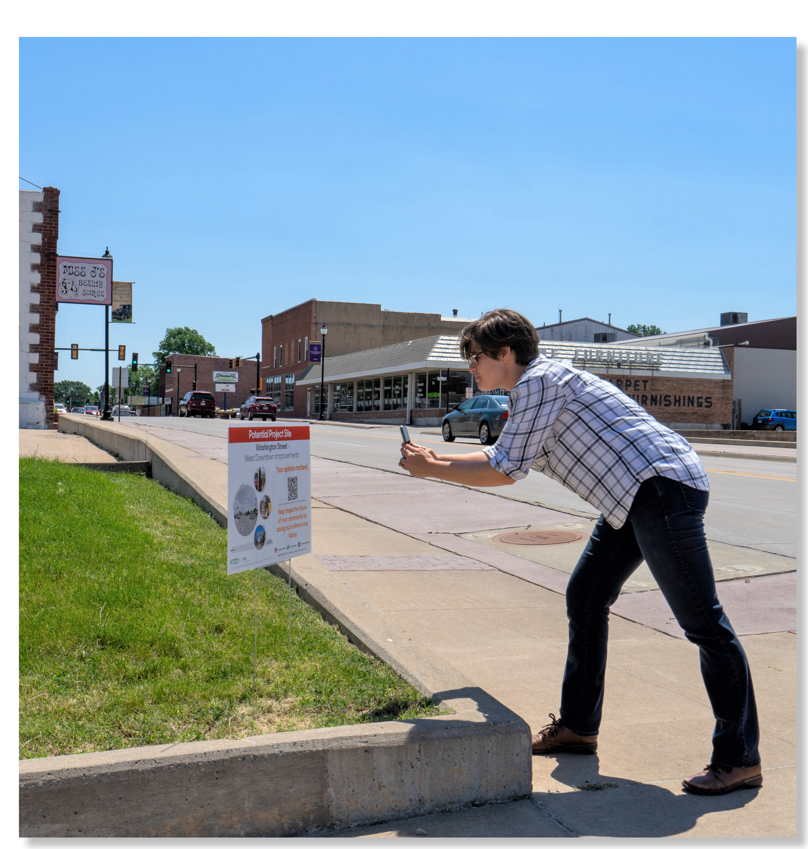
Mid-June, signs were posted at each potential project site explaining preliminary concepts and requesting feedback via an online survey