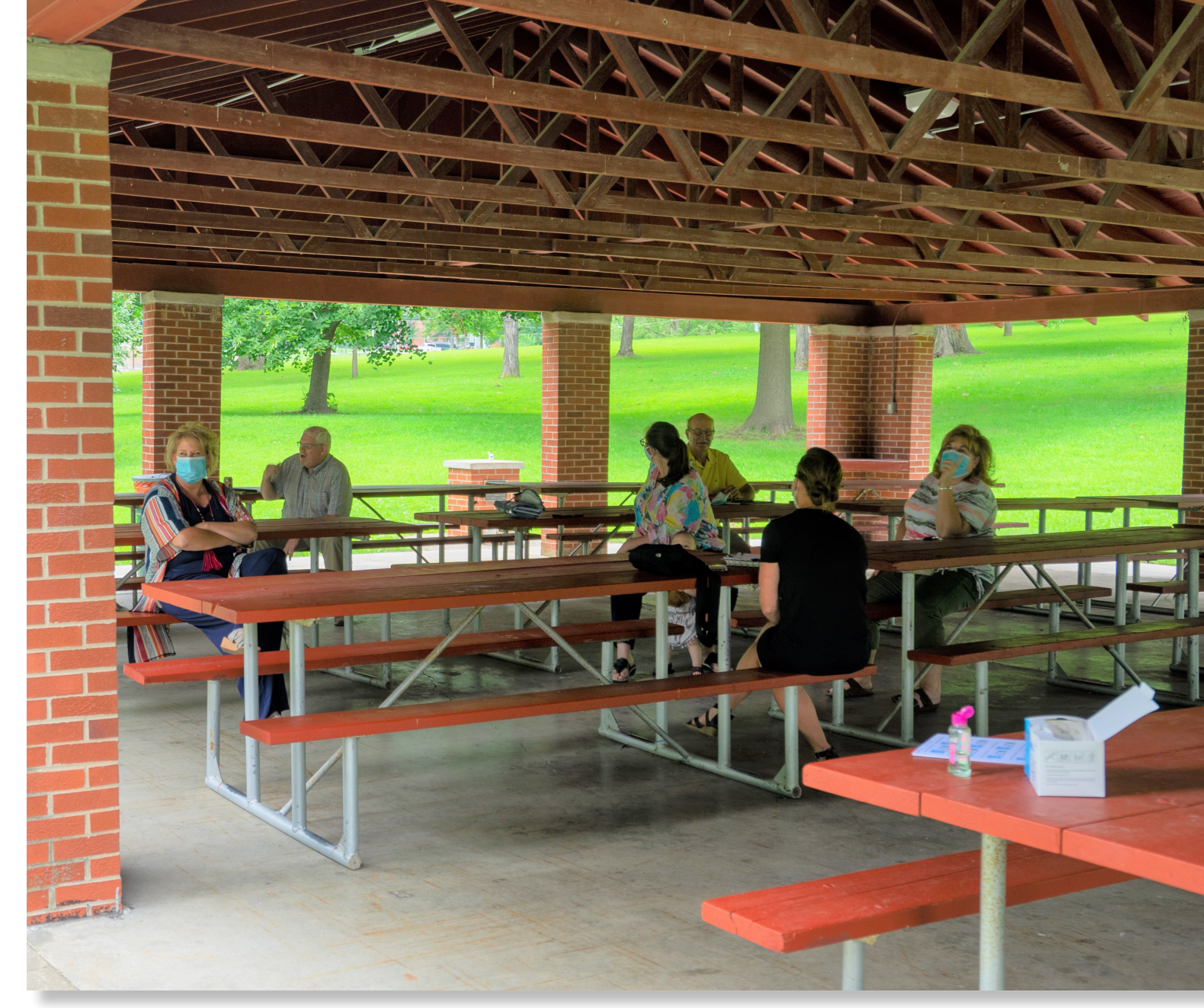
While most meetings were conducted virtually this summer, the design charrette, preliminary review, and final presentation were held in-person

Mount Pleasant is represented by a steering committee of residents and stakeholders who take part in a series of meetings that are facilitated by a field coordinator from Trees Forever. Iowa State University organizes design teams of professional landscape architects, design interns, and ISU faculty and staff. The program is sponsored by the Iowa Department of Transportation.