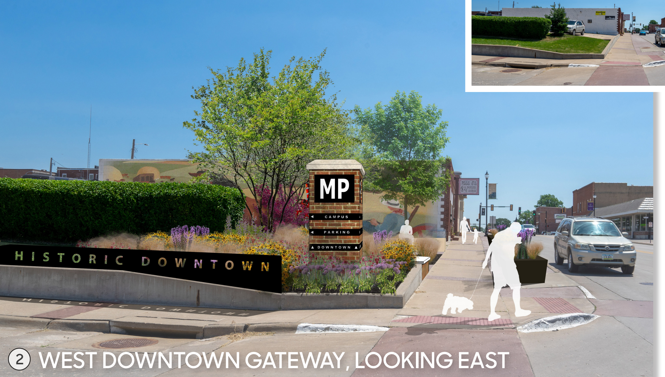
A metal sign blade and way-finding monument define the edge of downtown, while an art plaza, mural, and plantings enliven the space