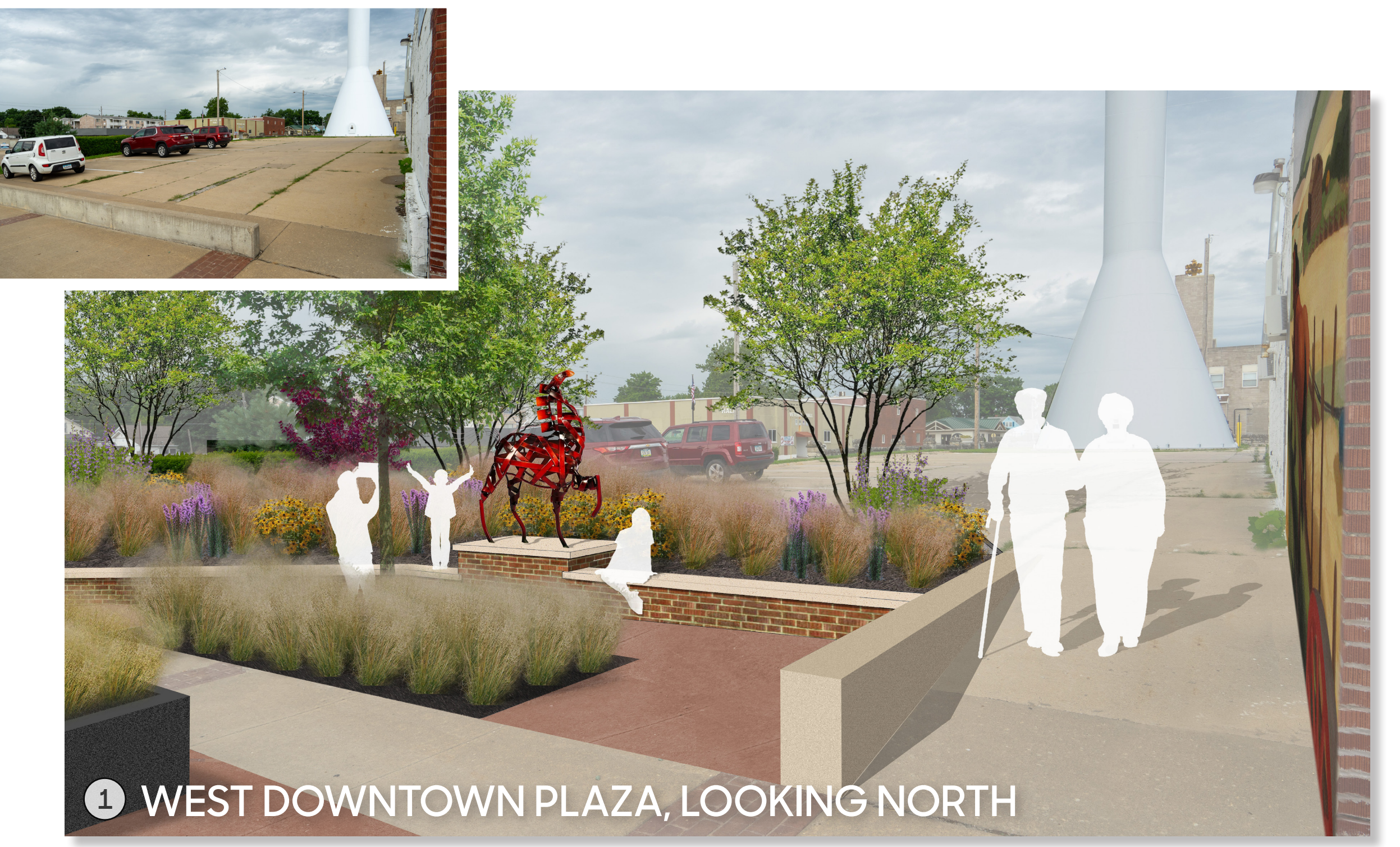
Although different from the east downtown plaza in layout and programming, stylistic elements - brick walls, colored concrete - carry through