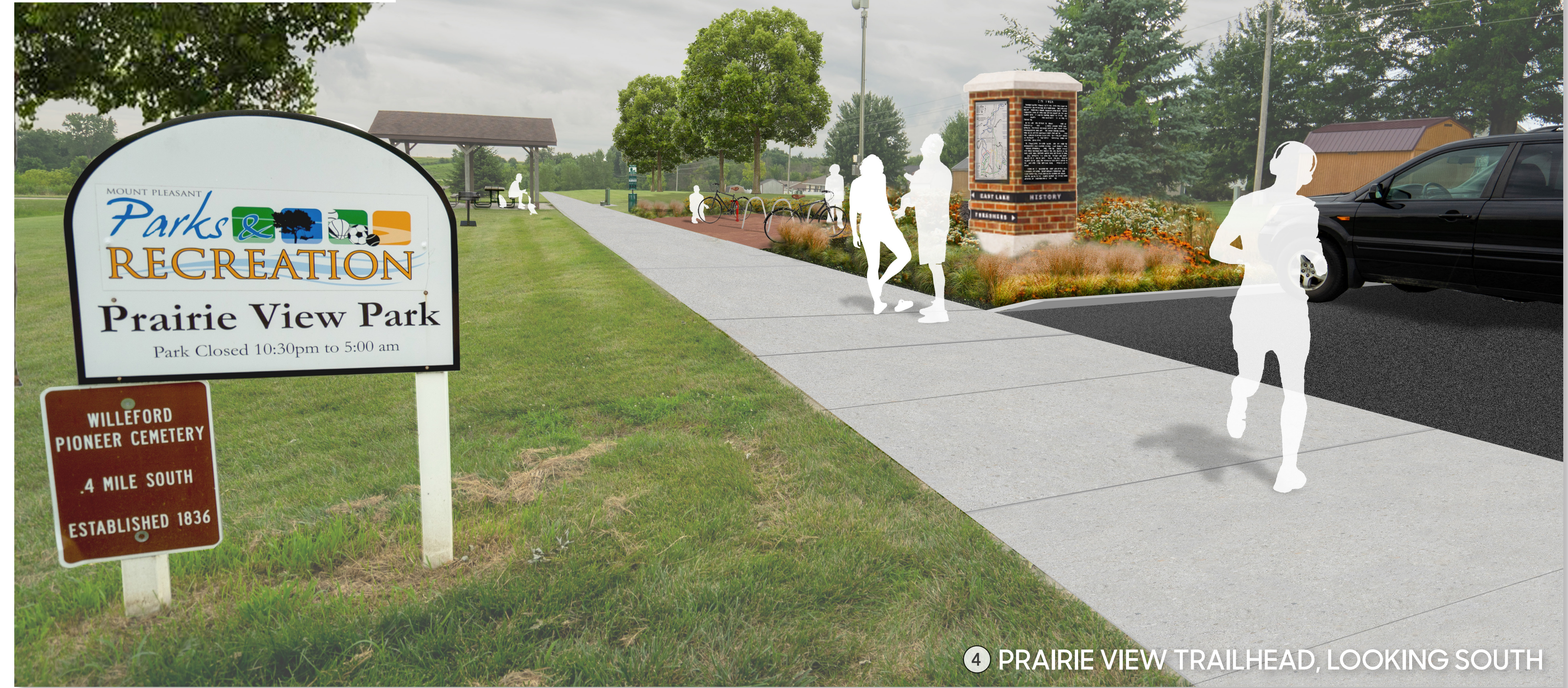
A trailhead kiosk is located at the edge of the parking lot, with bike racks and a pet waste station further down the trail. The existing shelter space is enriched with grills, a drinking/pet fountain, and a bike repair stand