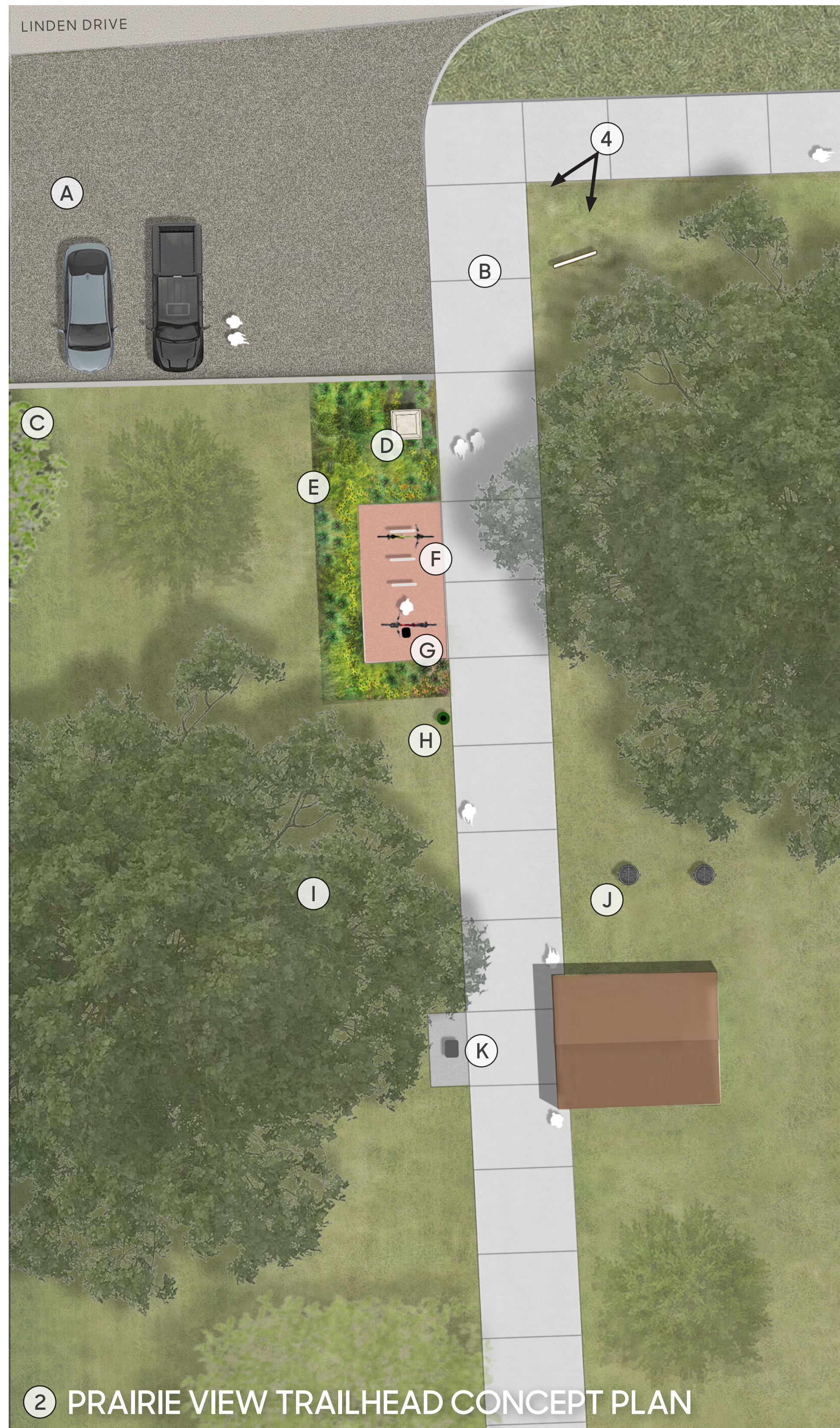
Plan view showing the proposed trailhead monument, expanded parking, connections, and amenities