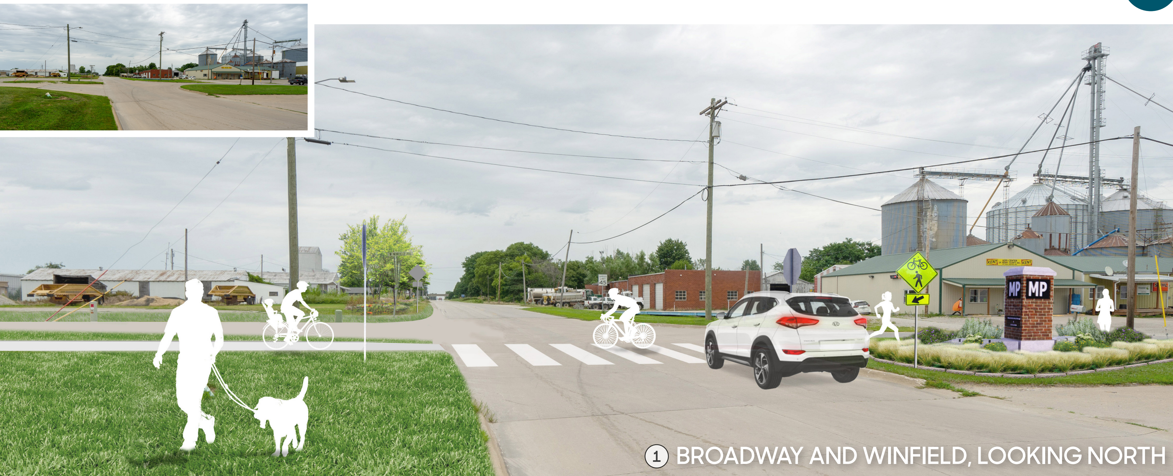
An entry monument and plantings define the north gateway into town and provide way-finding for trail users