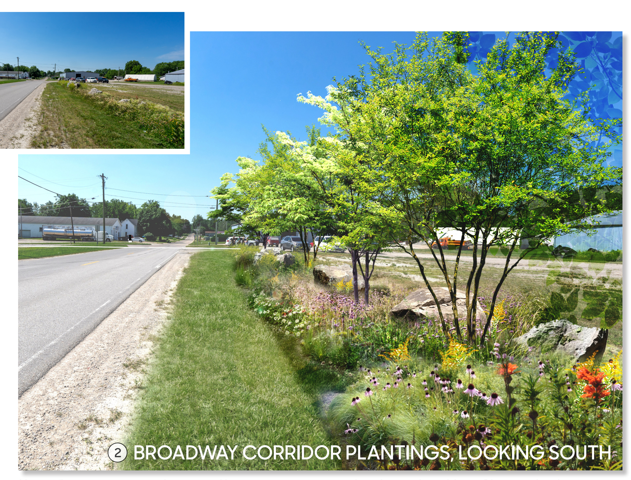
Native flowers, ornamental trees, and limestone outcroppings line the road into Mount Pleasant, leading to a modest entry monument and trail