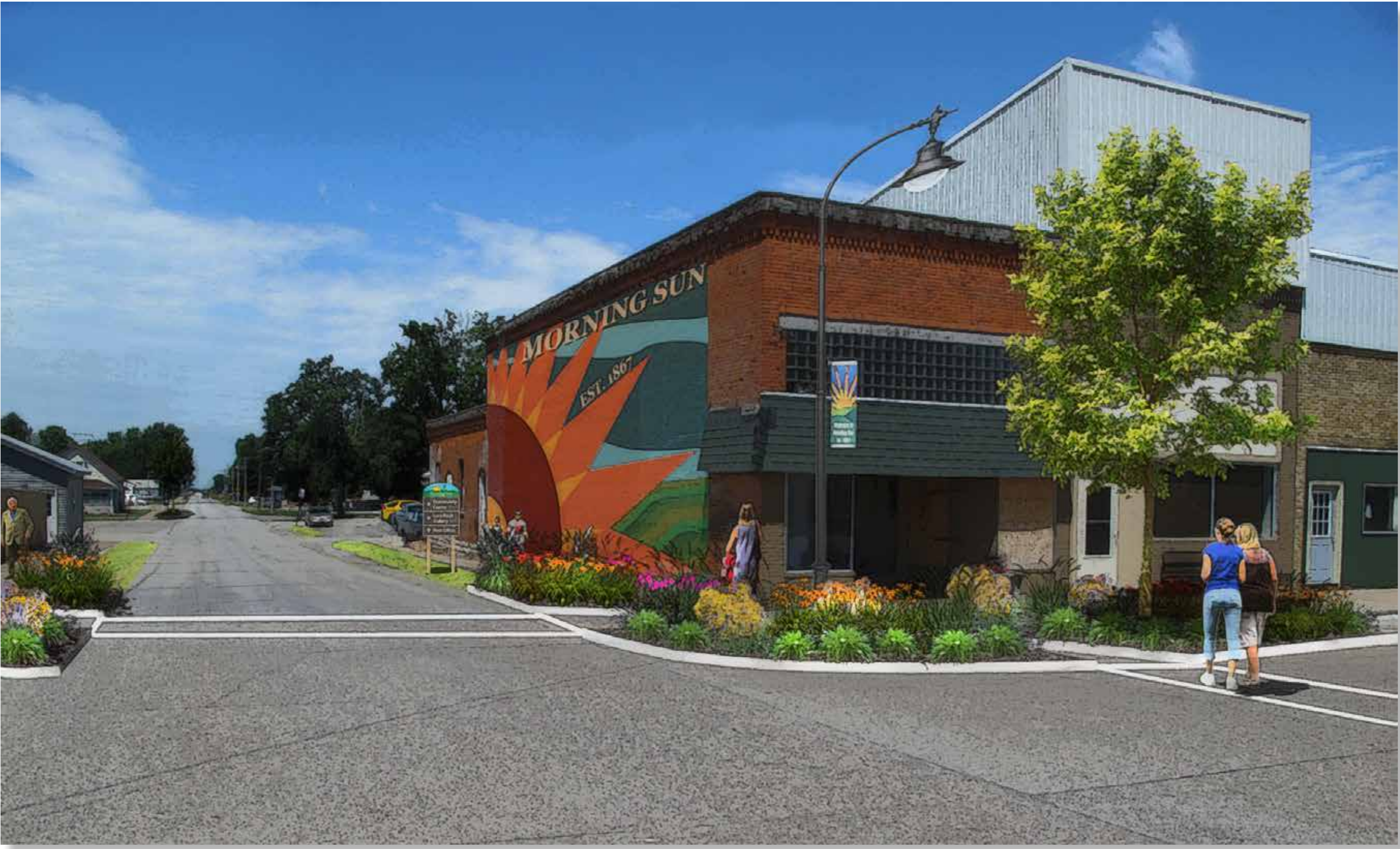
Proposed Concept: Main St. & Division Intersection, looking Northeast

The image edit above provides a visual of how the aesthetics of the downtown area would be changed if the proposed concept plan was implemented.