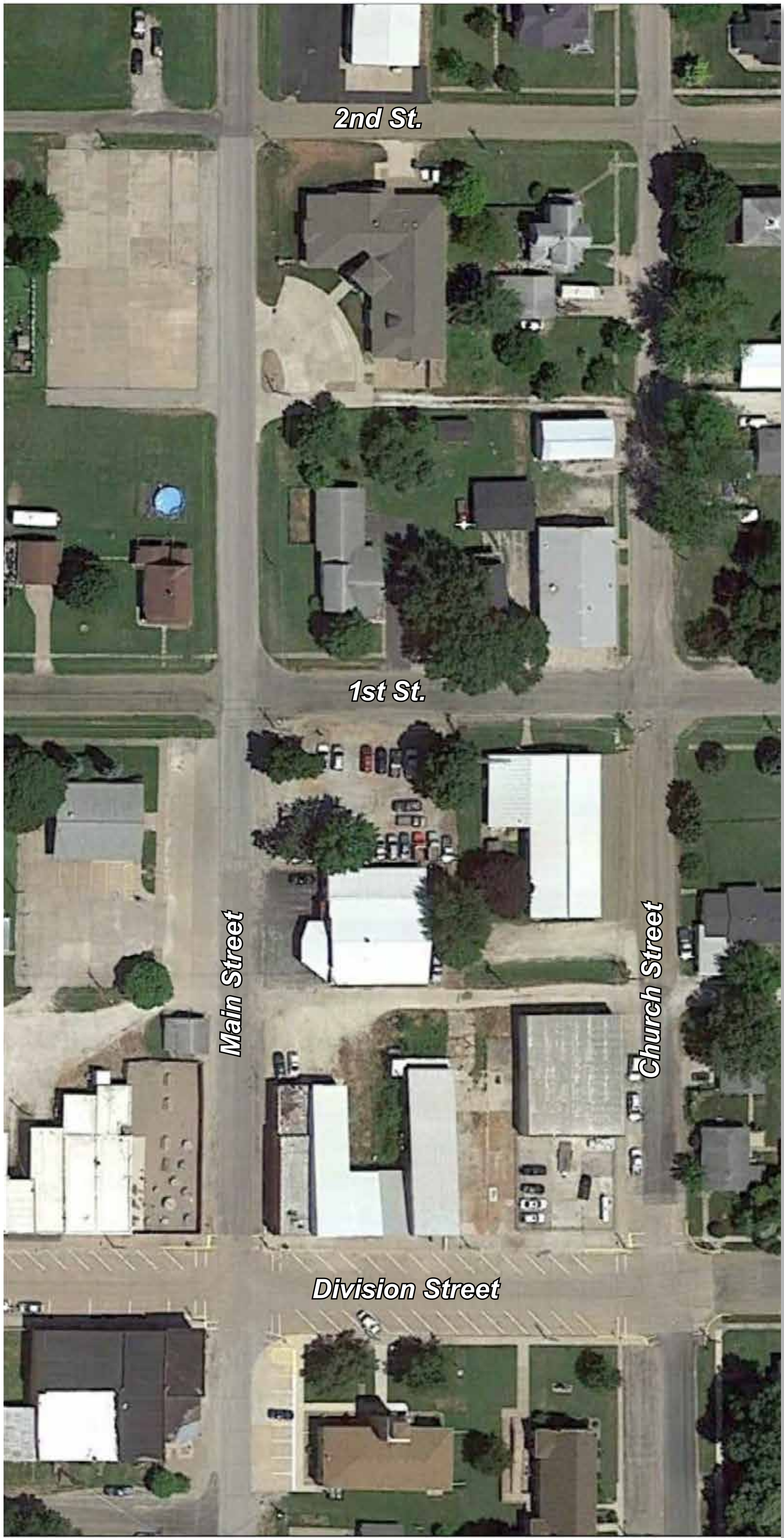
Existing areal of Main St. corridor from Division St. north to 2nd Street.