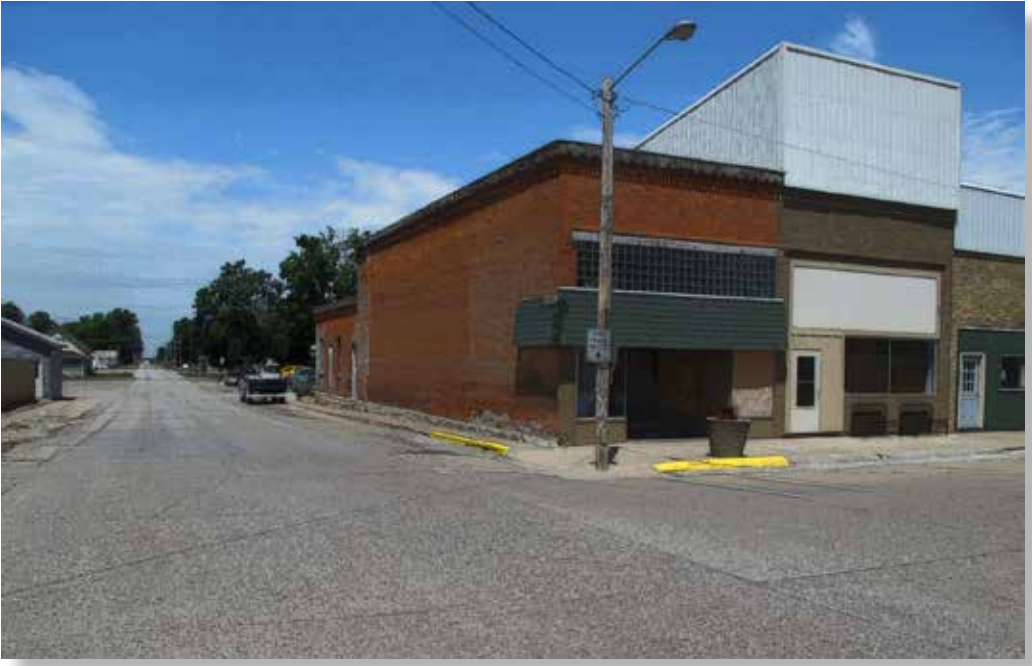
Existing NE Corner of Main St. & Division Intersection