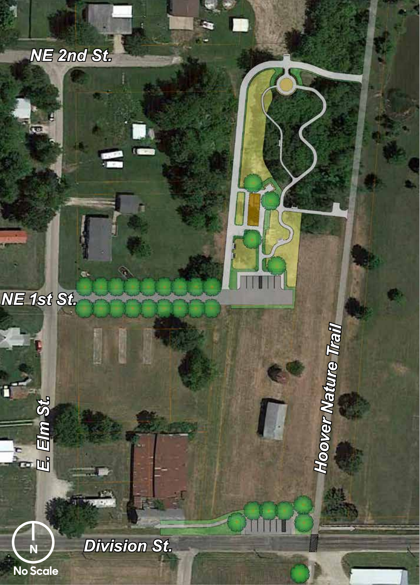
Overview of proposed concept plan for enhancements to county-owned land and to the existing parking lot for Hoover Nature Trail