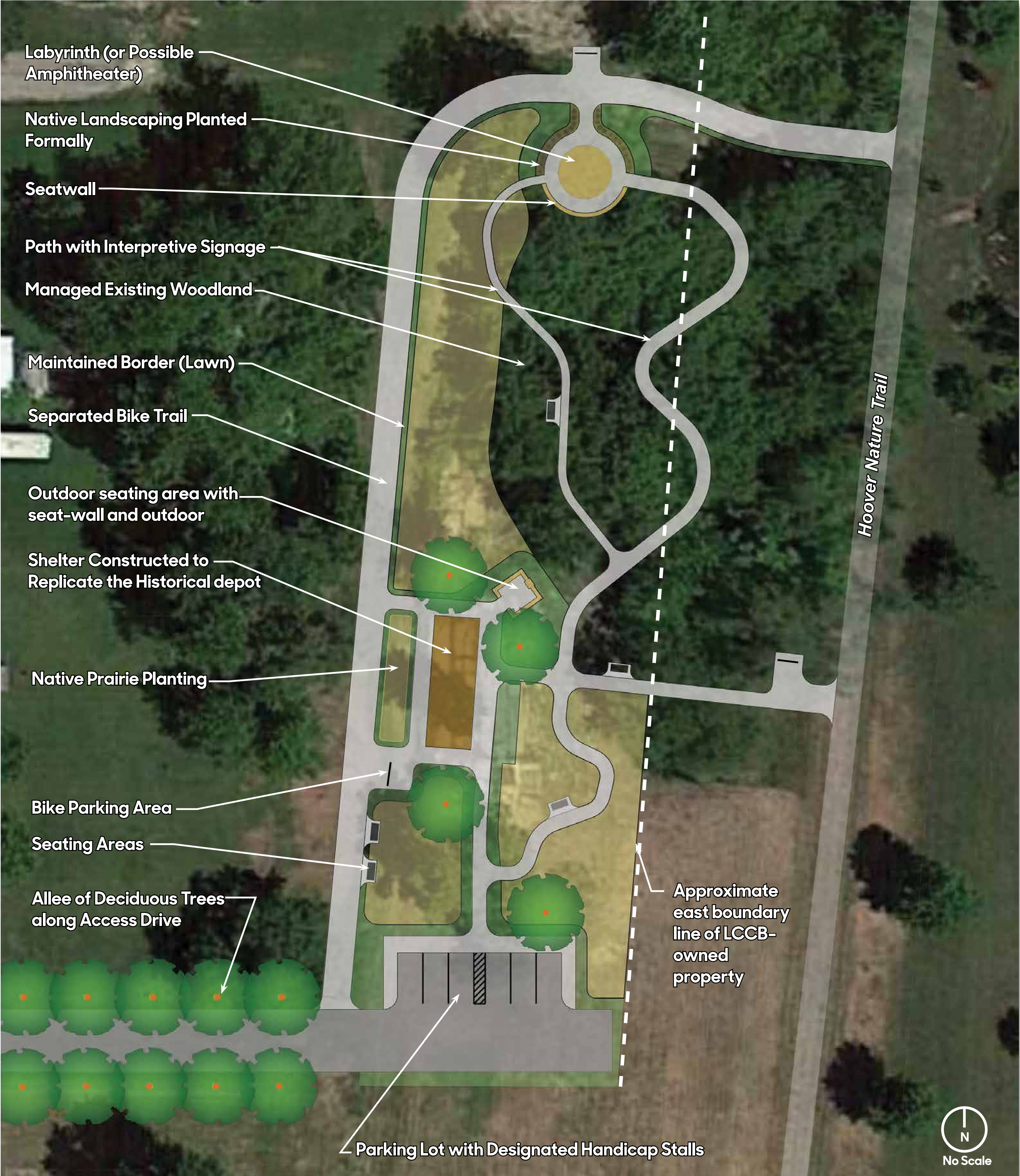
Enlargement of proposed concept plan for county-owned land and public right-of-way located east of the Hoover Nature Trail between NE 1st Street and NE 2nd Street

Greenspace: Hoover Park & Trail Parking The proposed park referenced to in this set of boards as "Hoover Park" is located primarily on property that is owned by the Louisa County Conservation Board (LCCB), or within existing public right-of-way. A small portion of the eastern section of the woodland trail and the connections to Hoover Nature Trail are on privately-owned property. The property owned by the LCCB was once the site of the old railroad depot; however, today it sits fallow, overgrown primarily with herbaceous and woody volunteer species.