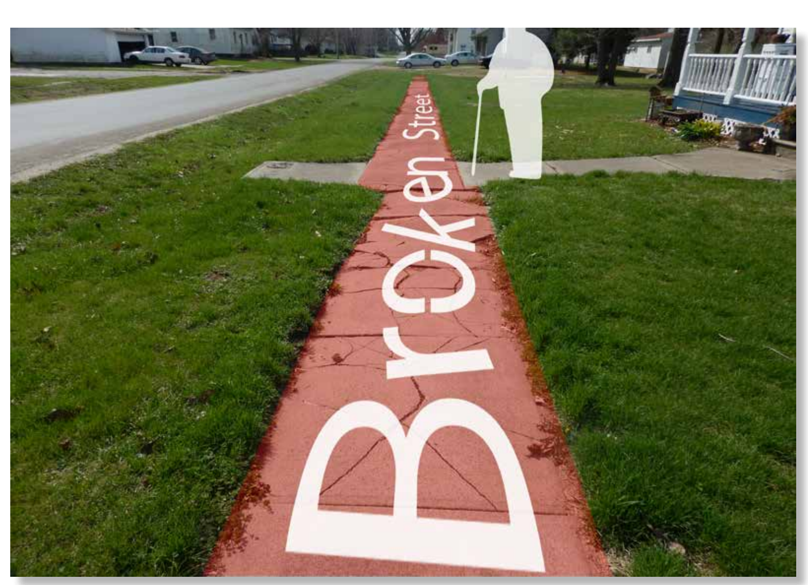
Barrier: Broken Sidewalk on SE 2nd Street