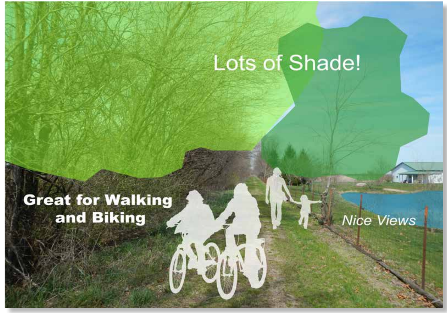
Asset : Hoover Nature Trail