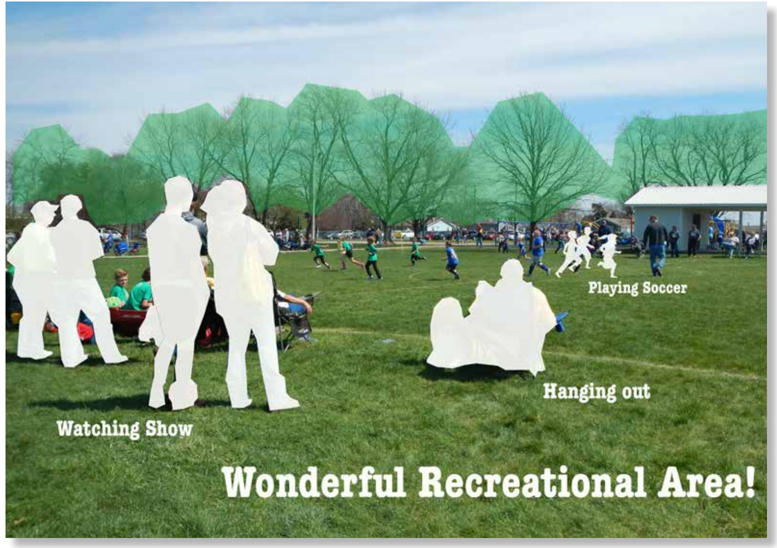
Asset: Morning Sun Park