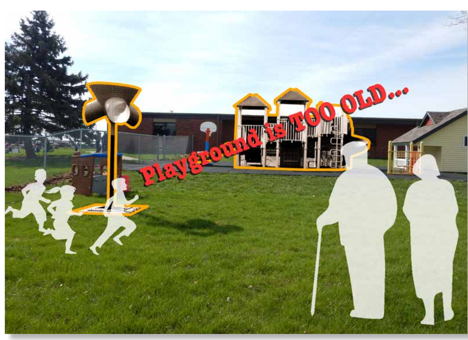
Barrier: Old Equipment in Community School