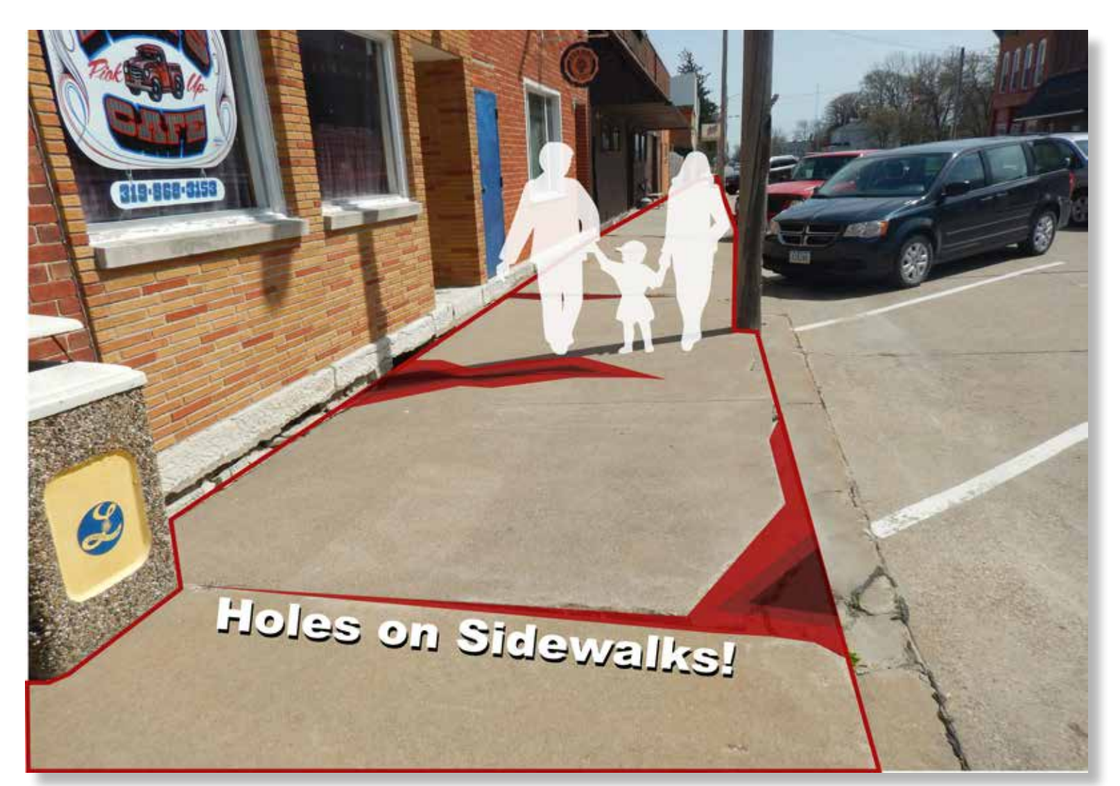
Barrier: Bad Sidewalk on Division Street