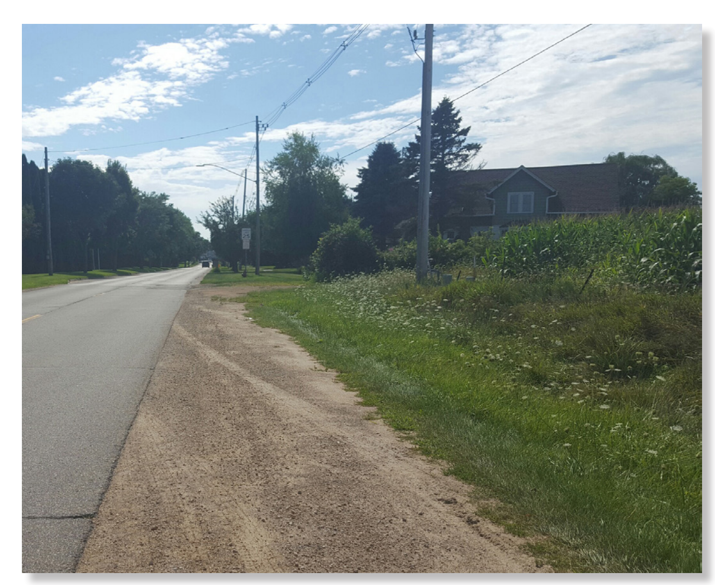
Perspective A: Looking west down County Highway B45.

Additional signage throughout town includes two new park signs for Gateway Park. Along with improved signage at City Park and Garden View Park, elements are already present in these locations along with themes and colors from the city logo.