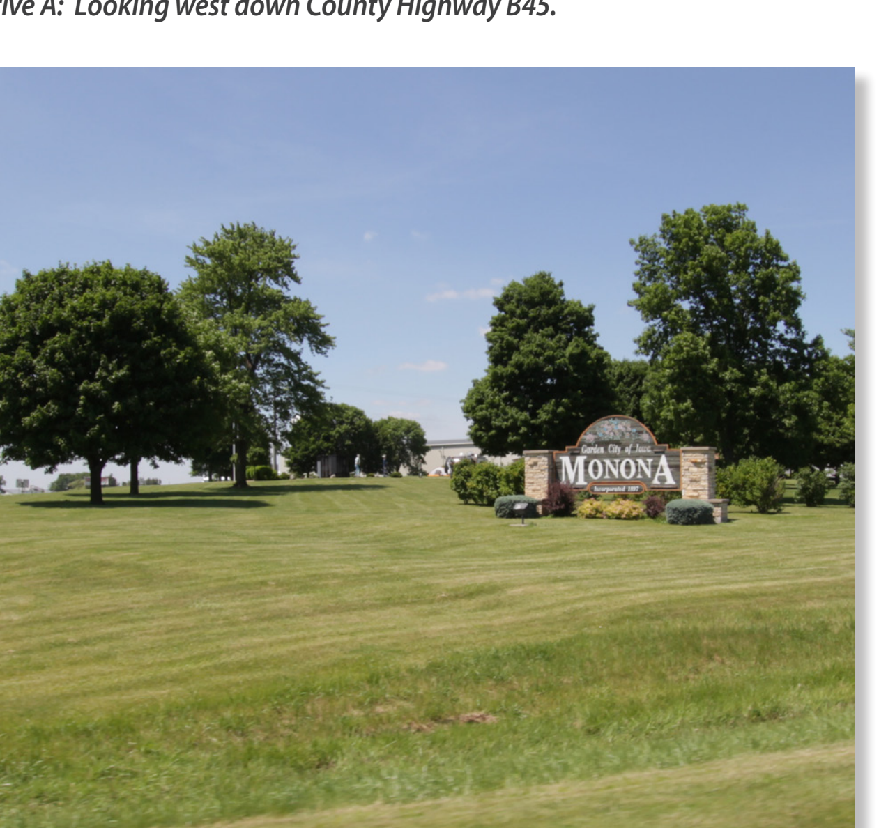
Perspective B: Existing south entry sign at Gateway Park.