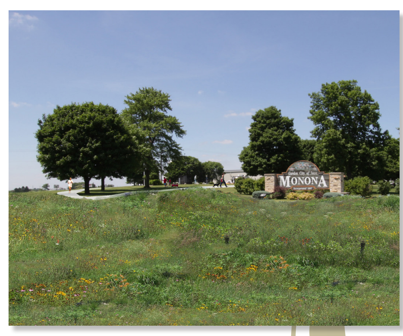
South entry sign with native prairie and proposed trail in Gateway Park