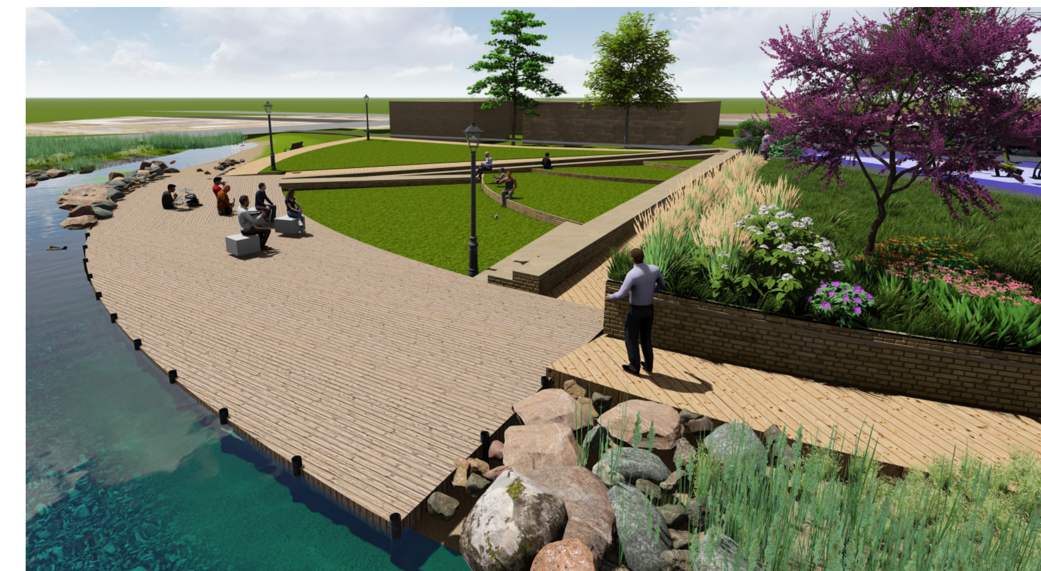
View looking southeast at the amphitheater.