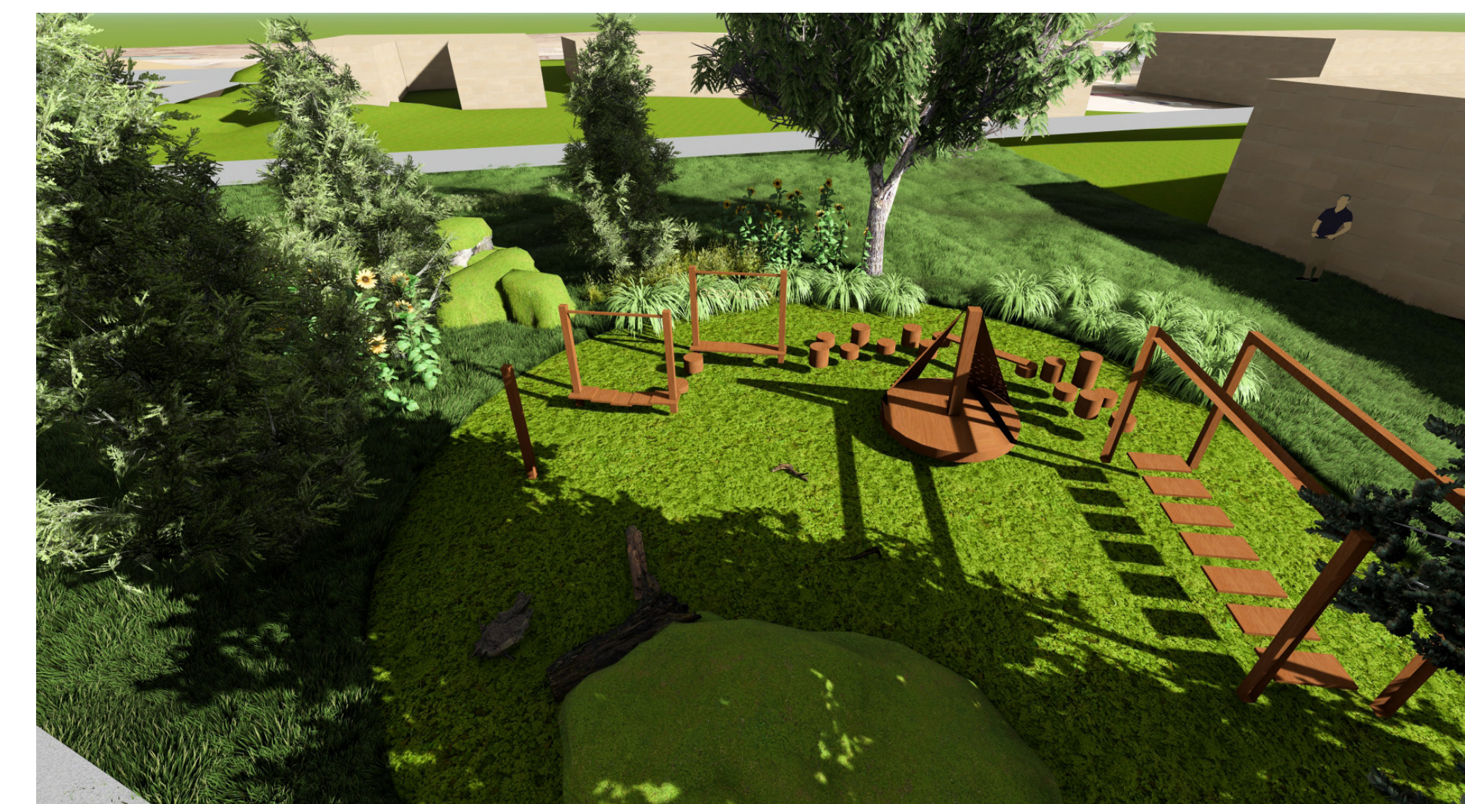
View looking northeast at the nature play field.