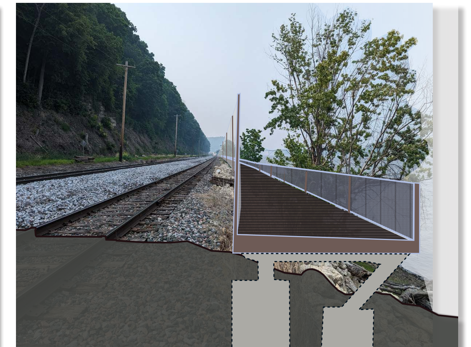
Trail cantilevered over the riverbank. Example looking north of U.S. Fish and Wildlife Center.