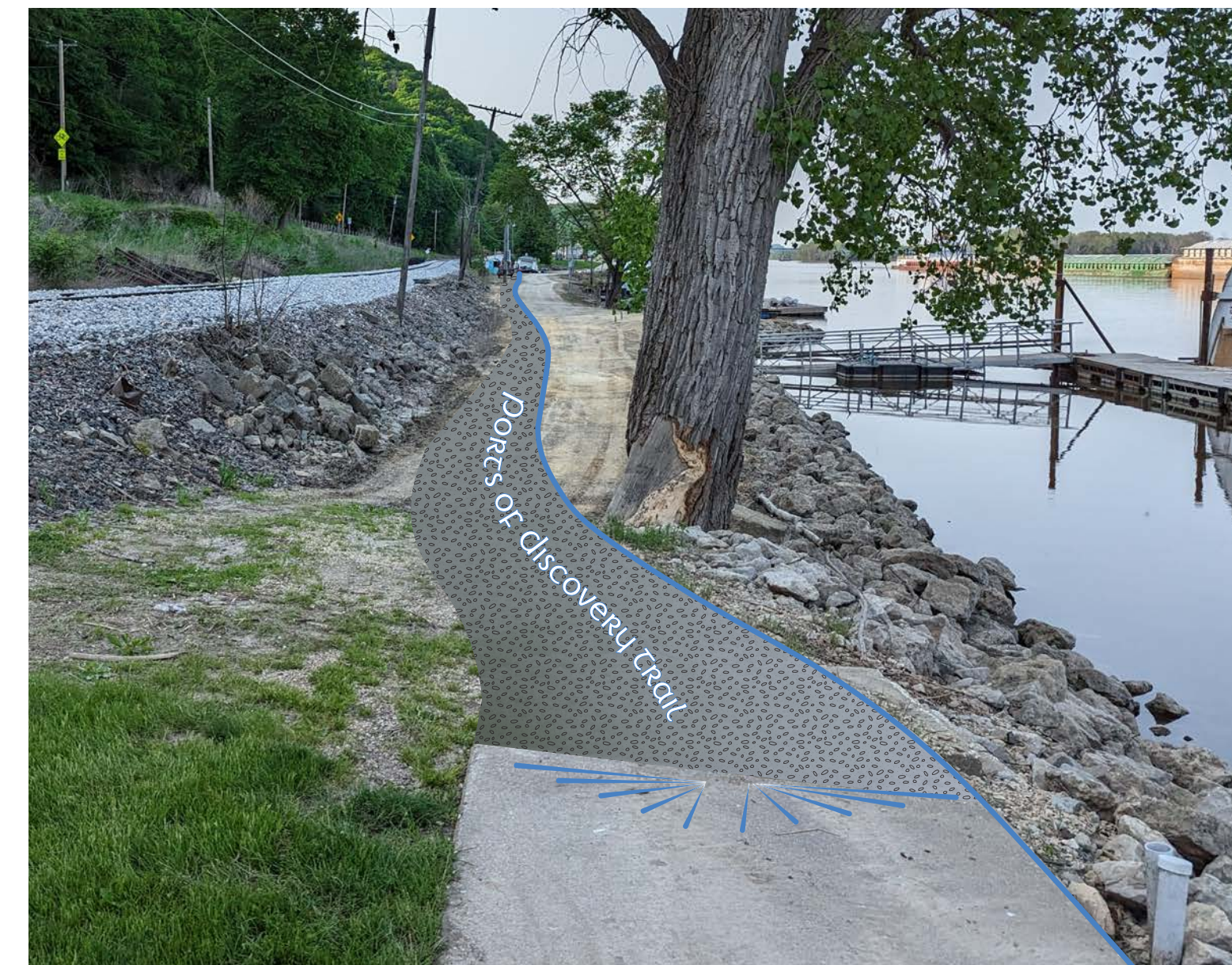
Trail on side of existing gravel road. Example looking up Highway 76 from the north edge of McGregor's Riverfront Park.

The Ports of Discovery Trail is a long-sought-after riverside connection between Marquette and McGregor that builds on work completed in previous studies. Proposed improvements in both towns include all-season trails that act as the backbone to connect Marquette's downtown to McGregor and further south to Pikes Peak State Park. The Driftless Area Wetland Centre and Bloody Run County Park are connected using rescued historic bridges, an existing culvert, and the relocated casino pedestrian bridge. Residents and visitors alike are able to safely cross existing railroad tracks, highways, and Bloody Run Creek. A network of trails, trailheads, bike lanes and signage crisscrosses wooded areas surrounding both towns, enhancing the active transportation and recreation opportunities for residents and visitors.