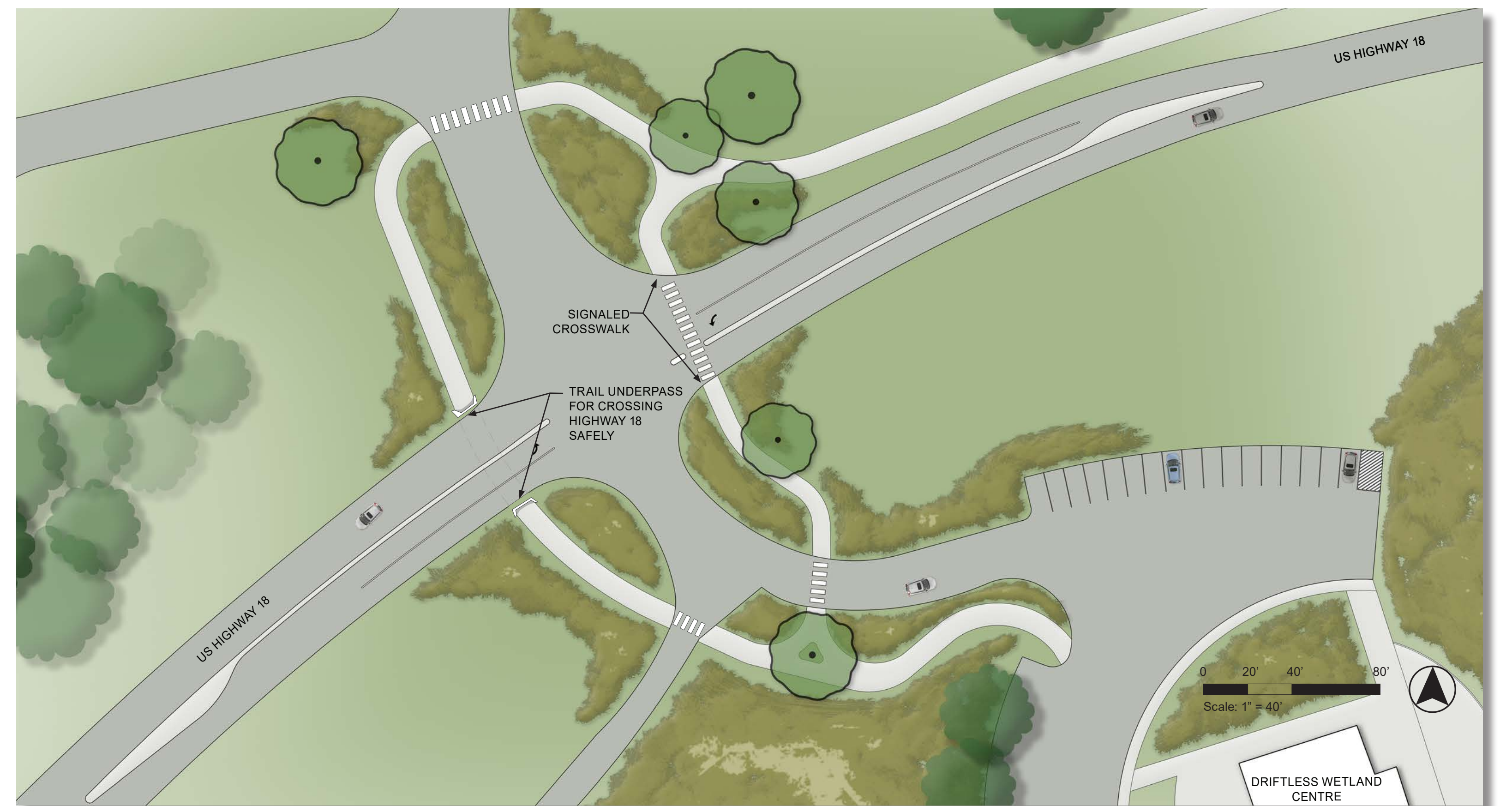
A series of trail connections for pedestrians and cyclists to safely cross over Highway 18 to the Driftless Area Wetland Centre.