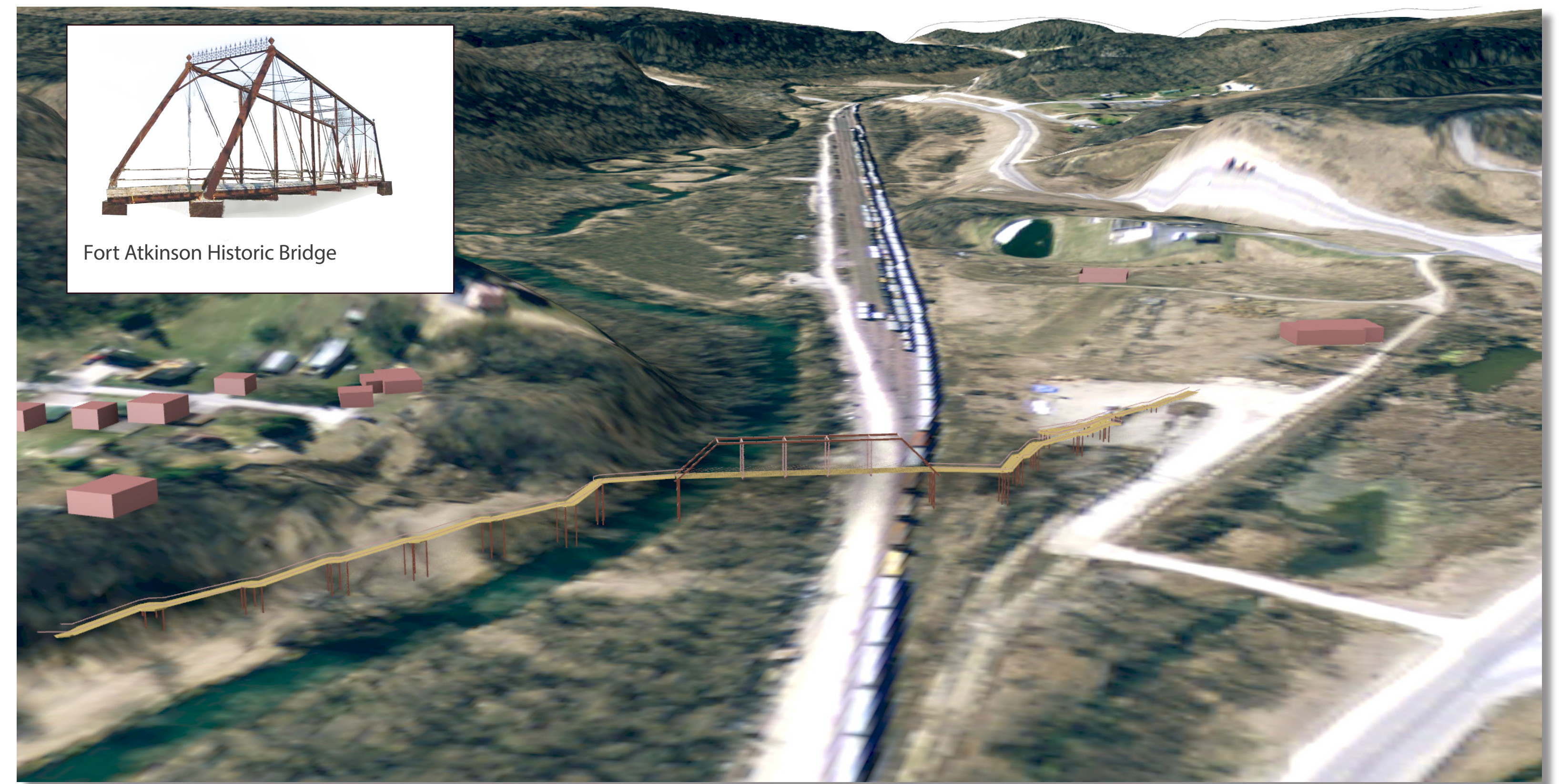
Elevated bridge and trail connects The Bench neighborhood over Bloody Run and the railroad tracks to the Driftless Area Wetland Centre and includes a relocated historic bridge.