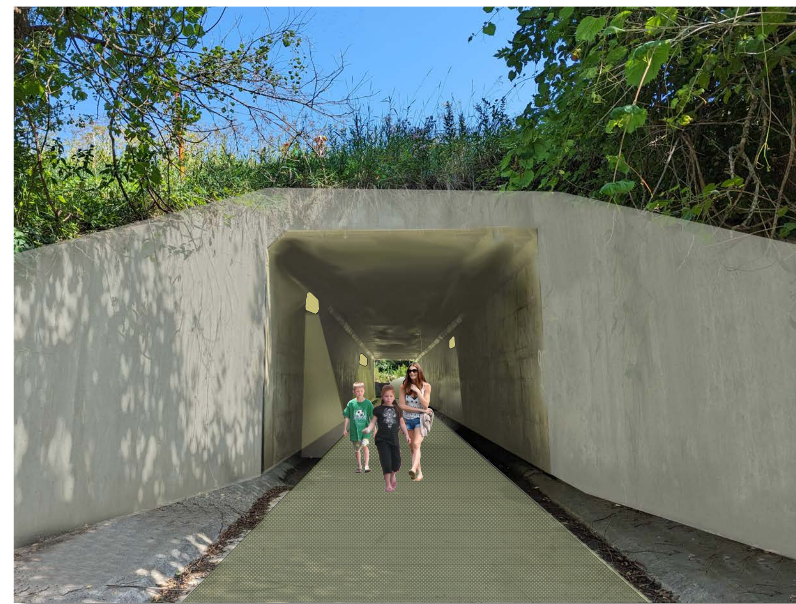
Utilizing an existing culvert under Highway 18, an underpass with lighting and grating would serve as a trail connection.