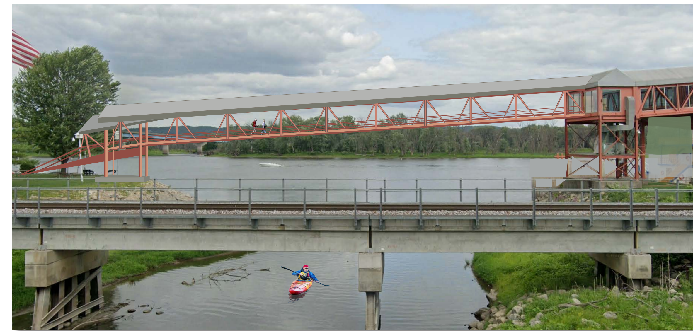
The casino bridge is rotated over Bloody Run Creek as part of the pedestrian access trail over the railroad tracks and 1st Street and the start of the Ports of Discovery trail. View shown is looking east from 1st Street.