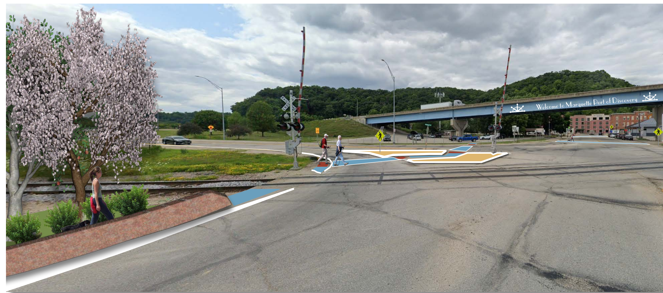
1st Street and Highway 18 intersection improvements include colorful painted crosswalks and signaled pedestrian signage. Plantings and stone half-walls along Highway 76 provide a more comfortable pedestrian experience.

Re-purposed pedestrian bridges, painted crosswalks, and updated crossing islands address pedestrians' safety concerns along 1st Street. Downtown crosswalks with pedestrian-activated crossing signs bring attention to walkers and help to slow traffic. Flowering trees provide shade. A half-wall protects sidewalk users. A wide trail with a new route from The Bench connects to the sidewalk on the west side of 1st Street and the pedestrian bridge. The casino bridge is reconfigured to add outdoor elevator and stair access, providing safe crossing of 1st Street, the railroad tracks and Bloody Run Creek. Exiting the pedestrian bridge southbound leads to the Ports of Discovery Trail to McGregor.