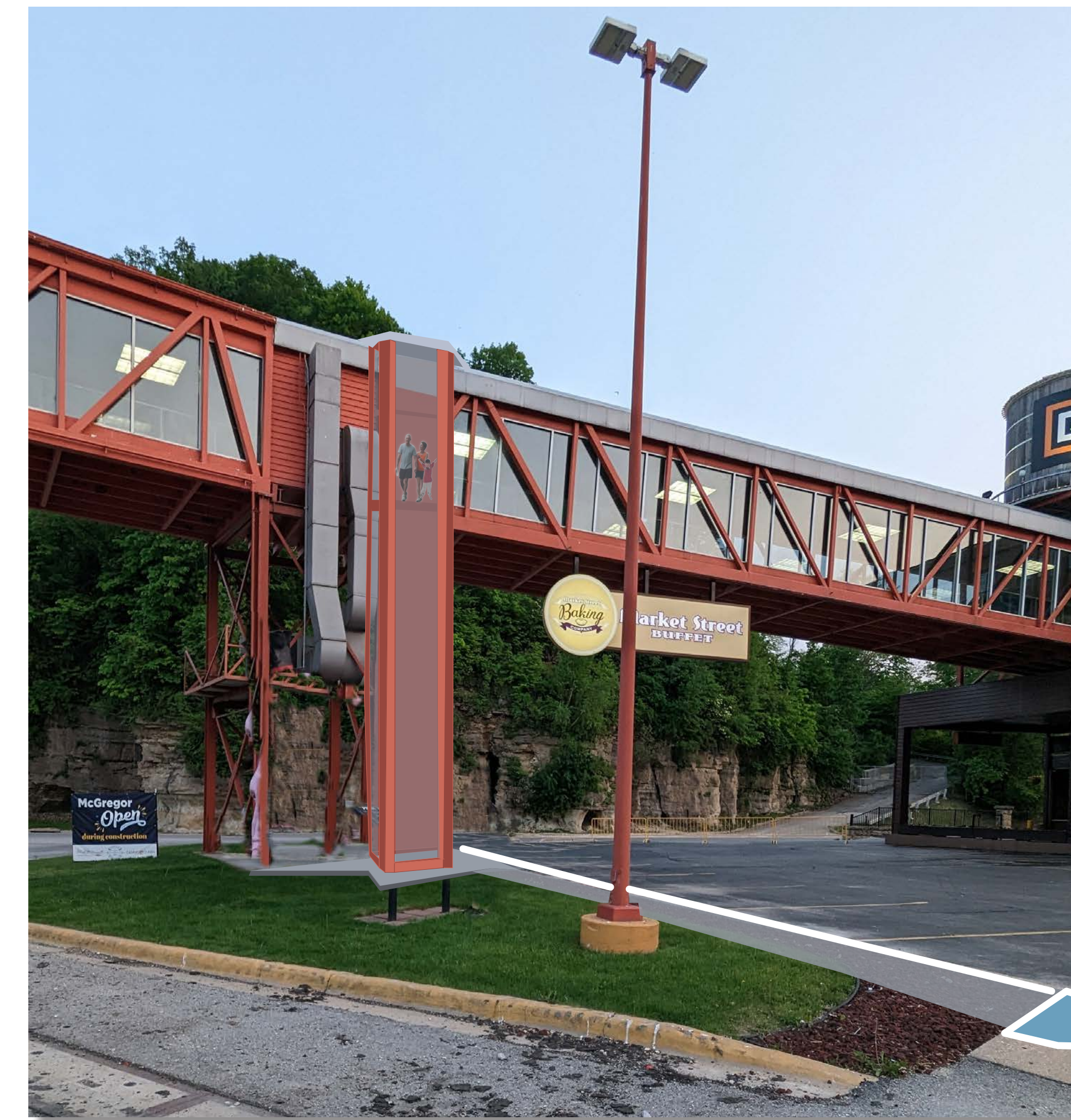
Former casino pedestrian bridge connects all users from The Bench to the river with an elevator and new trail, facilitating passage to the river park and Ports of Discovery Trail.