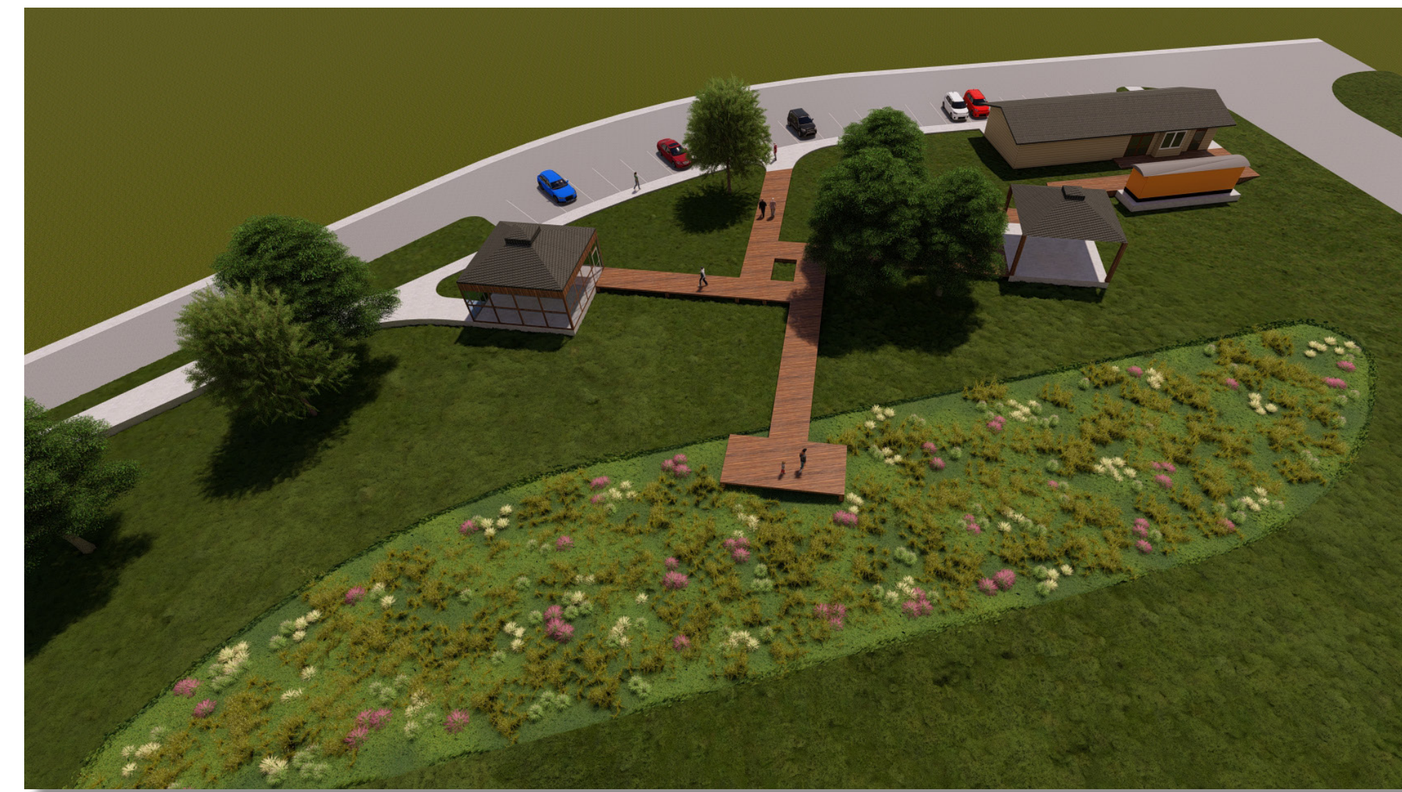
View looking north of the wetland boardwalk reveals the relationship between the rest area and Depot Museum. The path connects to the existing trail leading toward the wetland center.