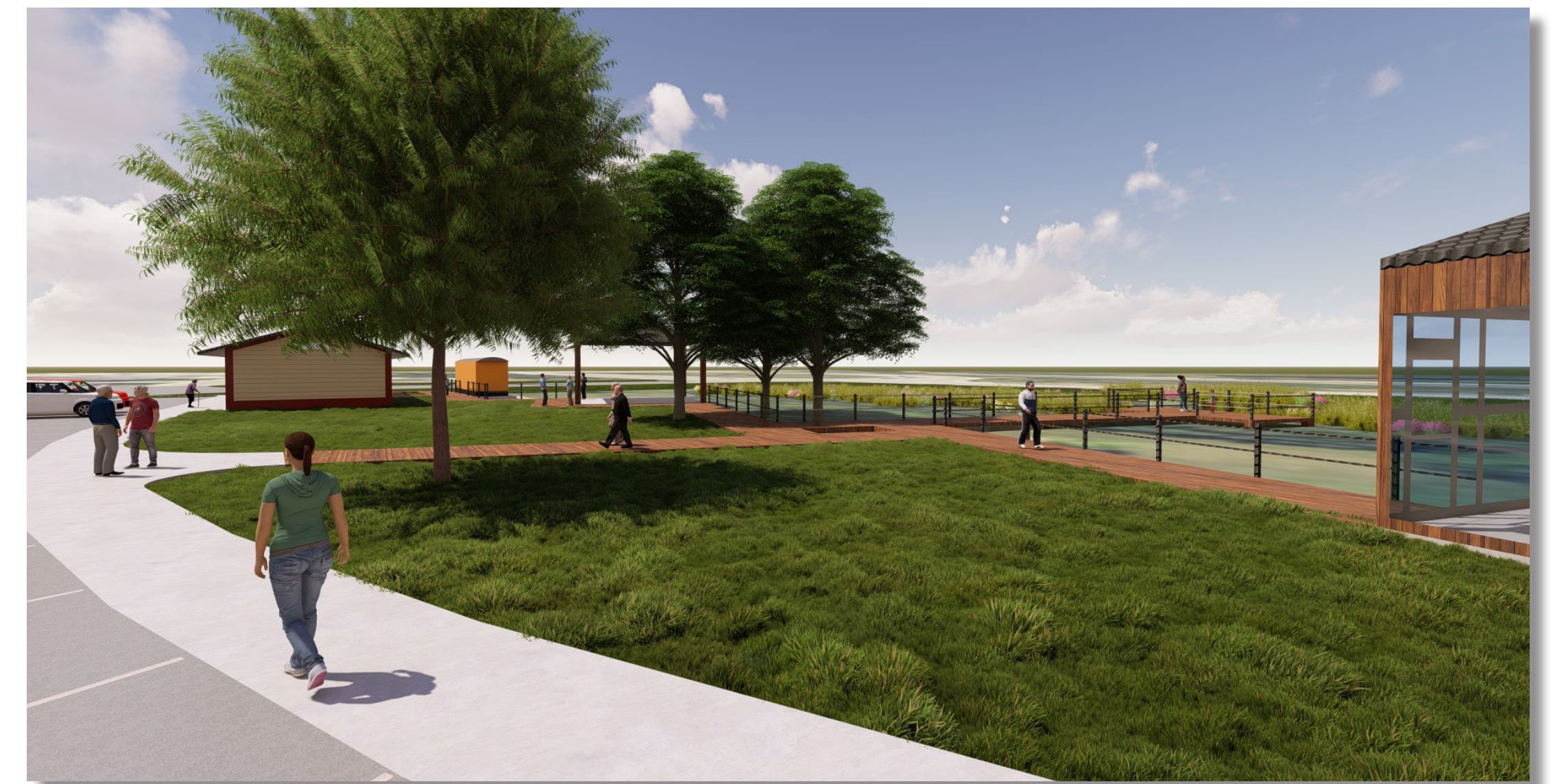
Perspective looking southeast of the walkway connecting the restroom building to the boardwalk, shelter, and the Depot Museum.