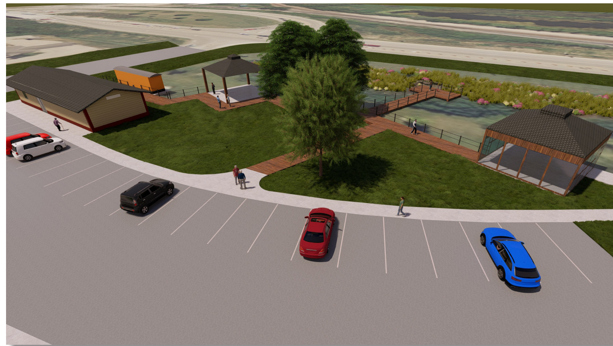
Bird's-eye view of the rest area looking southeast toward Highway 18.