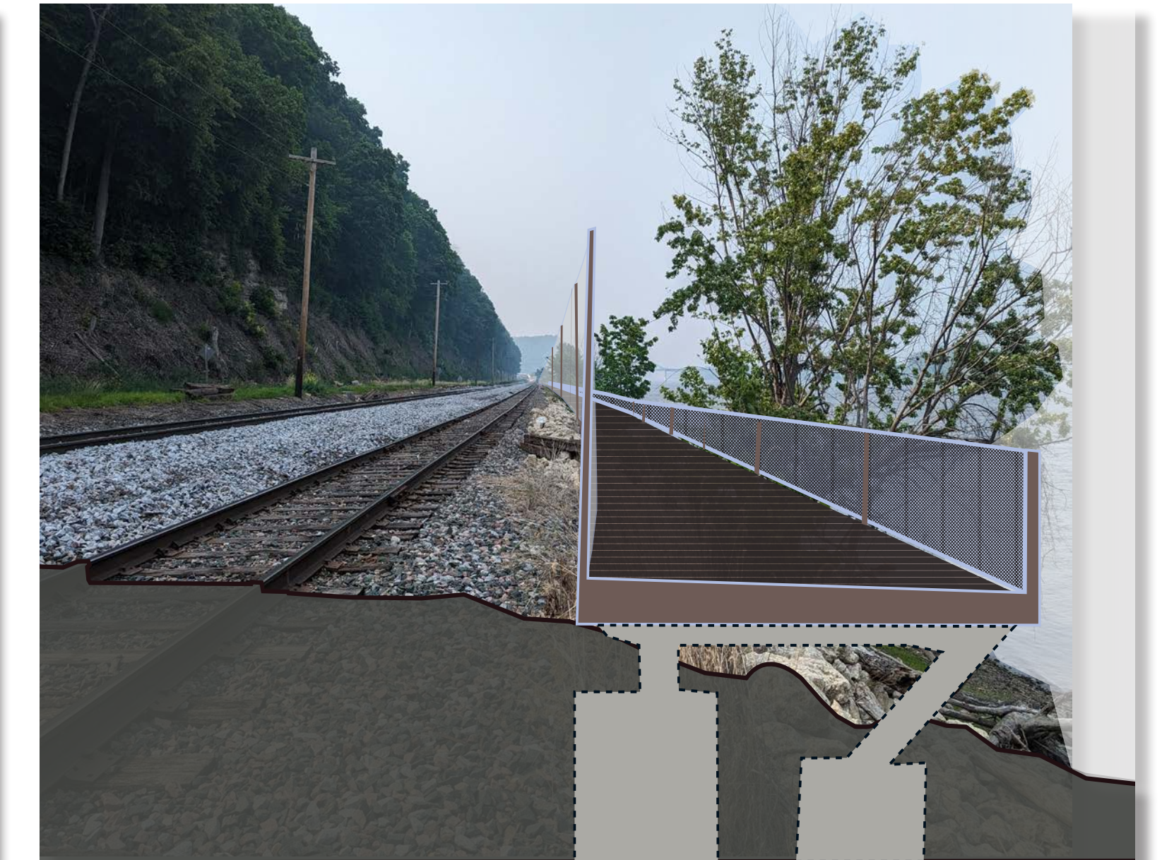
Trail cantilevered over the riverbank. Example looking north of U.S. Fish and Wildlife Center.