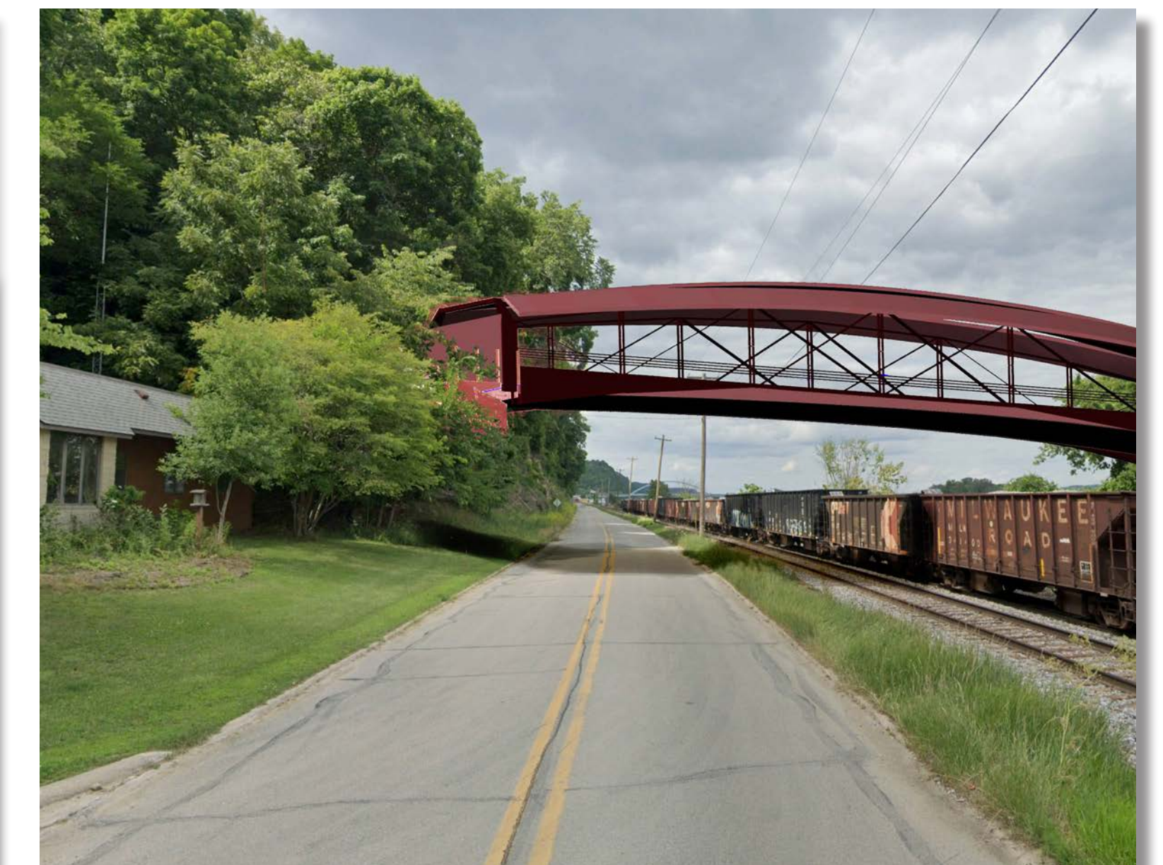
Looking north along Great River Road, the wildlife center is situated perfectly as a trailhead that allows accessibility to the riverbank and to the cliffside trail.