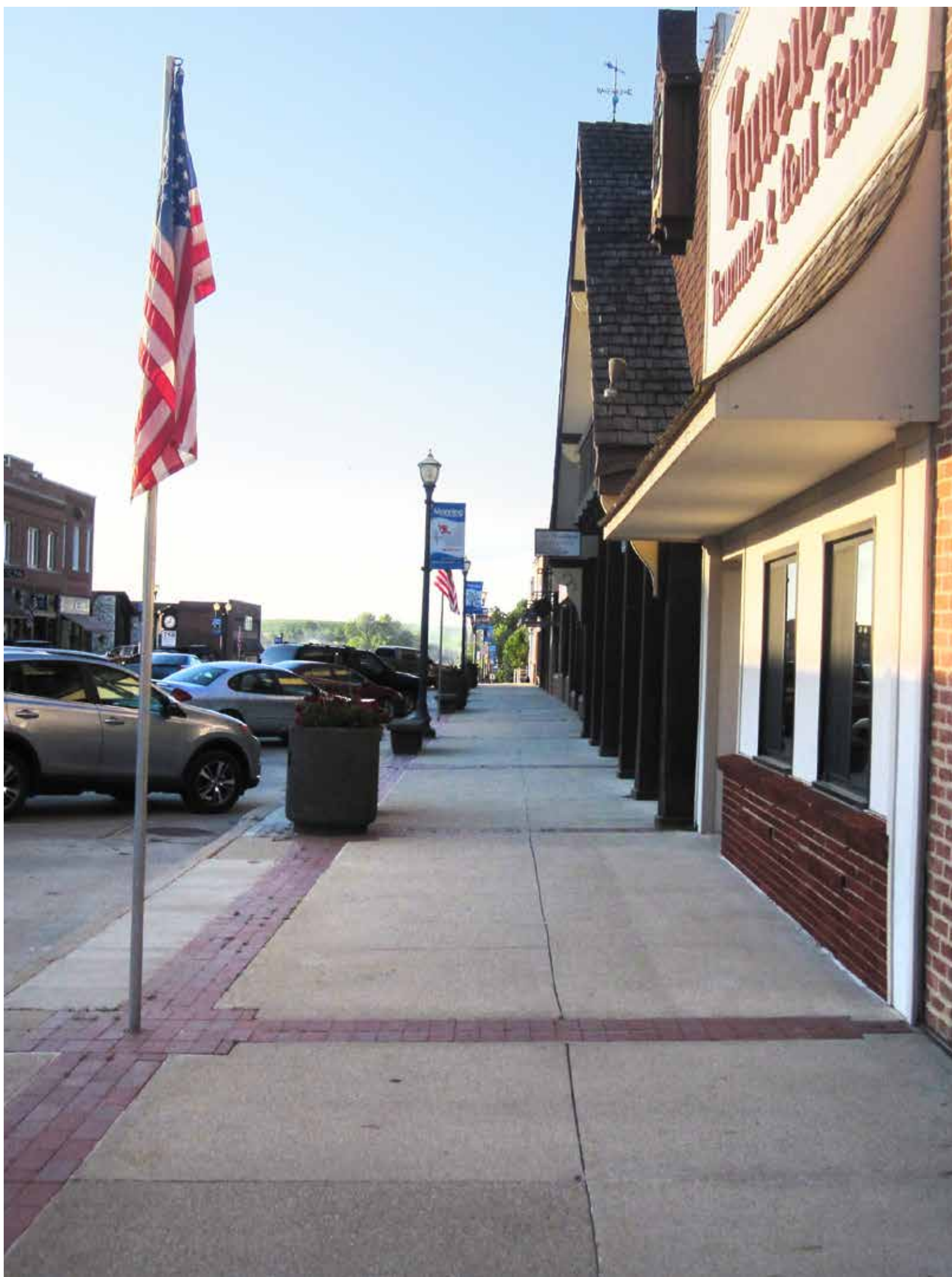
View North, Existing Pedestrian Corridor