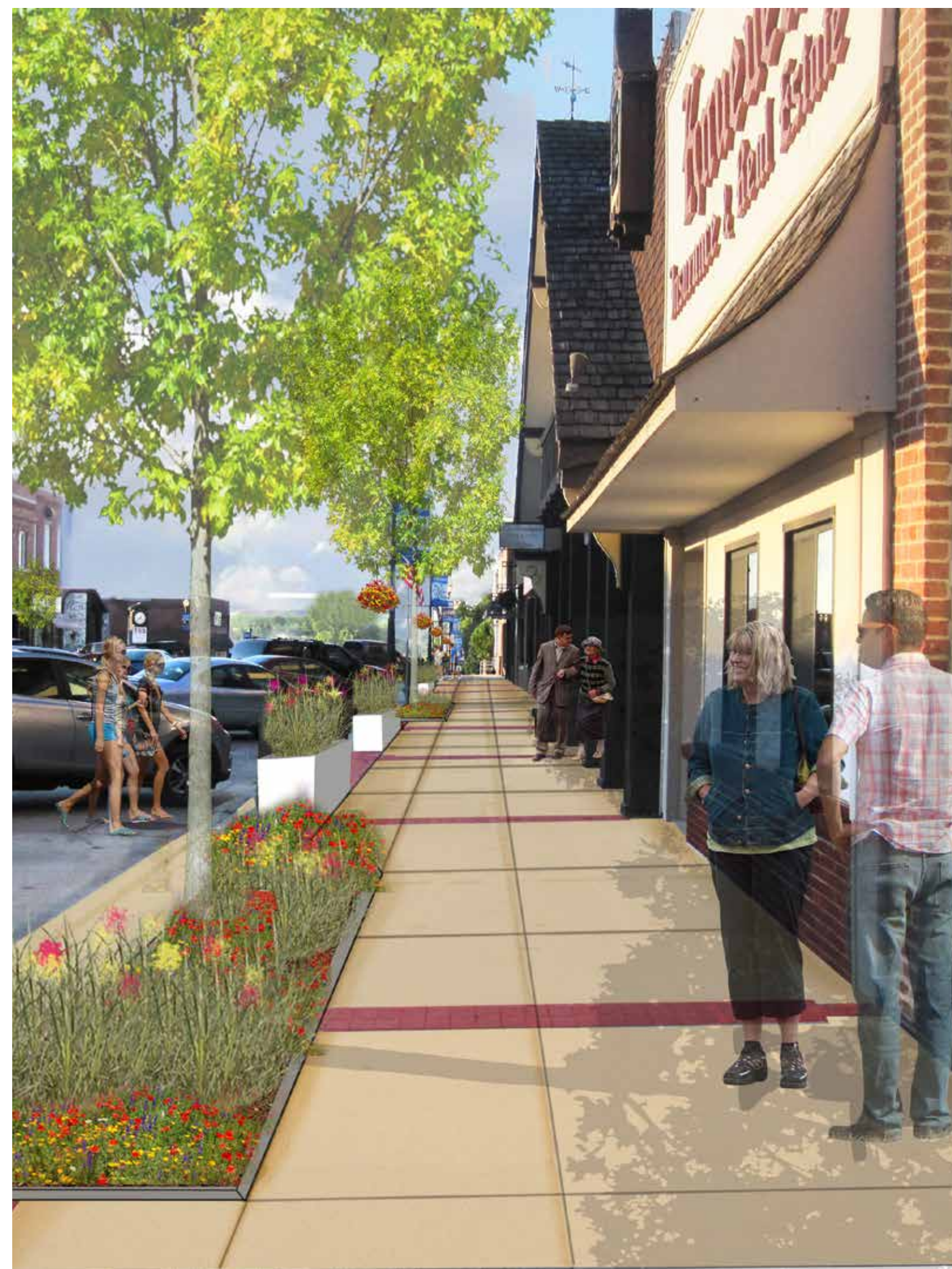
View North, Proposed Pedestrian Corridor Improvements