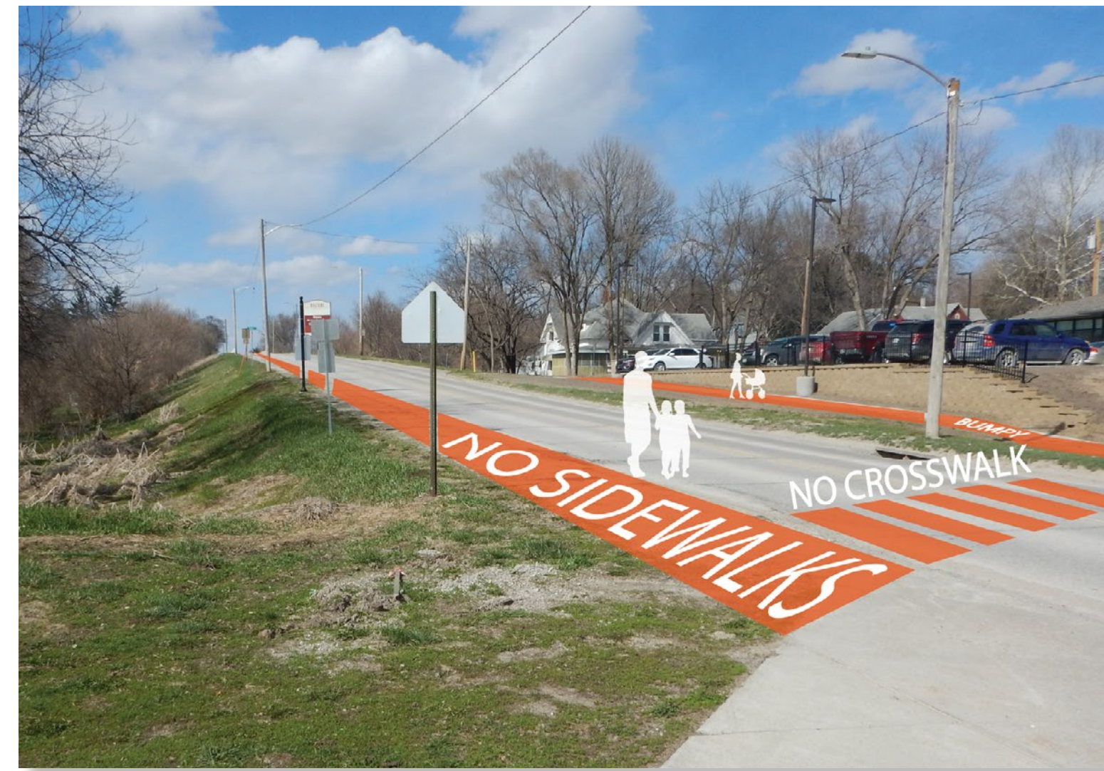
There is no sidewalk nor safe crossing along Main Street from downtown to East Mills High School, so the kids have to walk in the street.