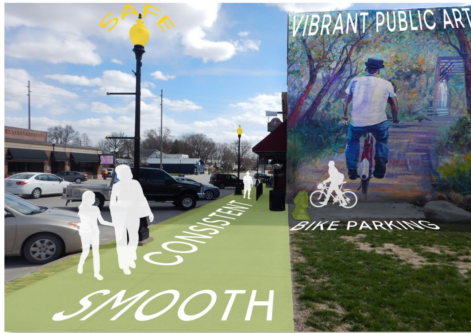
Main Street has smooth and consistent sidewalks, curb cuts, bike parking, and public art, which make walking an enjoyable experience.