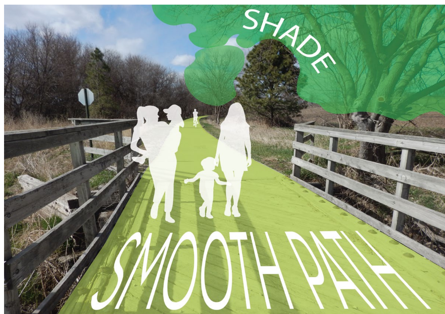
The Wabash Trace gives residents easy access to nature and has a dense tree canopy that provides shade.