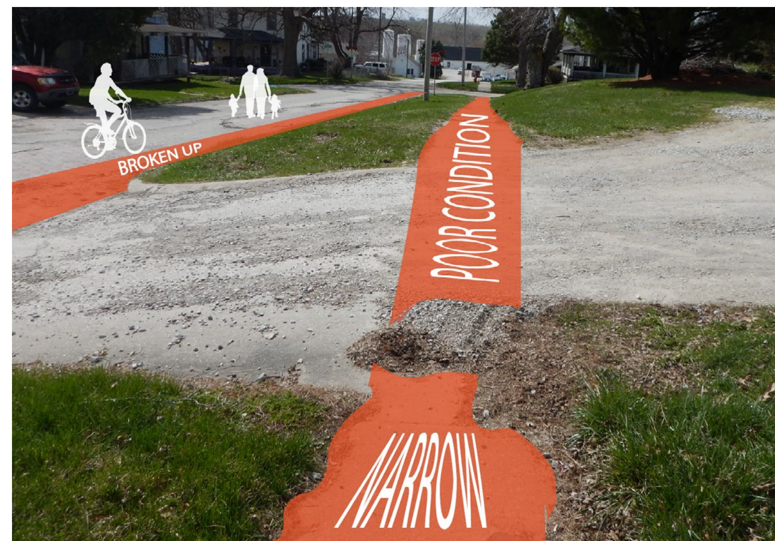
The sidewalks along 6th Street are narrow and in poor condition, so people resort to walking in the street.