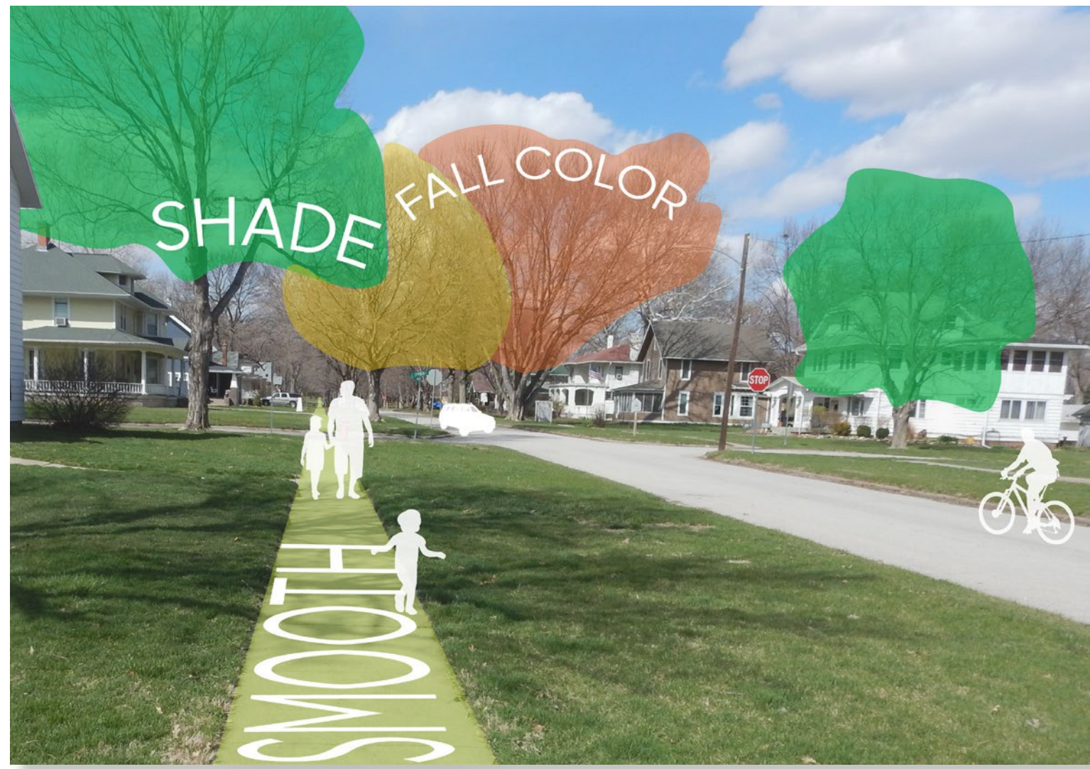
Marion Avenue has smooth sidewalks and a tree canopy that provides shade in the summer and color in the fall.