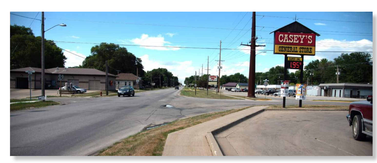
Existing view of intersection looking north

Highway 210 bisects the north and south portions of Madrid and is subject to heavy vehicular traffic. Currently, wide roads and too many access points make the intersection of Highways 201 and 17 welcoming for pedestrians and feel unsafe. This design proposes closing down the Annex Road access along Highway 210 to limit the directions of oncoming and turning traffic. New crosswalk paint and plantings will help pedestrians feel safer and will provide Madrid residents with a more walkable and bikable road system.