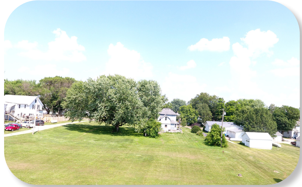
Photo 1: Existing undeveloped city property taken from the western property line looking easterly towards Western Street.

The community garden is proposed to be located on existing city-owned property on the west side of town. The property is currently maintained lawn with a small area planned for the future site of the city's new well pump house.