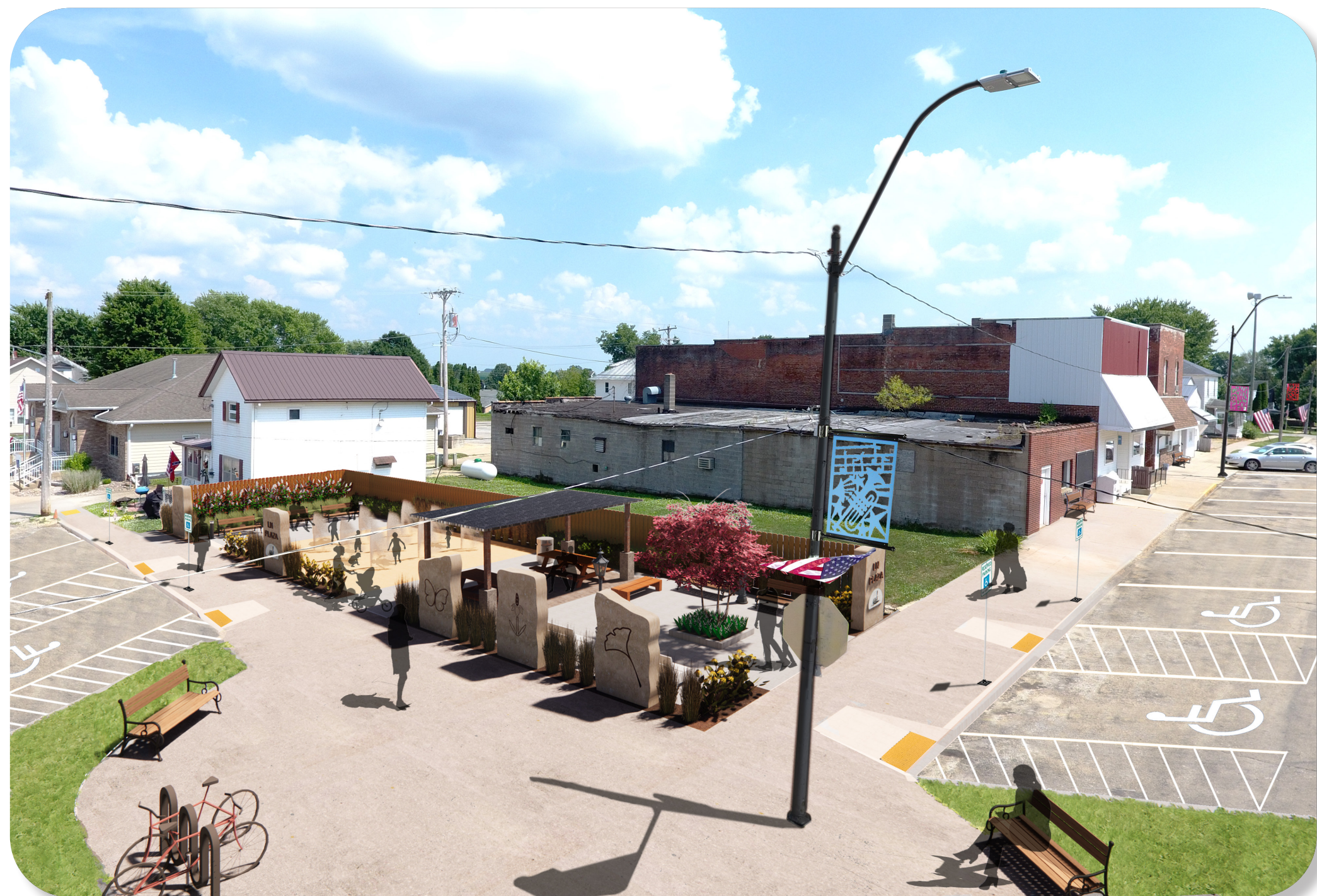
Photo 1 Edit, Concept 1: Proposed enhancements for the pocket park located on city property.