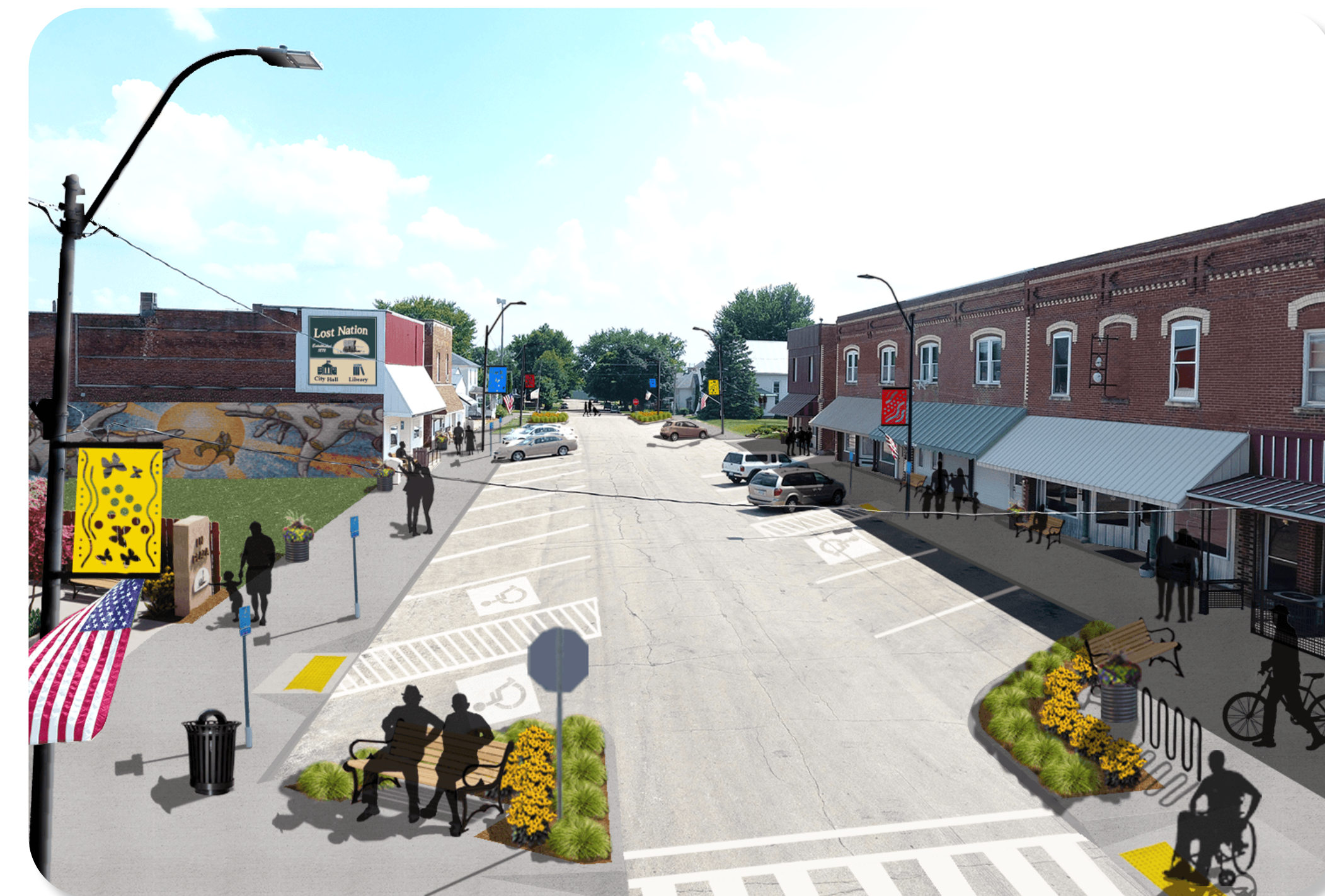
Photo 3 Edit: Proposed enhancements include: landscaped intersection bump-outs, reconstructed sidewalks for improved circulation and accessibility, coordinated site amenities, wall murals, painted vehicular lights with metal banners, and signage to identify public destinations.

(Downtown Concept - continued from board 10)