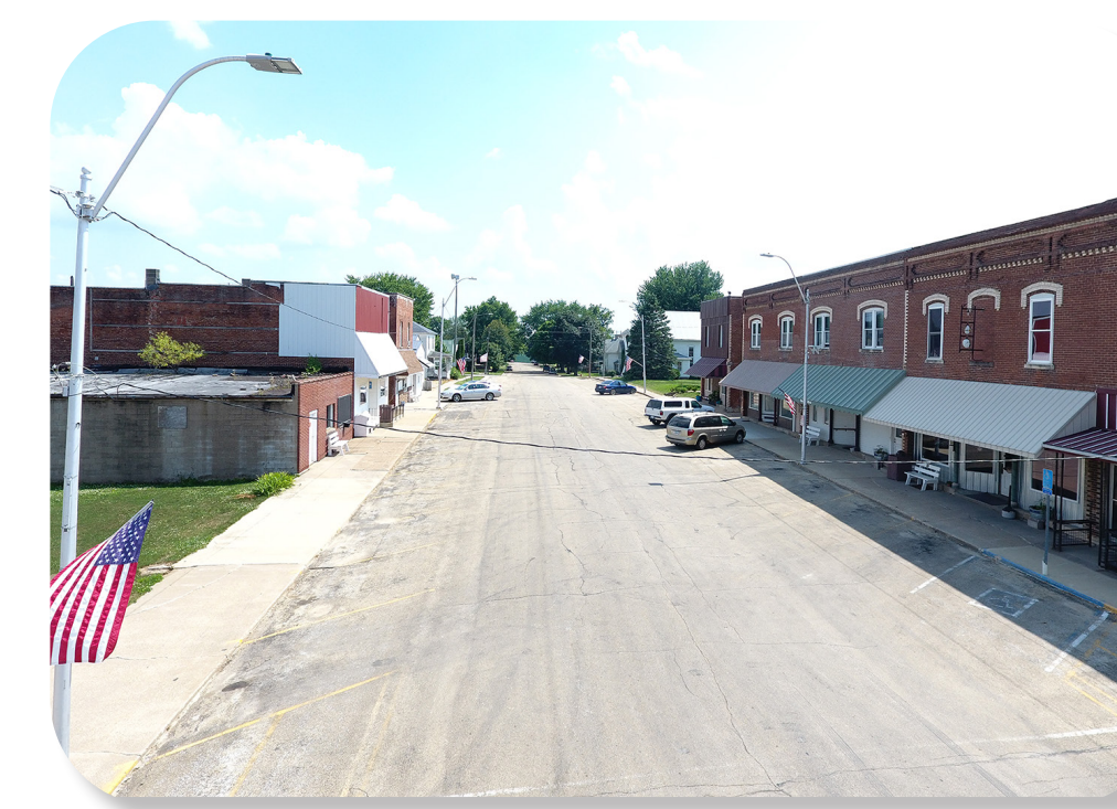
Photo 3: Looking southerly along the existing downtown Main Street corridor from the southeastern corner of the Main Street and Long Avenue intersection.