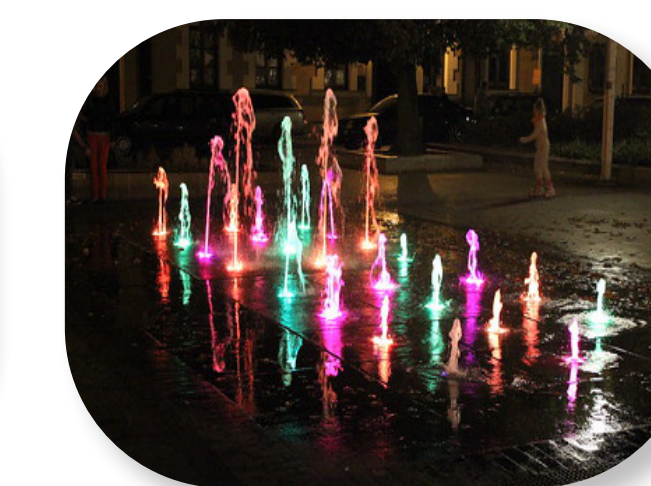
Dry fountains such as those proposed in both Pocket Park concepts are a great way to integrate water into an urban area. They are aesthetic, provide movement, and the sound can be calming. They also provide an opportunity for all ages and abilities to cool off during a hot summer day. Added lighting, whether white or colored, can create a dramatic and intriguing visual at night.