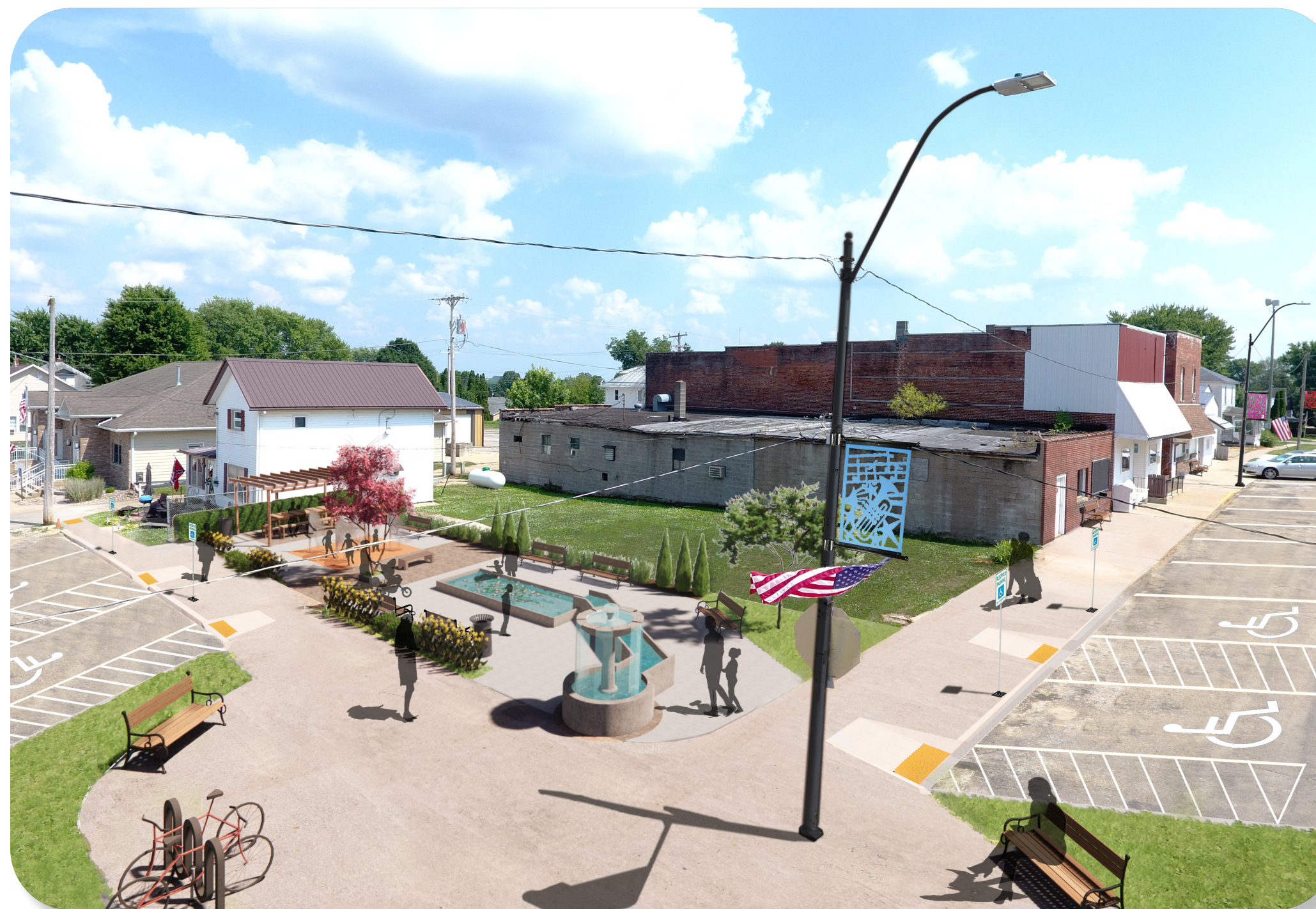
Photo 2 Edit, Concept 2 (Alternative to Concept 1): Proposed enhancements for the pocket park located on city property.