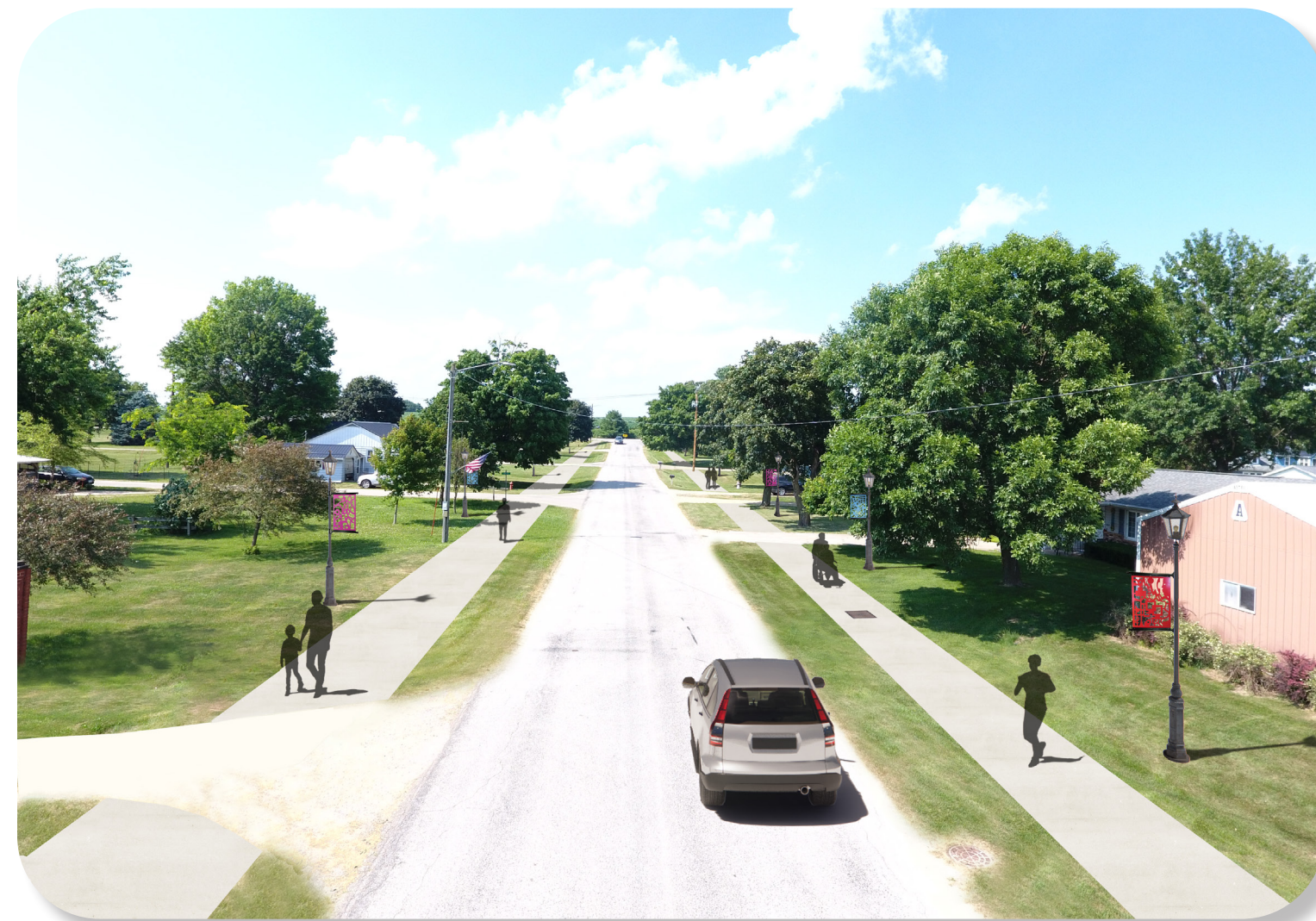
Photo 1 Edit: Proposed enhancements include a paved separated trail, ADA-compliant sidewalk, decorative lights with banners, and drainage improvements to accommodate the enhancements.