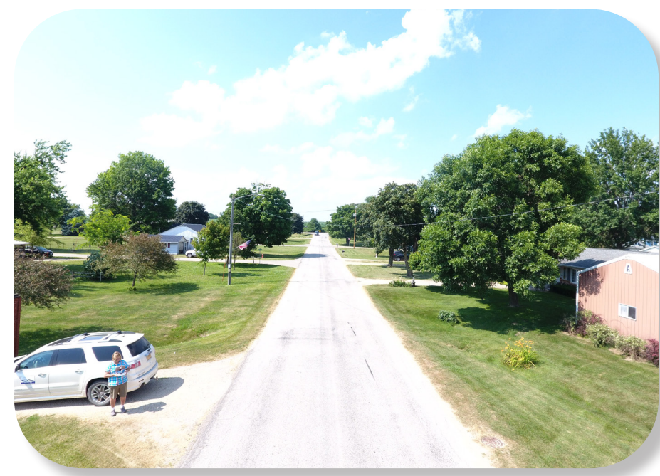
Photo 1: Looking northerly along existing North Main Street just north of its intersection with Railroad Avenue