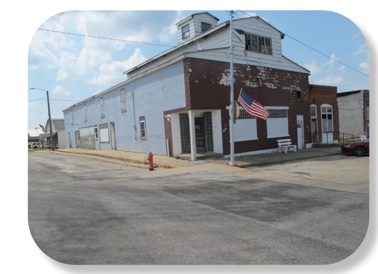
Steps in downtown area