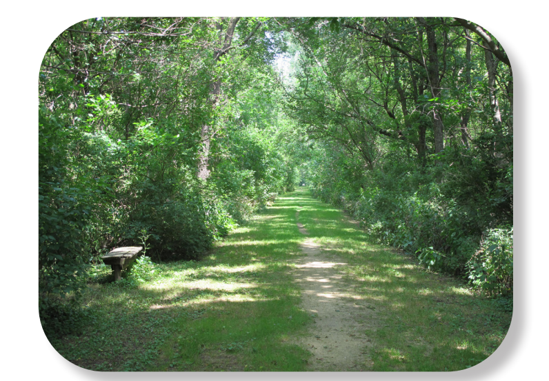
Rustic Run trail