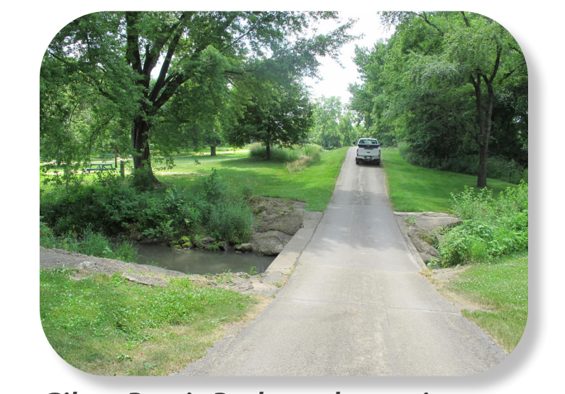
Gilroy Rustic Park creek crossing