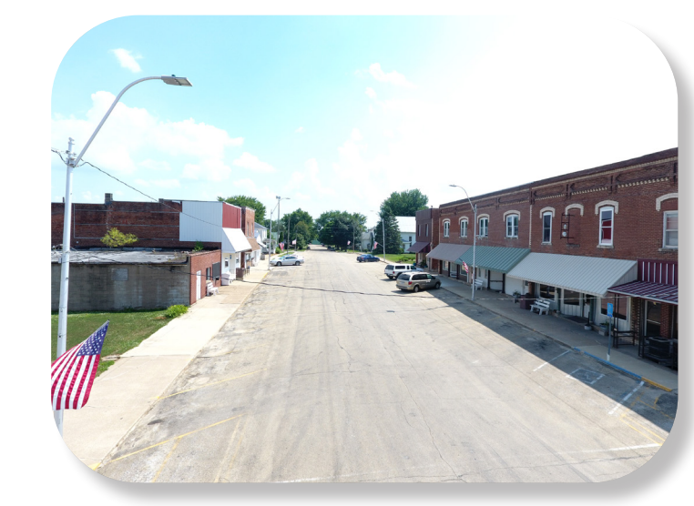
Downtown and Main Street