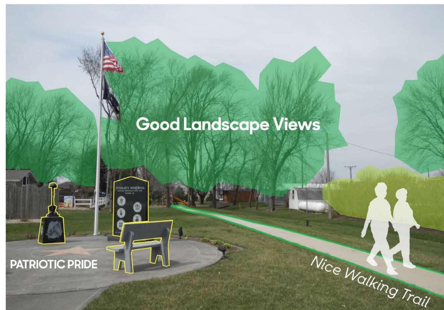
Asset: Veterans Memorial