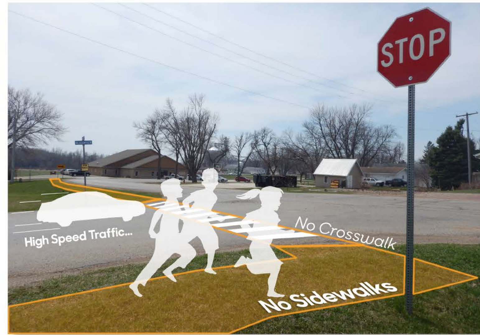
Barrier: No Sidewalks on Meadowview Street