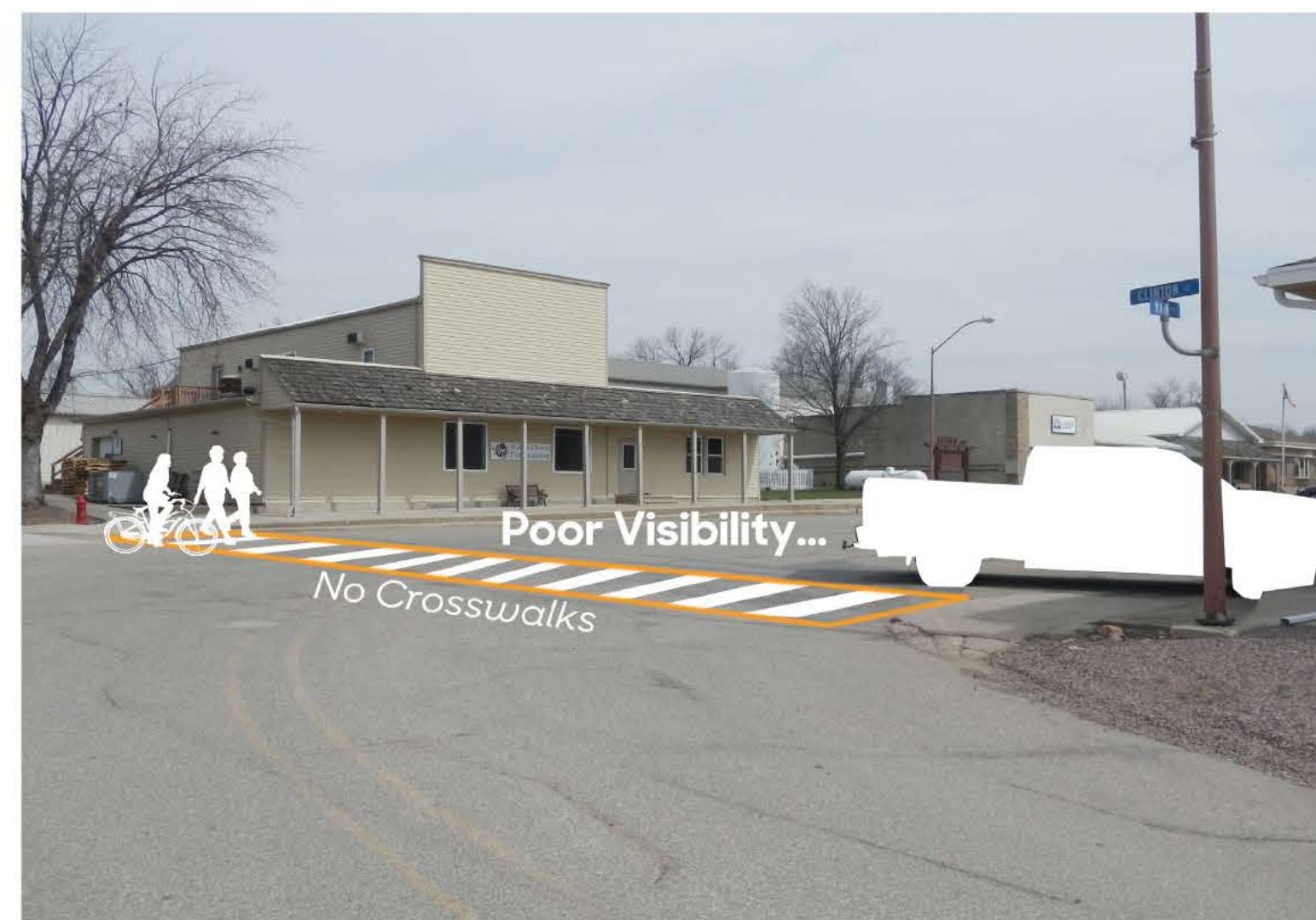
Barriers: Unsafe Intersection on Main Street