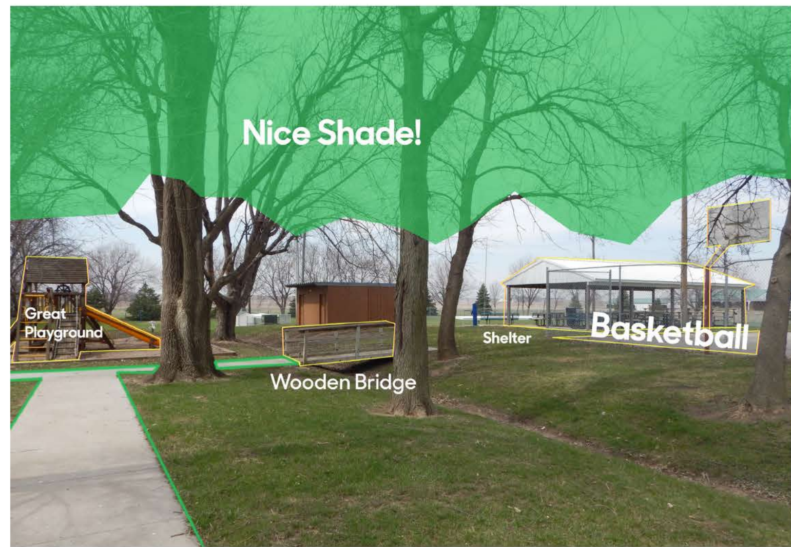
Asset: Ball Diamond Park