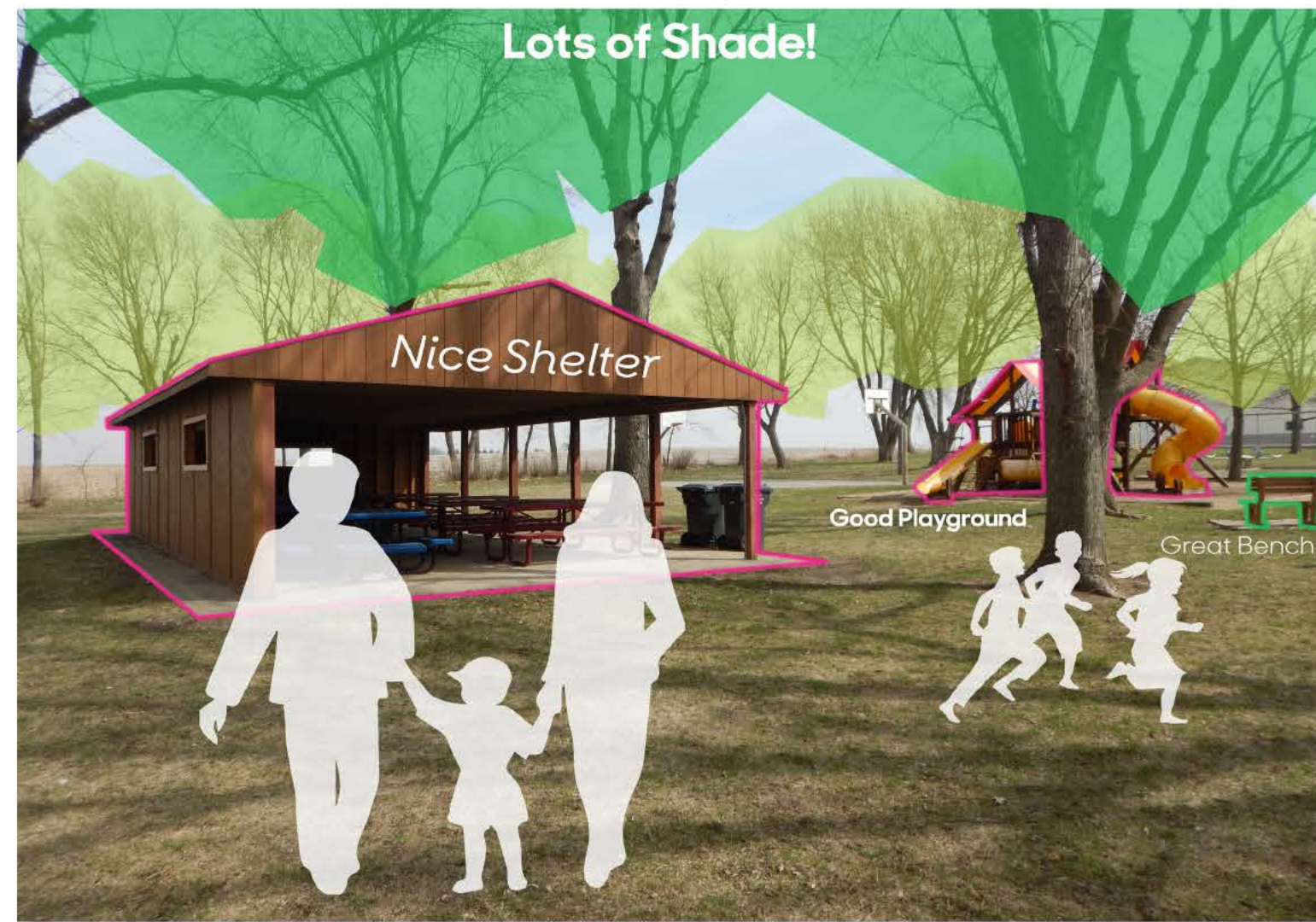
Asset: City Park