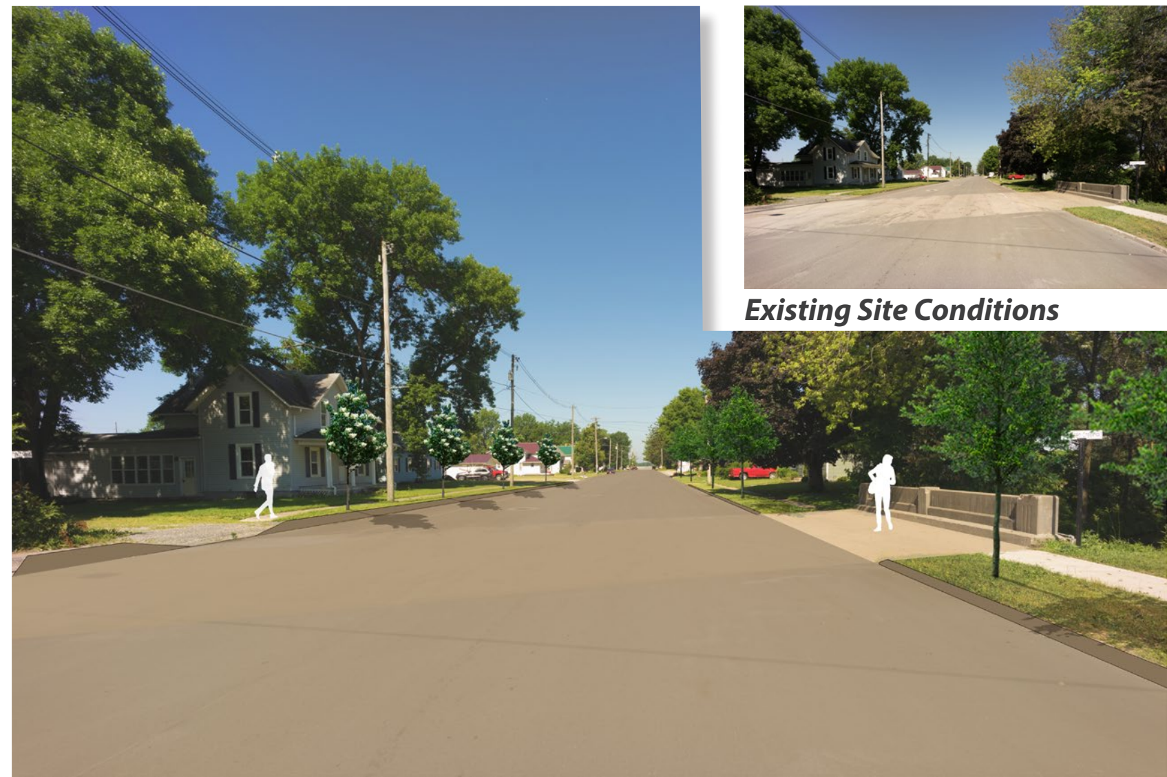
B Avenue Proposed Tree Plantings Looking West