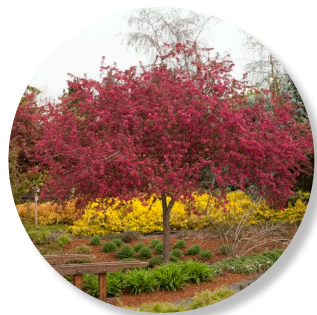
Malus x 'Centzan' Centurion Crabapple