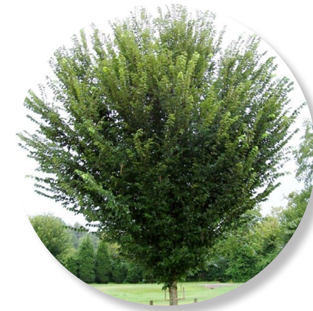
Ulmus americana 'Princeton' Princeton Elm