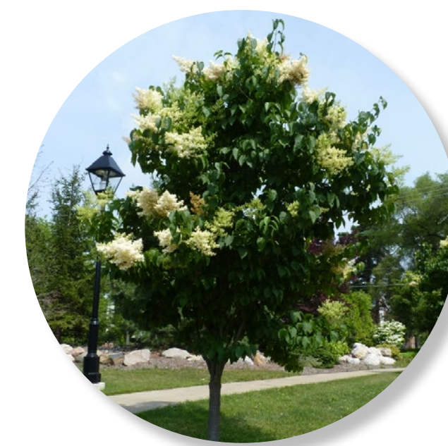
Syringa reticulata Japanese Tree Lilac