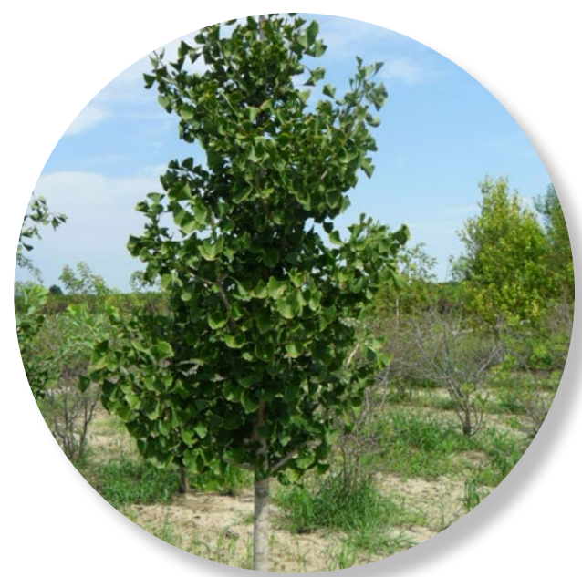
Ginkgo biloba Ginkgo Tree