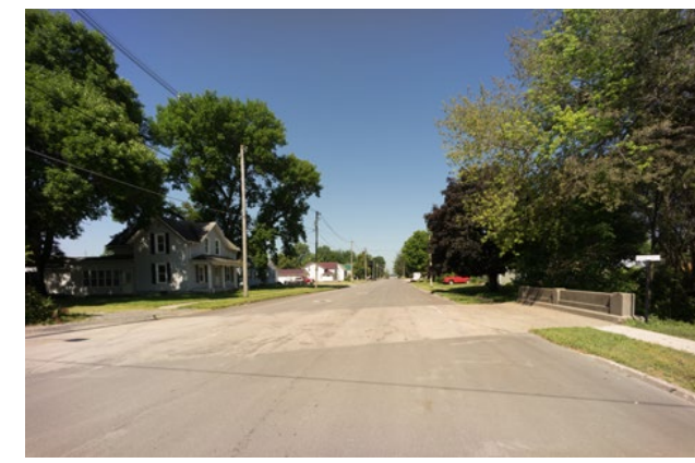
Existing Site Conditions