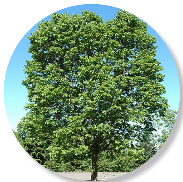
Celtis occidentalis 'Praire Pride' Prairie Pride Hackberry

The proposed plan incorporates these factors, while also creating a hierarchy between the sidewalk, parallel parking, and the road. The intersections will include sidewalk bump-outs to improve pedestrian safety through reduced crosswalk lengths and to provide increased green space. Bump-outs will help create a distinct entry and exit to Kalona's downtown while keeping the pedestrian pathway a priority. Overstory trees are proposed on the north side of B Avenue and understory trees (25' height or less) are proposed on the south side of the street due to overhead utility lines. Carrying the downtown identity throughout B Avenue with new streetscape amenities will help distinguish Kalona and amplify what the community has to offer.