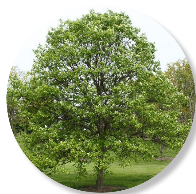
Quercus bicolor Swamp White Oak