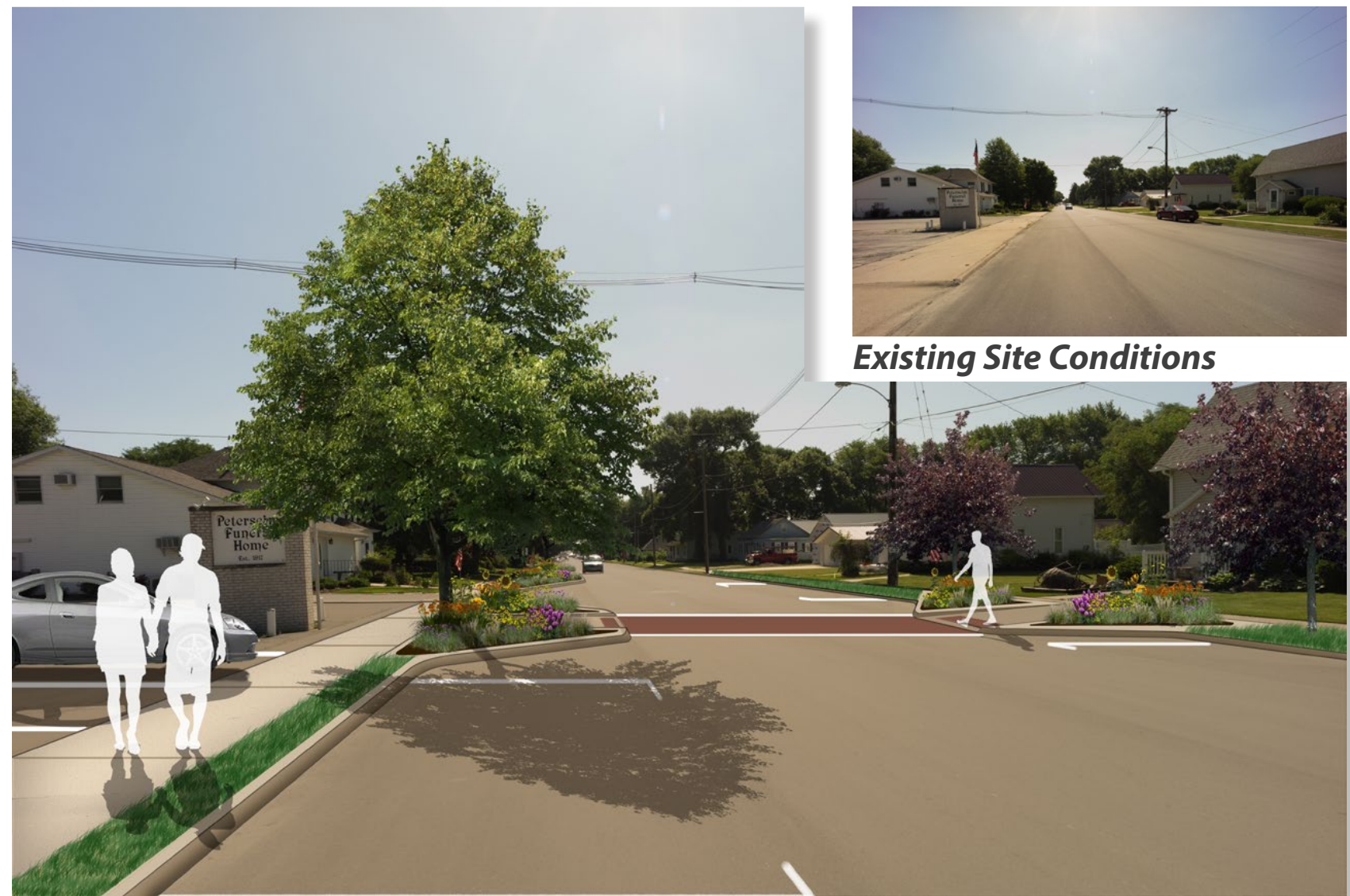
Pedestrian Crossing Near B Avenue and 2nd Street