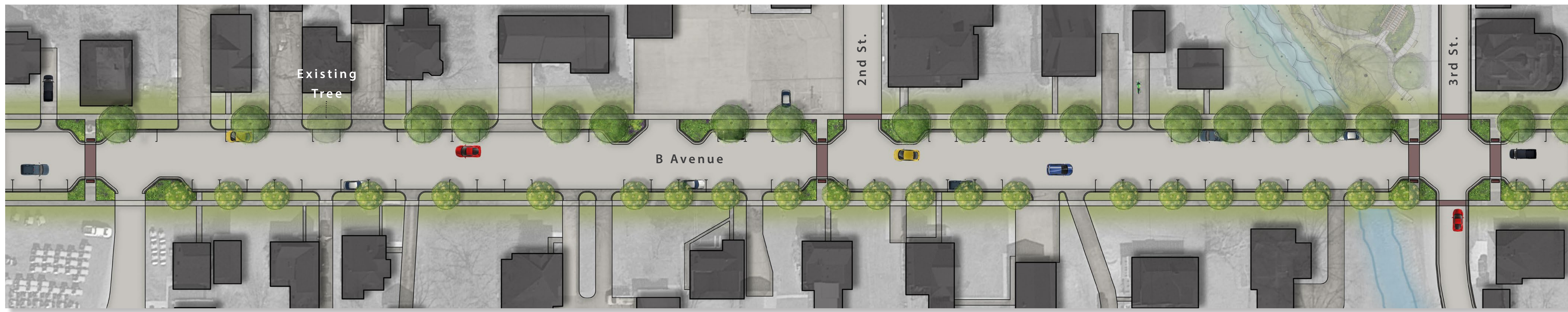
B Avenue Streetscape Plan - Proposed Bump-Outs and Vegetation