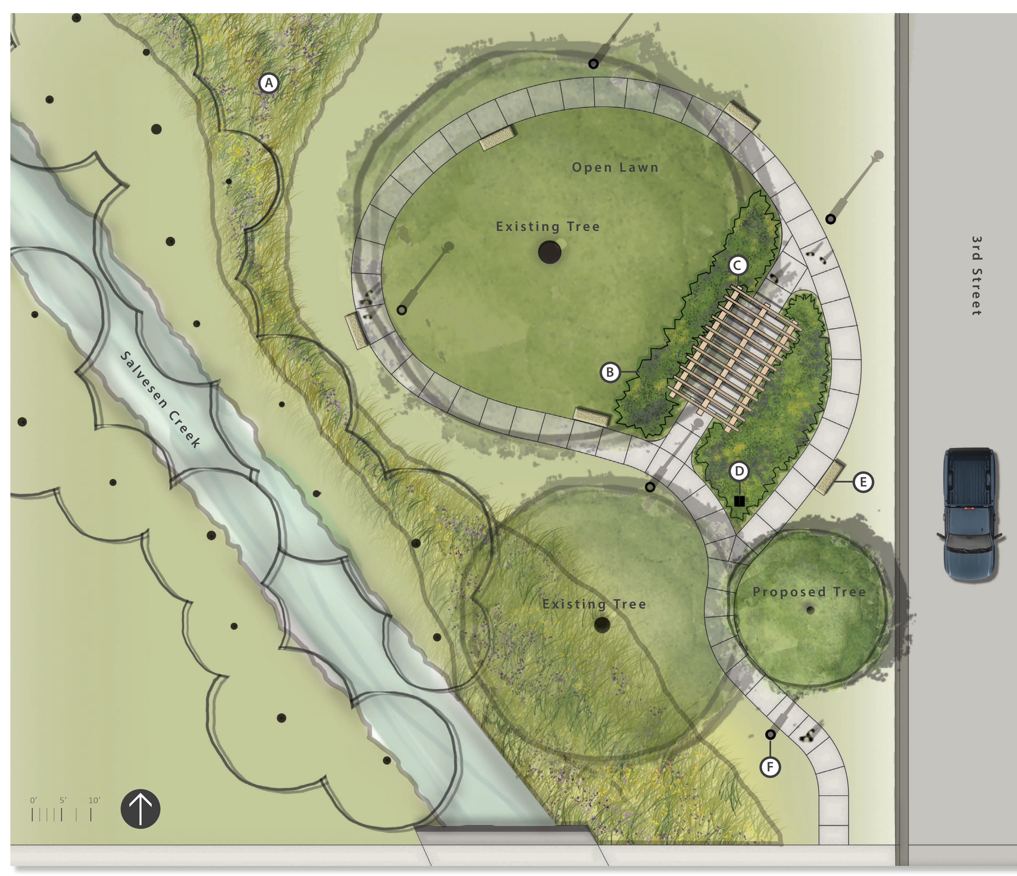
City Lot Near Salvesen Creek - Concept Plan