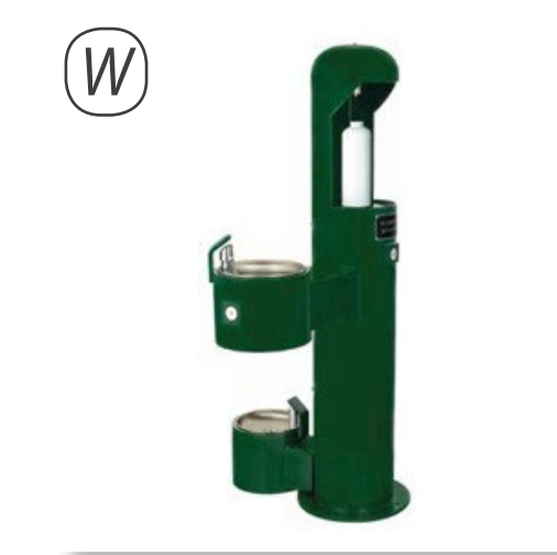
Water Station Stern Williams - 7700-90