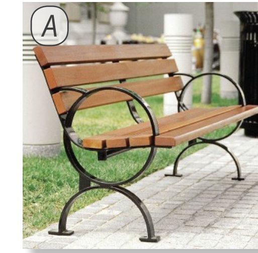
Bench Victor Stanley - FR-7