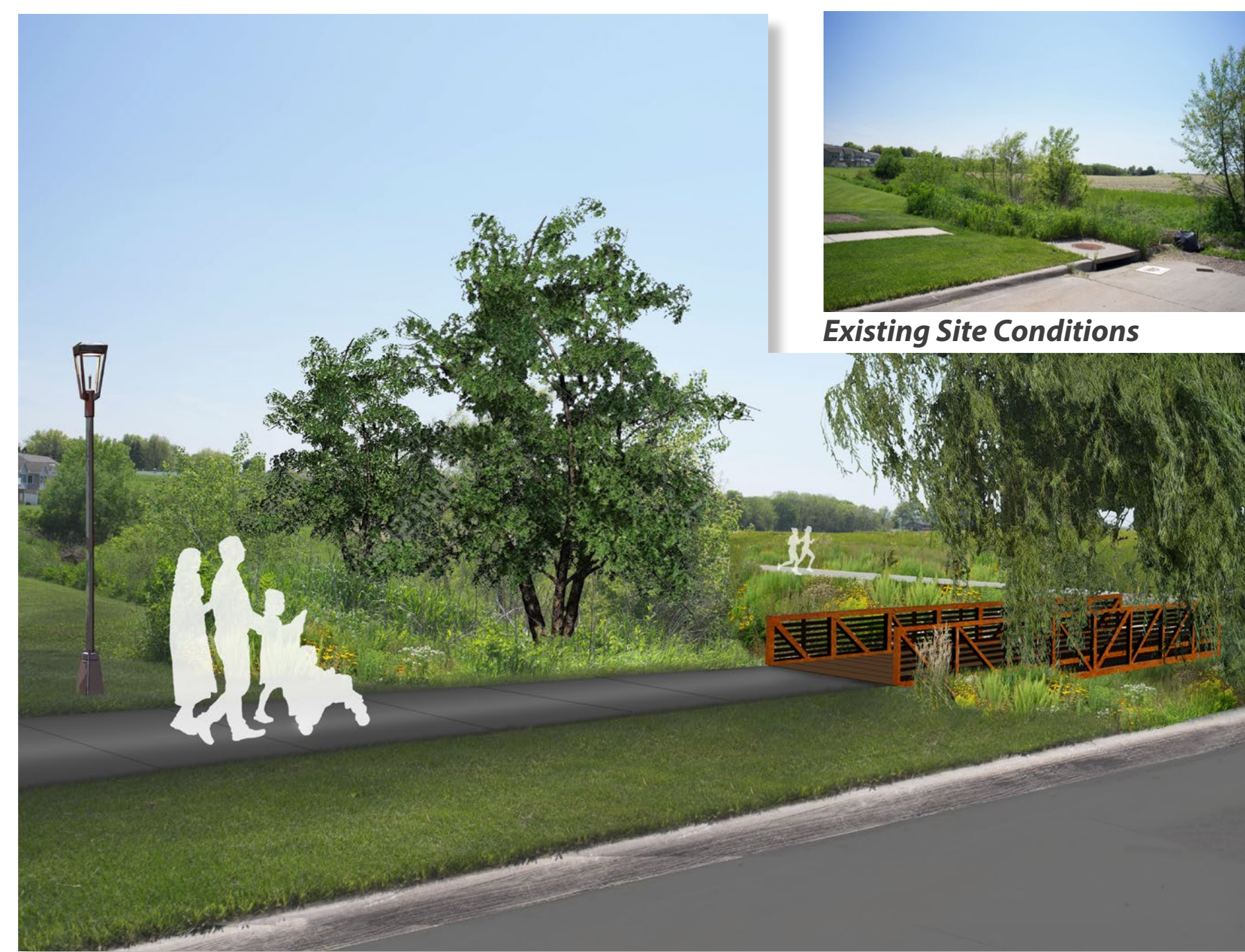
Bridge Crossing Salvesen Creek on West Side of J Avenue