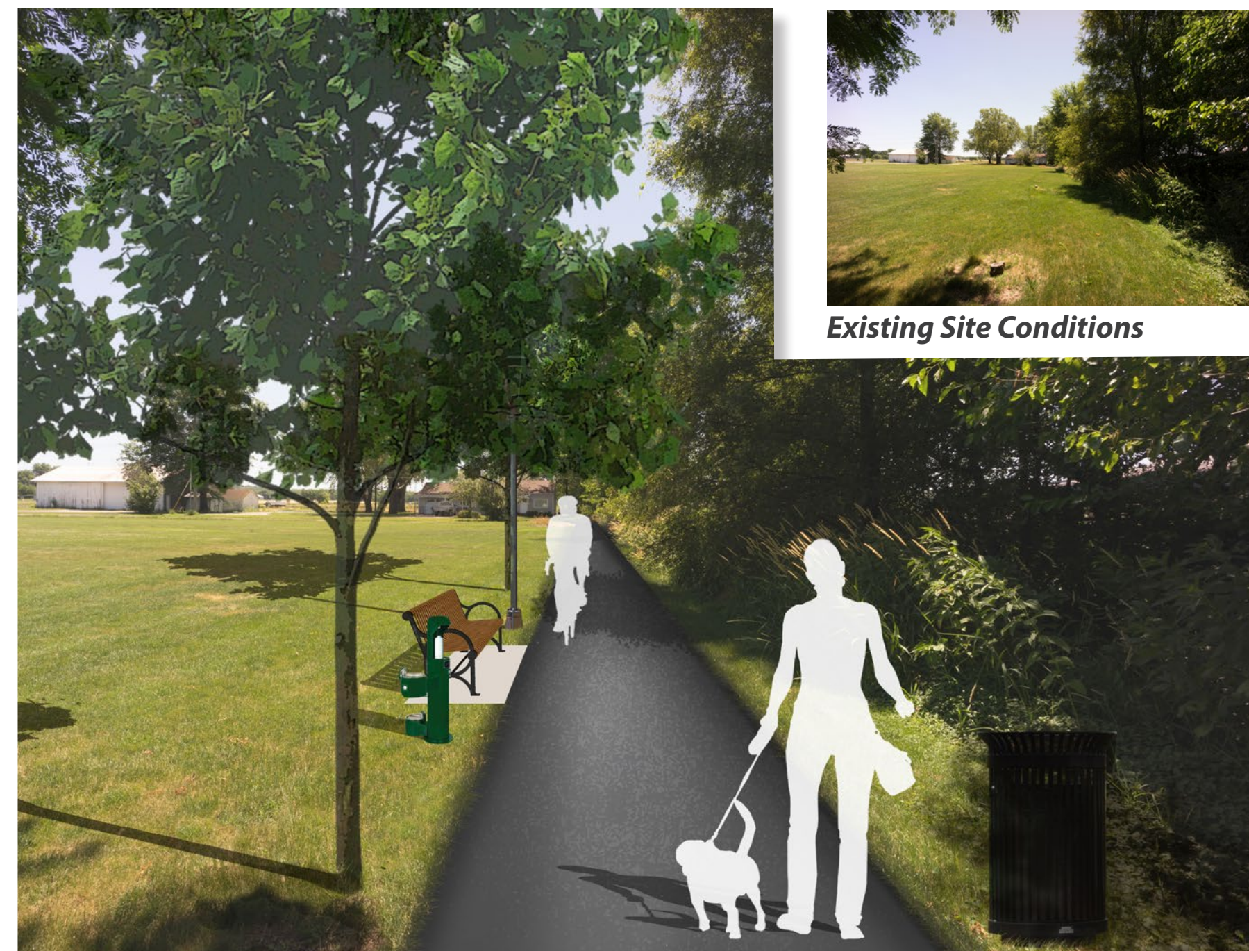
Trail on Southwest Side of City Park Along Creek