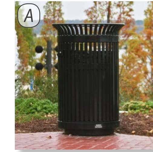
Litter Receptacle Victor Stanley - SD-42