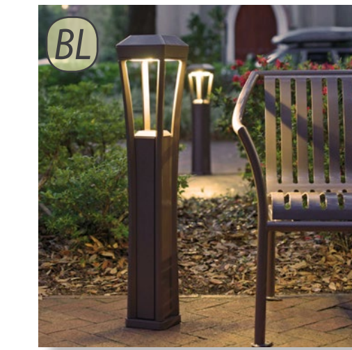
Bollard Light - 3' Ht. or Less Landscape Forms - Ashbery