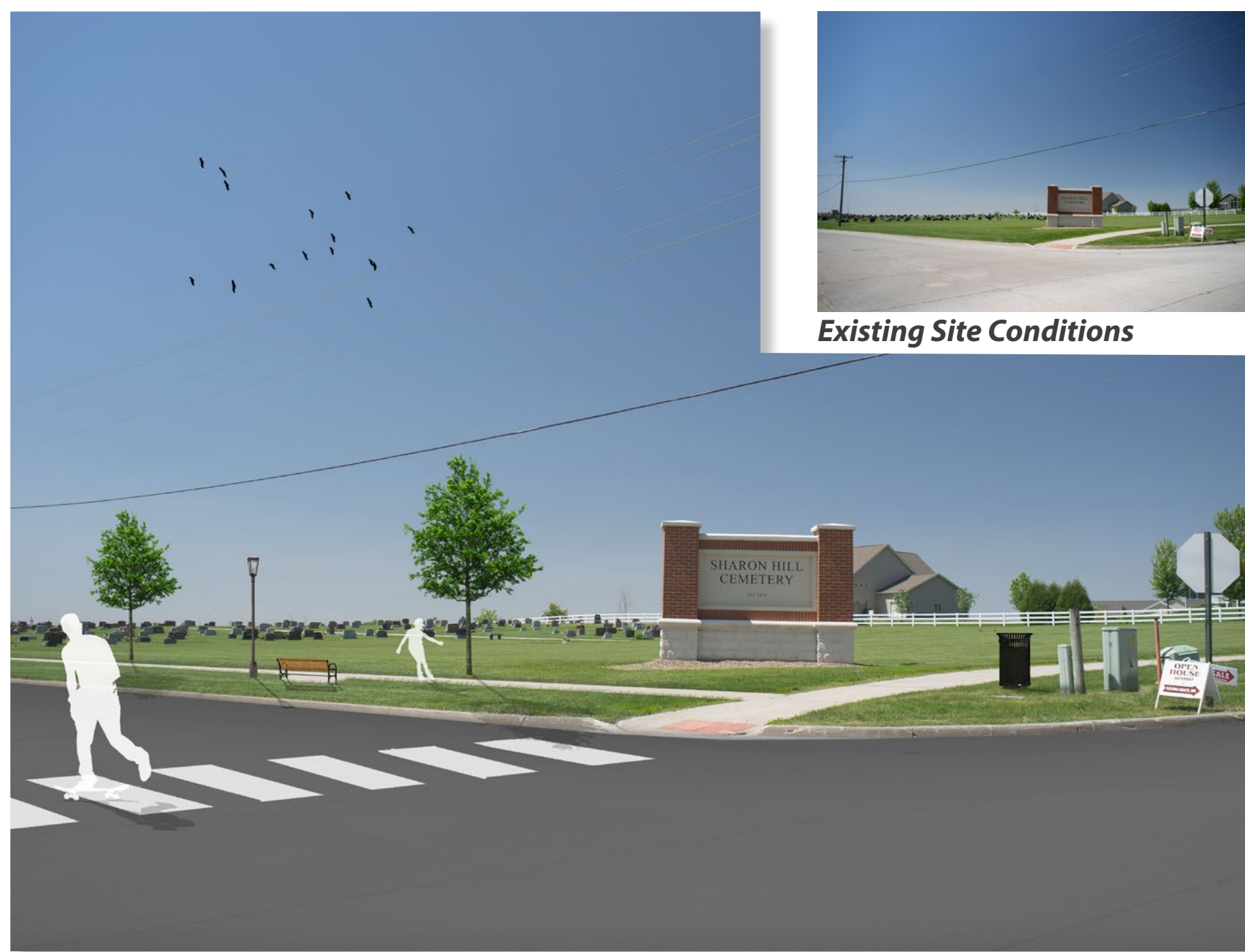
Trail Crossing J Avenue Near Cemetery