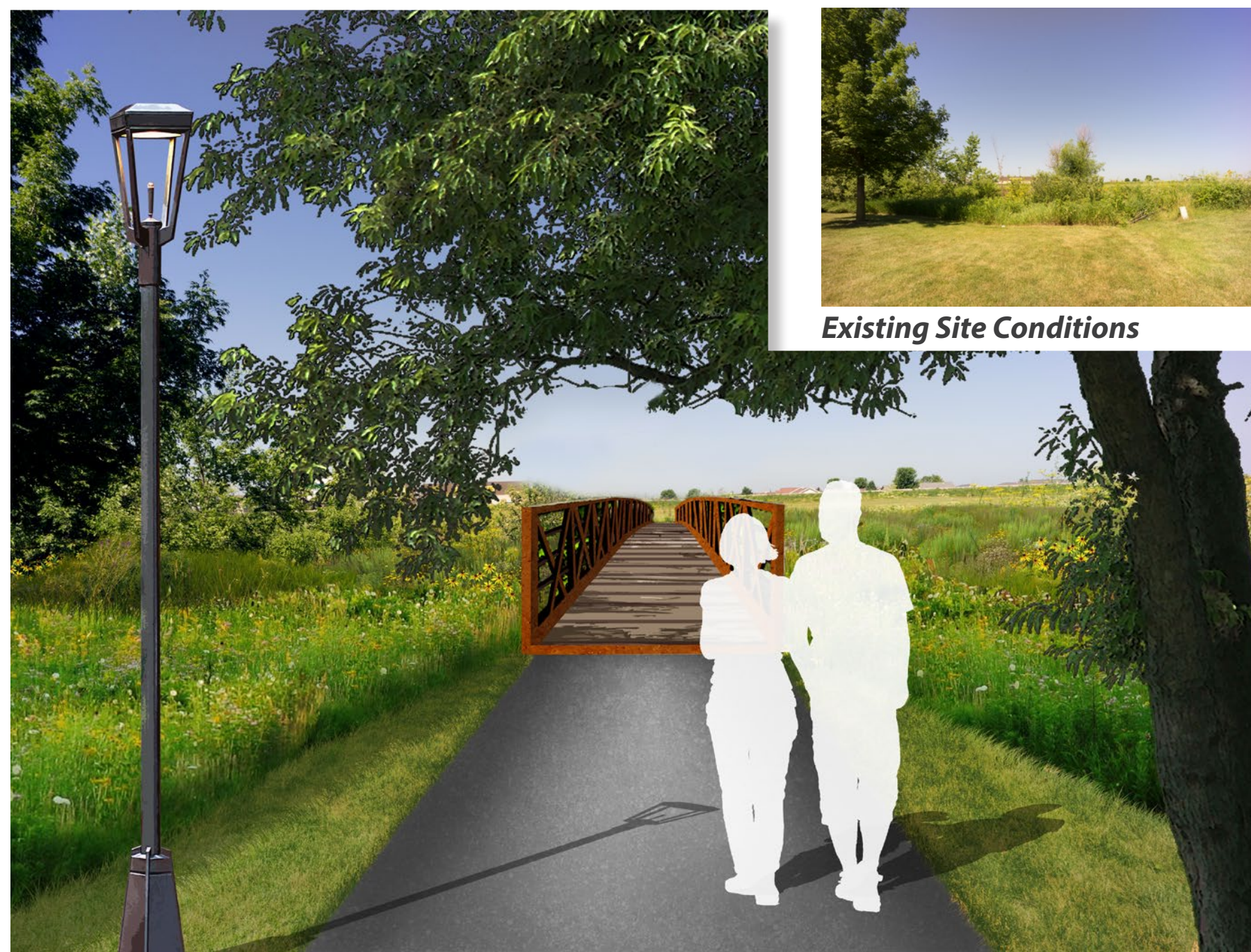
Bridge Crossing from Pleasantview Home to Highway 1