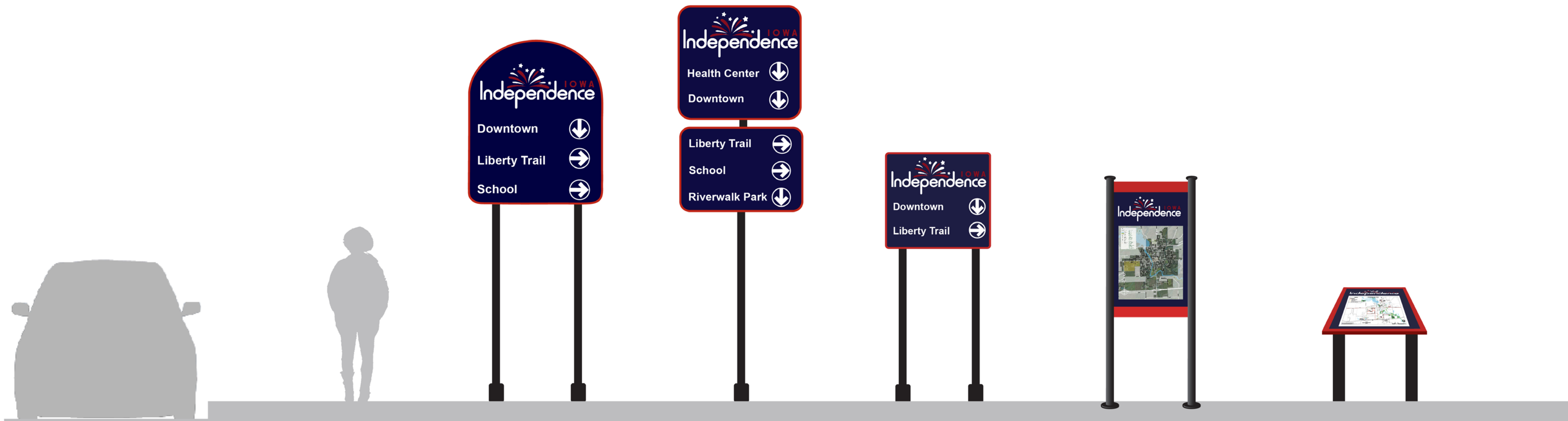
Proposed way-finding signage for pedestrian and vehicular use