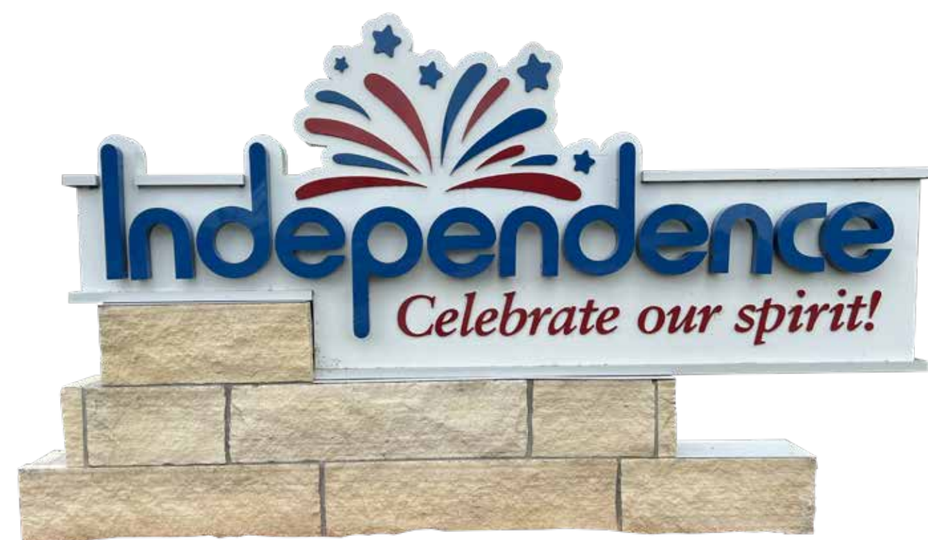
Existing entrance sign