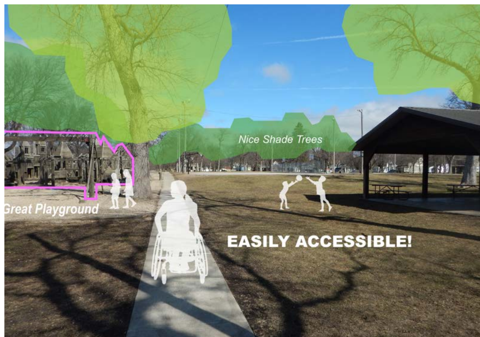
Asset: Taft Park