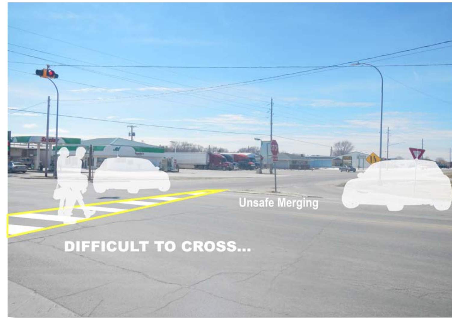
Barrier: Intersection at Highways 3 and 169