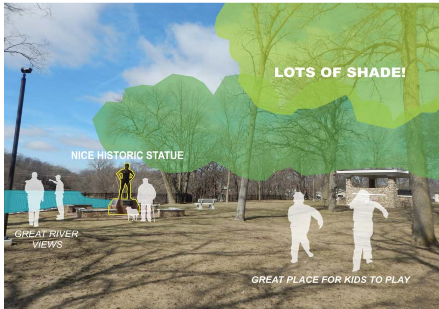
Asset: Bicknell Park