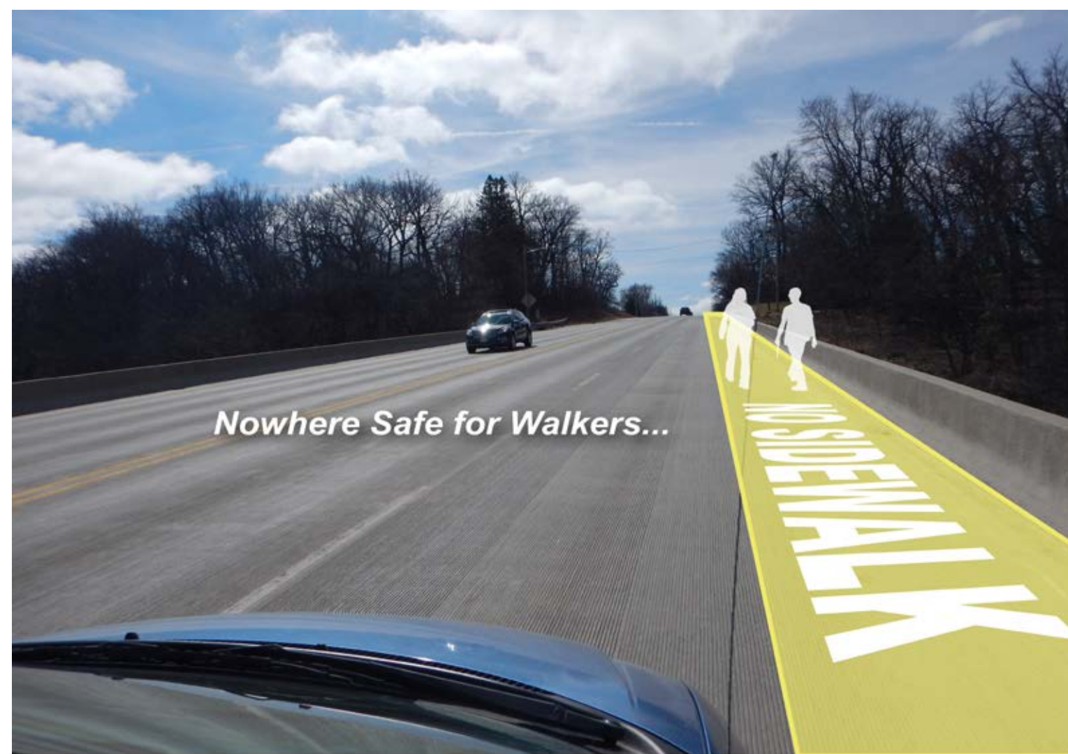
Barriers: Highway 169 Bridge