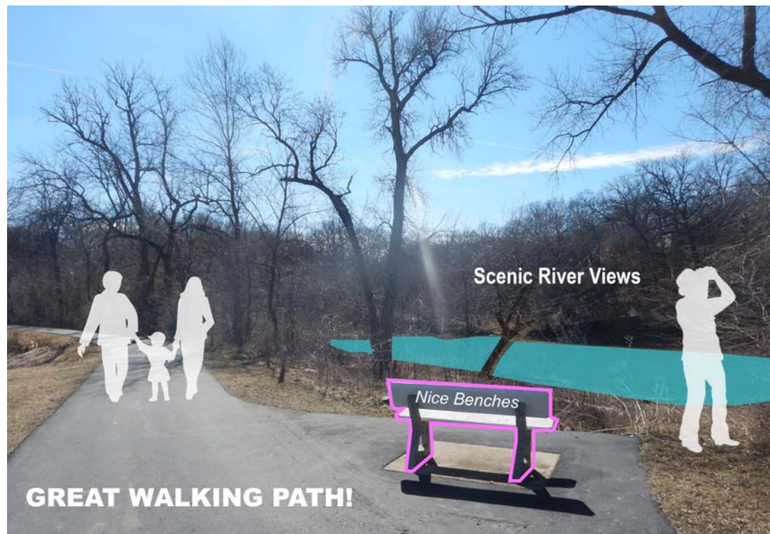
Asset: Cottonwood Trail