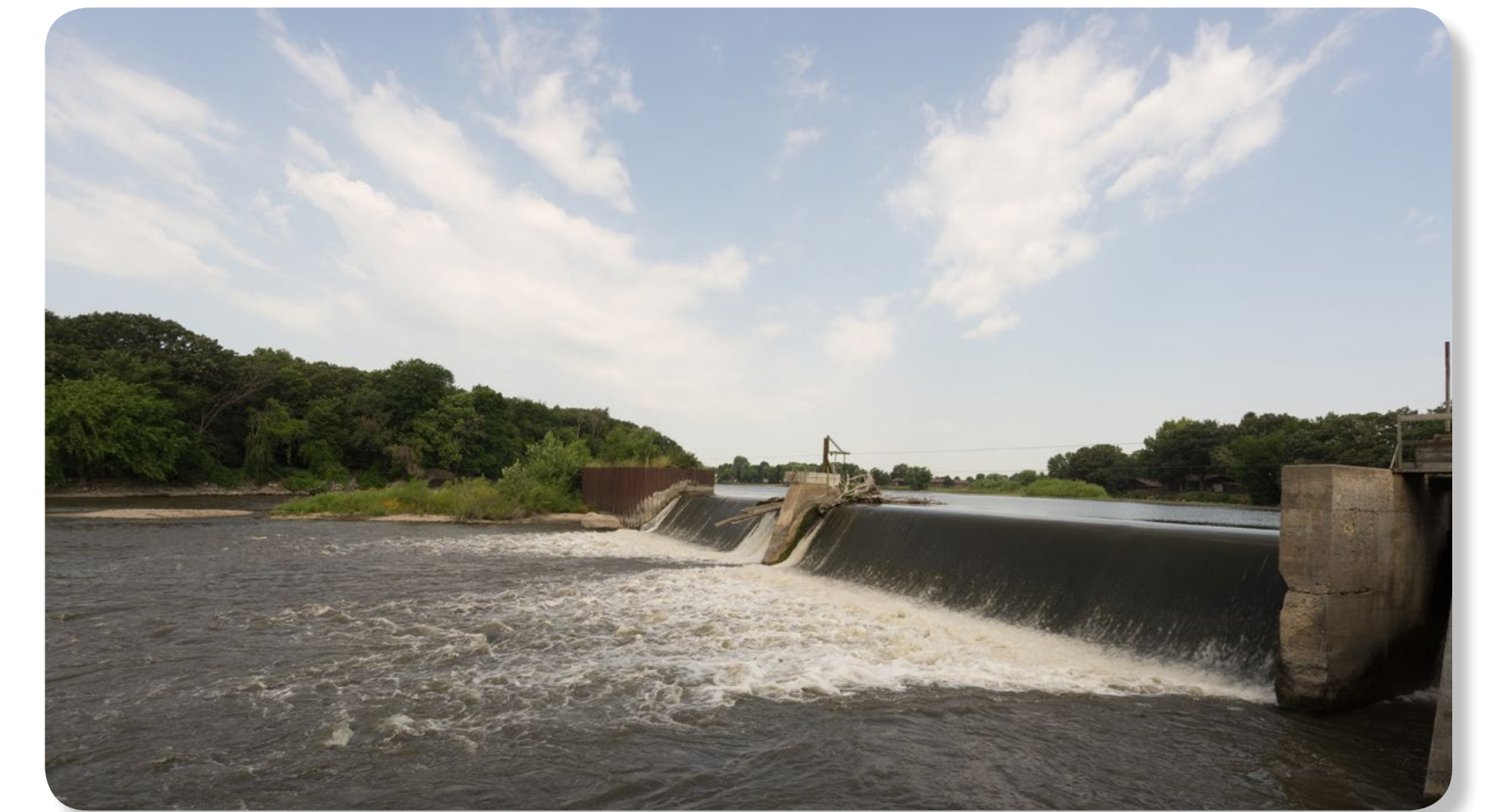
Dam Along the Des Moines River