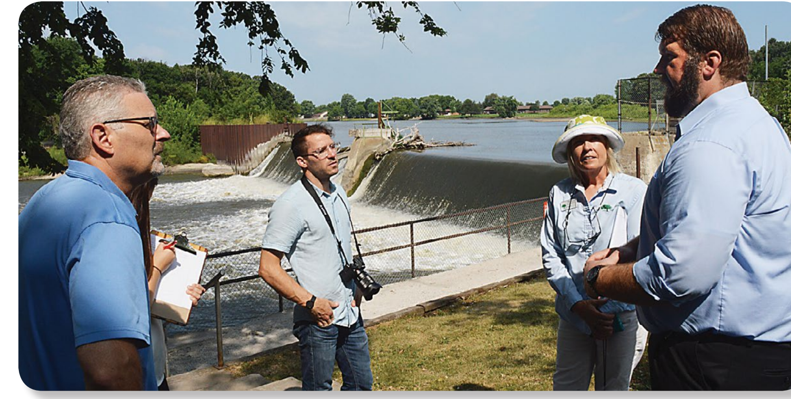
Community Design Workshop