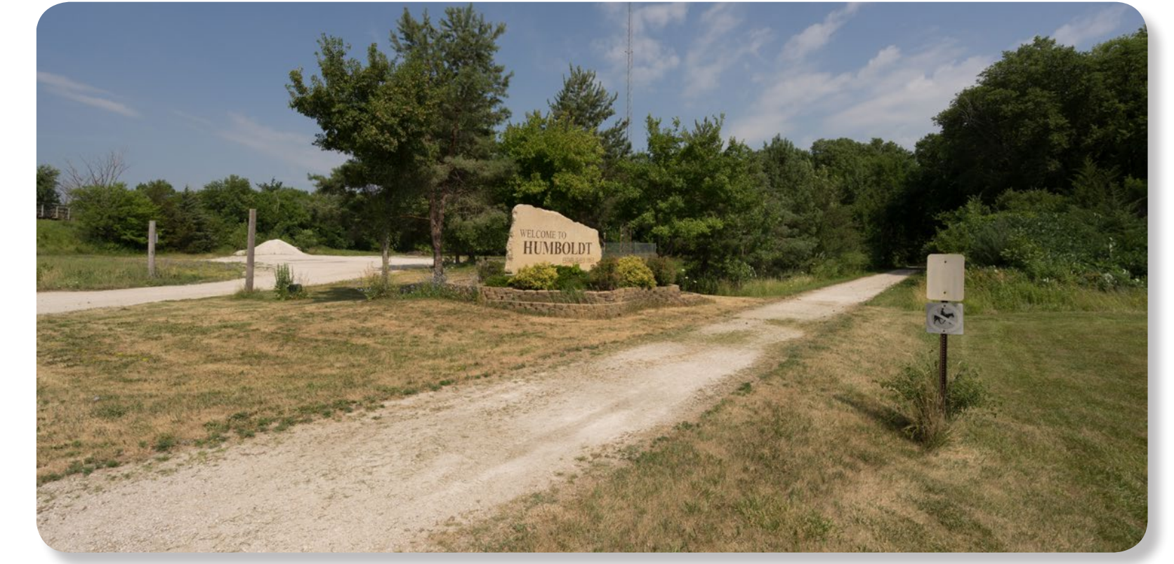
Three Rivers Trail Entry