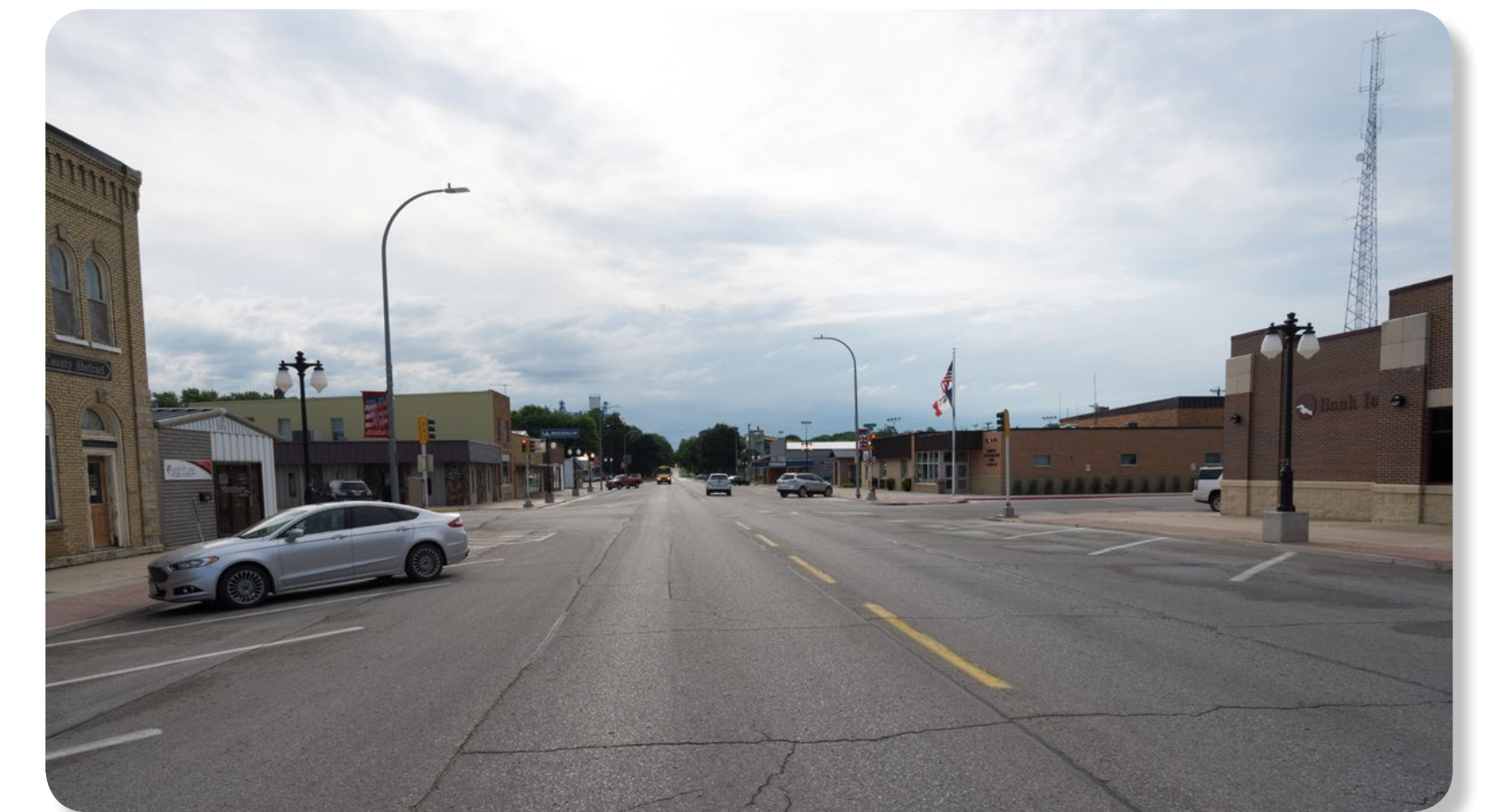
Sumner Avenue Viewing East