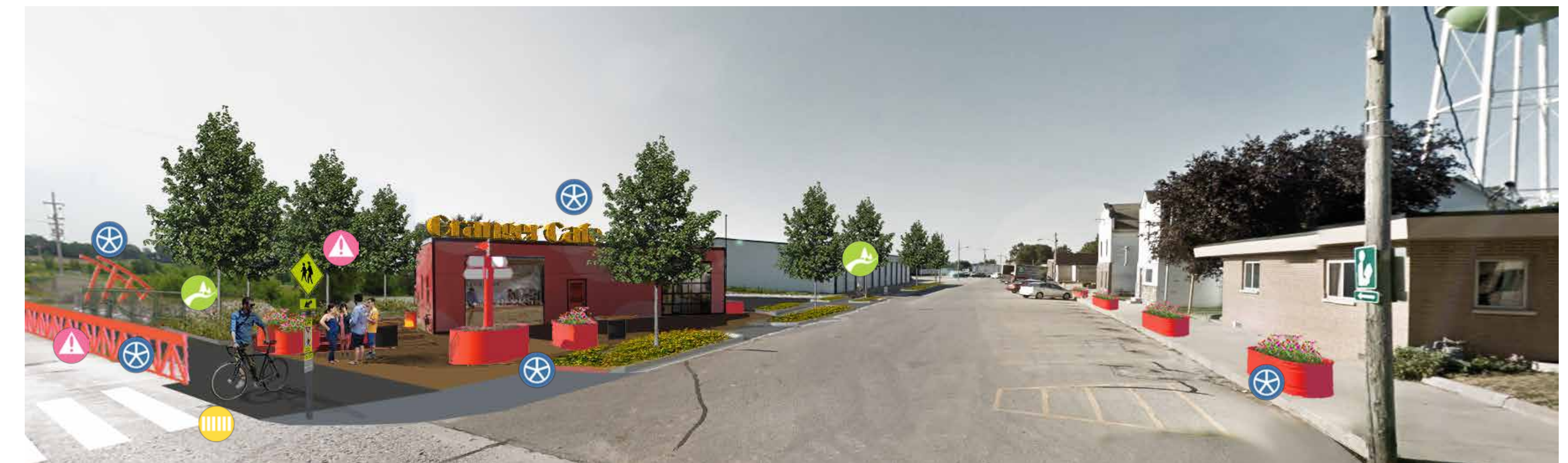
Downtown Streetscape Perspective

To enhance the street crossing over Oxley Creek as a downtown focal point, two gateway monuments are proposed to flank State Street. These playful sculptural monuments suggest the arc of a spoked wheel over the roadway, referencing the train and circus wagon wheels of the city's past, and marking the community as a hub for regional cycling. The steel structures will be accessible from the existing sidewalk on the north and proposed multipurpose trail on the south of edge of State Street. They can also serve as rest areas along the trail system with integrated seating, gravel surfacing, bike racks, and signage. Large in scale and painted an eye-catching, signature red color, the downtown gateway monuments will be visible to both directions of travel along State Street and further up the hill on NW 110th Ave, and will become a landmark for commuters that draws visitors into downtown Granger. Decorative guardrails to match the monuments are included to separate street and trail/sidewalk traffic through this corridor.