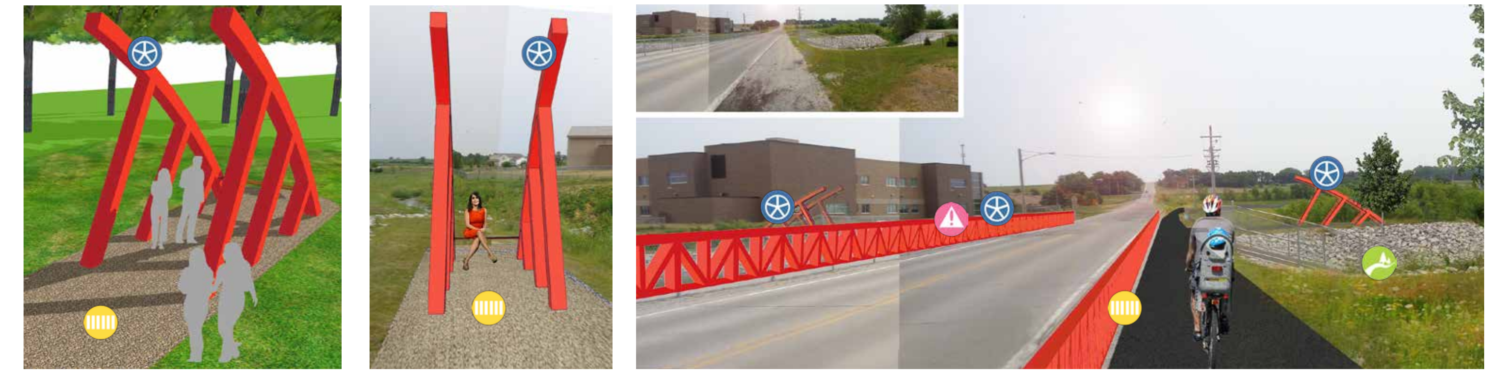
Monument Perspective Monument Perspective Downtown Gateway Trail Perspective

The Granger Community Visioning committee has identified a range of projects that can improve aesthetics, connectivity and access, and enhance community identity downtown. New street trees and prairie plantings are proposed for both beautification and traffic calming along Highway 17 and State Street to the creek, where two large "wheel" monuments become an iconic focal point. The proposed multipurpose local trail is routed along Oxley Creek, crosses the creek within the existing right-of-way of the road bridge, and includes a marked crossing at State Street with pedestrian sign and push button-activated RRFBs. This intersection becomes the primary trail node at the heart of Granger, providing access to downtown businesses and cultural amenities for both residents and regional trail users. Taking this idea further, the existing building and parking area at this corner (currently privately-owned) are re-envisioned as a regional trailhead and welcome center for visitors. This facility could include a cafe or brew pub with indoor and outdoor seating, Granger historical exhibits or other tourist information, and multidirectional wayfinding signage to direct visitors to local and regional destinations. Rain gardens buffer this development along the creek, creating a welcoming oasis and rendezvous point for locals and visitors alike.