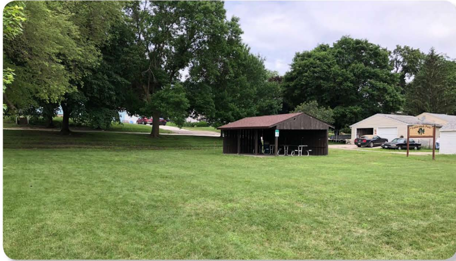
Fahnestock Park Enhancement Opportunity