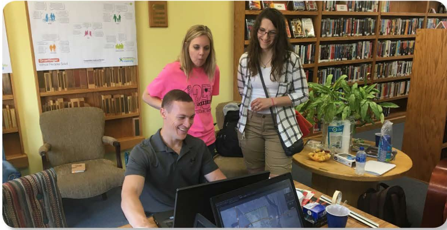
Design Workshop Meeting