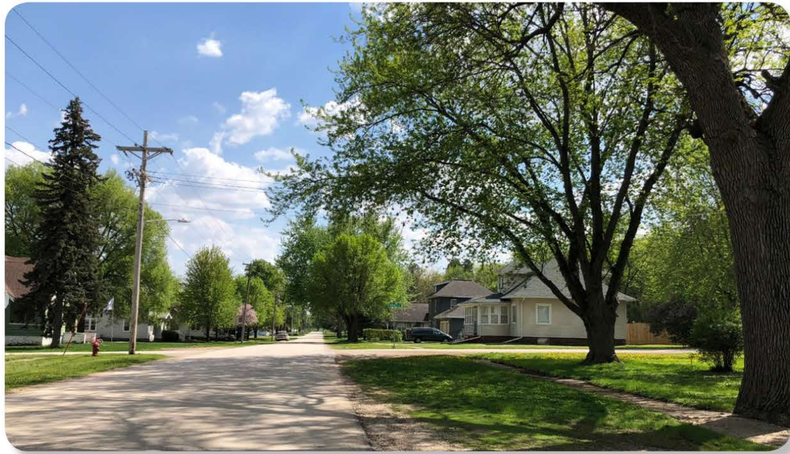
Cedar Avenue Trail/Sidewalk Development Opportunity