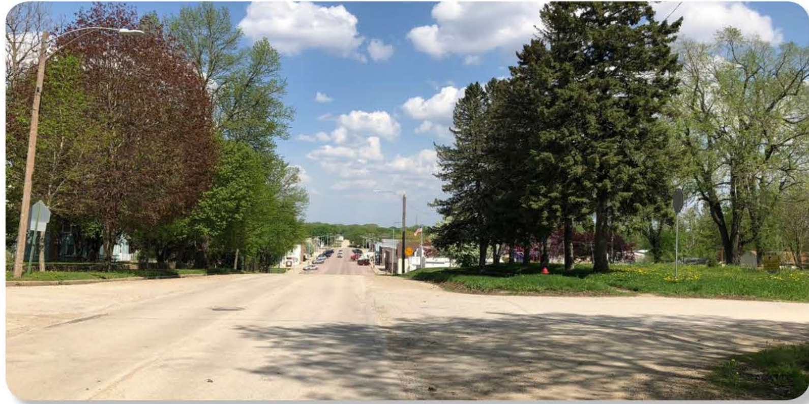
Robins Street Corridor

The city of Graettinger is one of 10 communities selected to participate in the 2018 Iowa’s Living Roadways Community Visioning Program. The program, which selects communities through a competitive application process, provides professional planning and design assistance along transportation corridors to small Iowa communities (populations of fewer than 10,000).