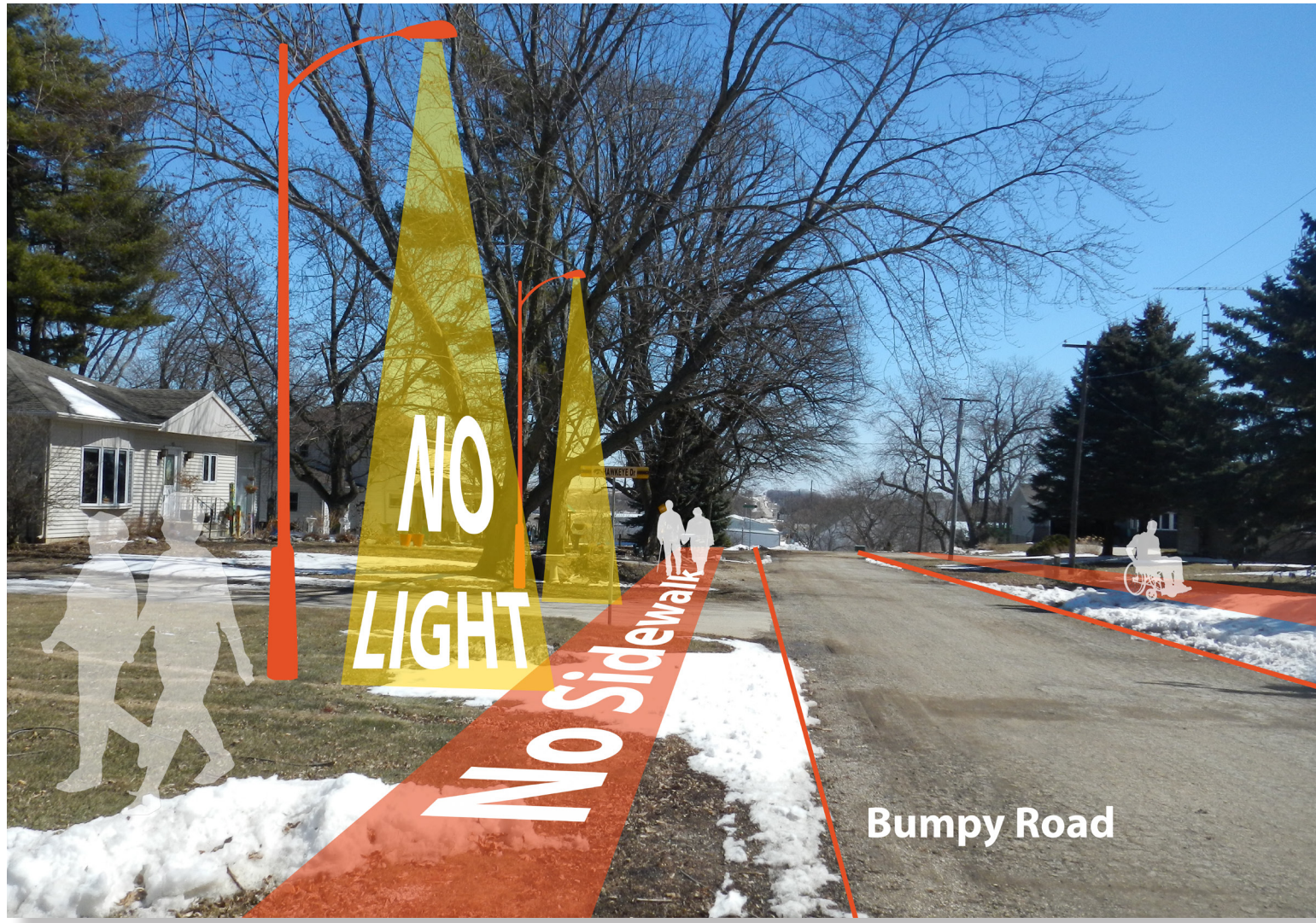
Many residential areas lack lighting and sidewalks, making walking difficult.