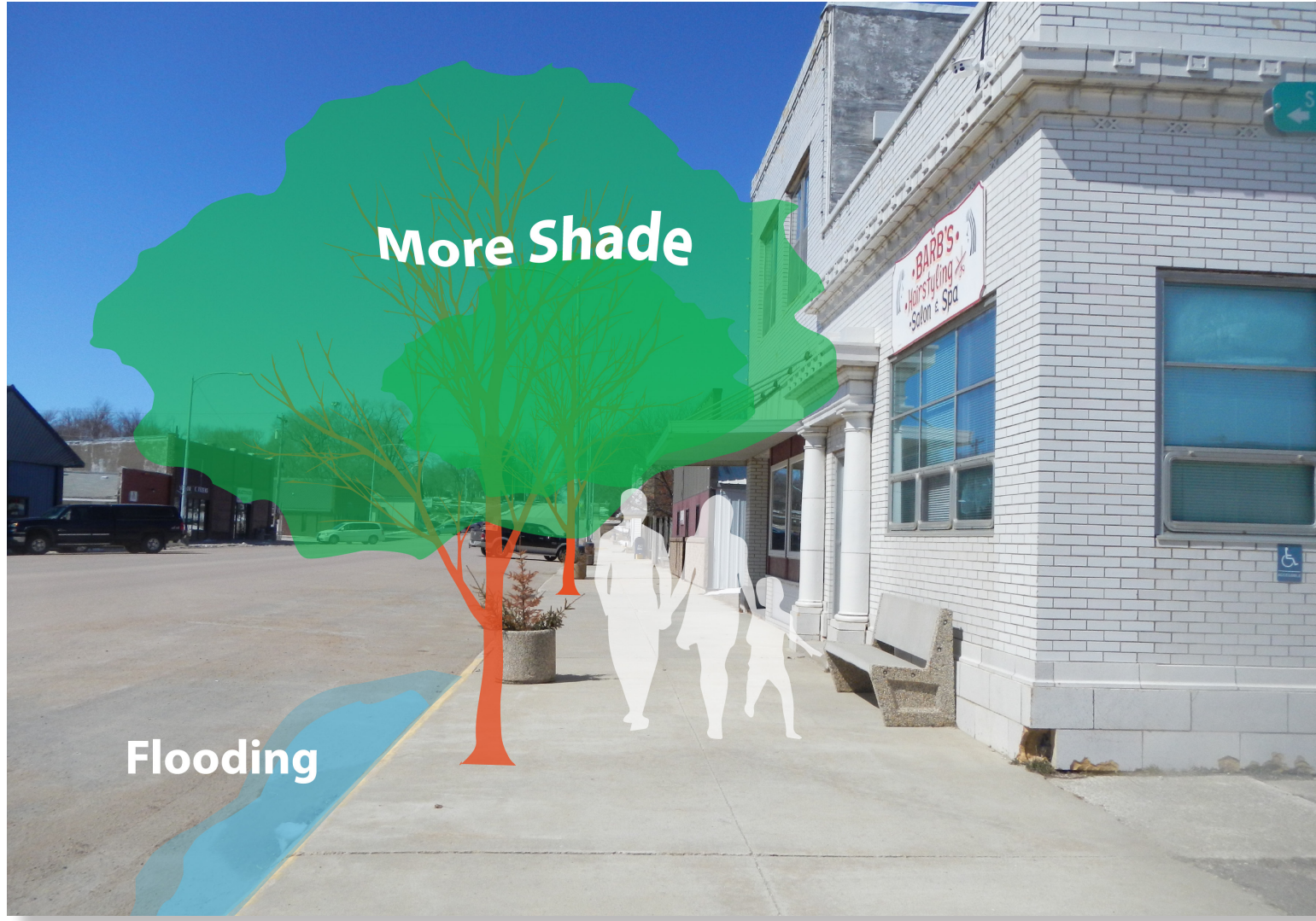
Main Street is wide, lacks shade, and floods. People don't like to walk there.