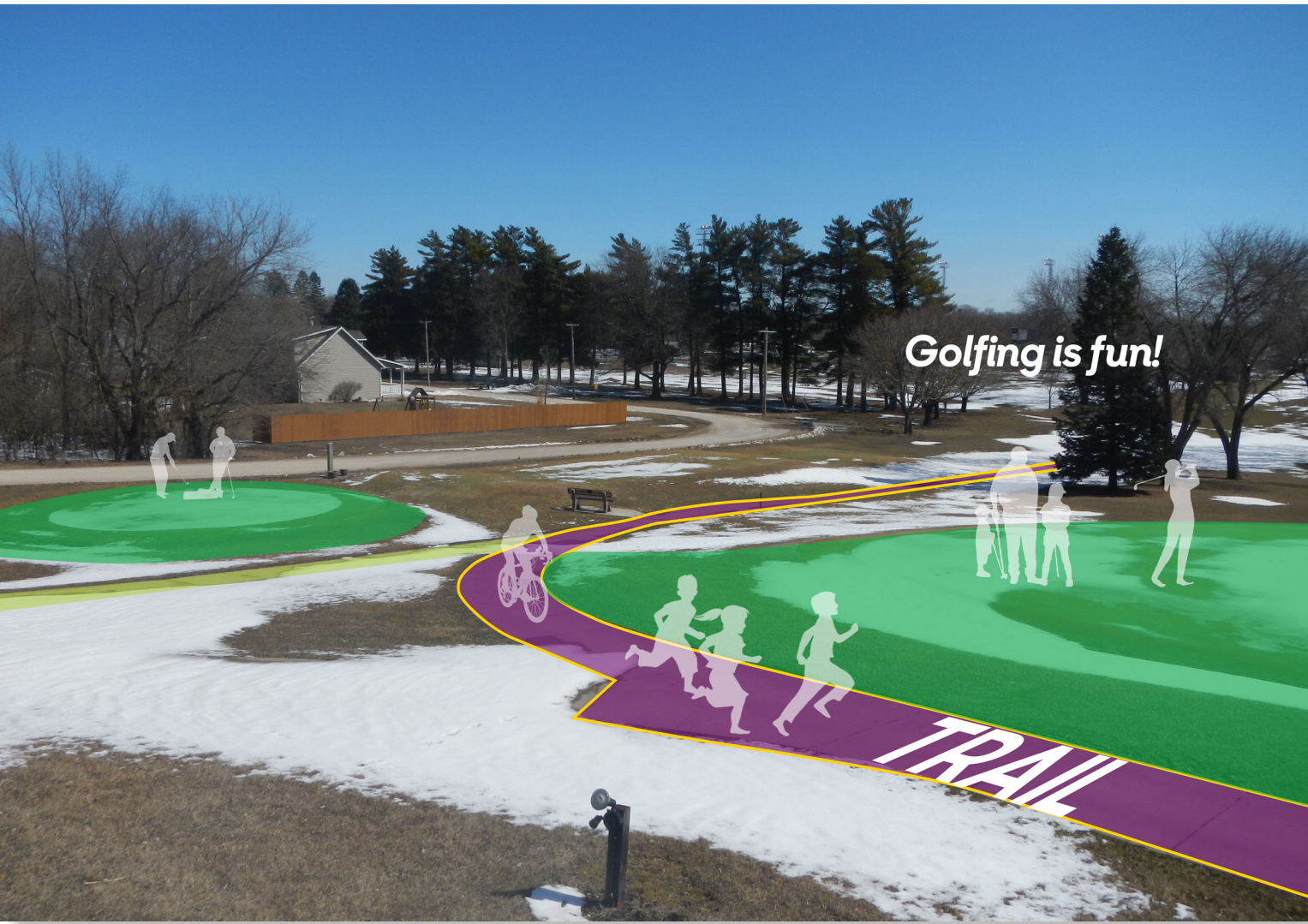
The golf course has a trail system.