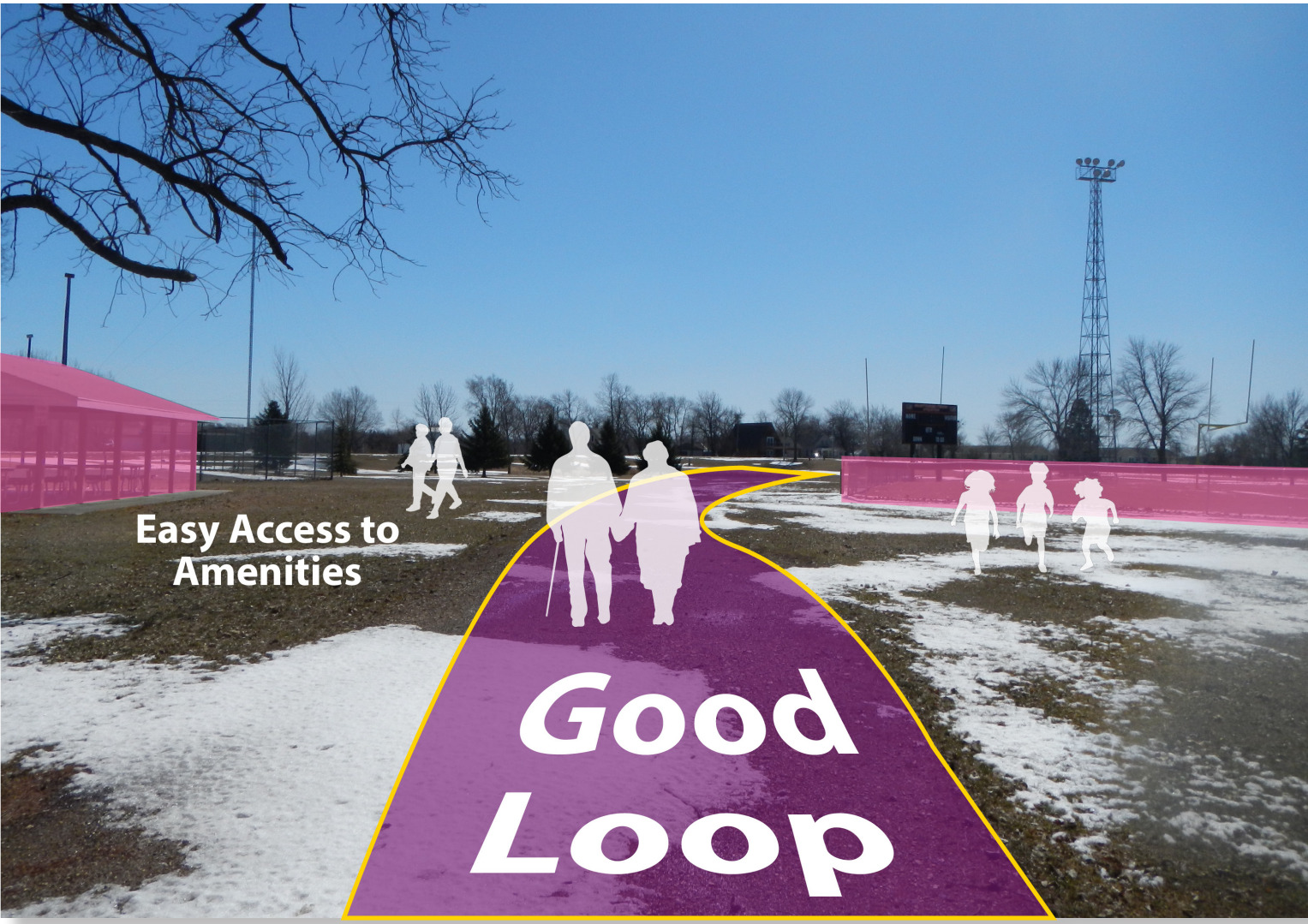
The loop in Evergreen Park provides good access to a variety of amenities.