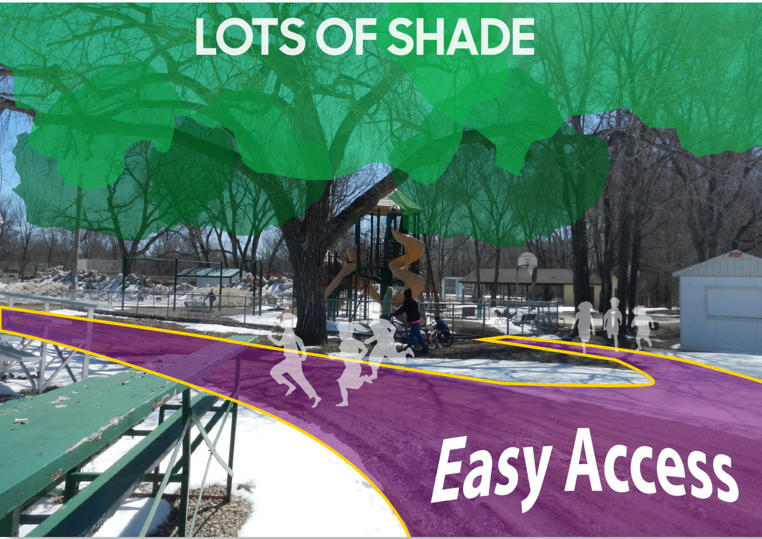
Citizens Park offers easy access and lots of shade.