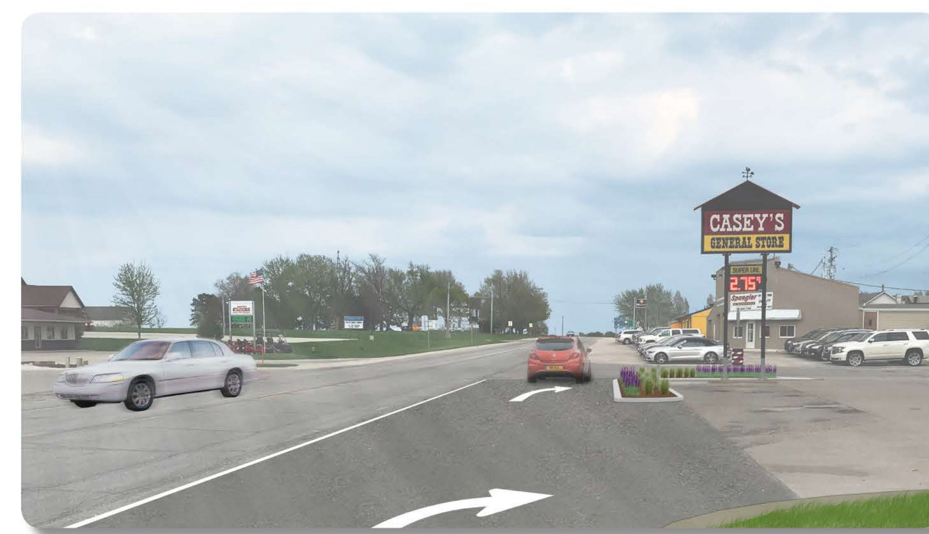
Proposed Right-Turn Lane

Concern with decreased sight lines resulting from vehicles illegally parked along Highway 30 was also a topic of discussion during community workshops. With no remarkable visual cues for non-resident motorists, parked cars also limit the visibility of the Idaho Street intersection. Constructing a turn lane will provide better visibility for motorists both pulling onto and off Highway 30. The addition of a small median separating the turn lane from Casey's will soften the pavement at this highly paved section of the Highway 30 corridor.