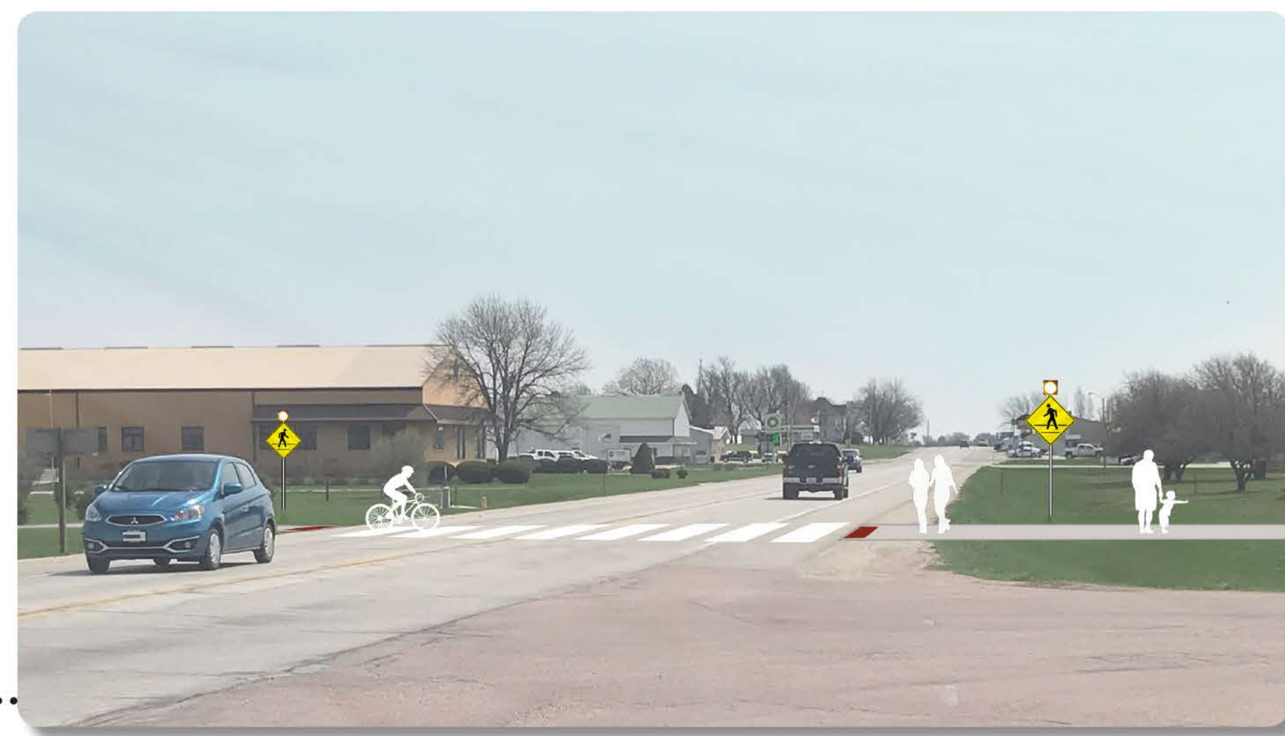
Proposed Pedestrian Crosswalk