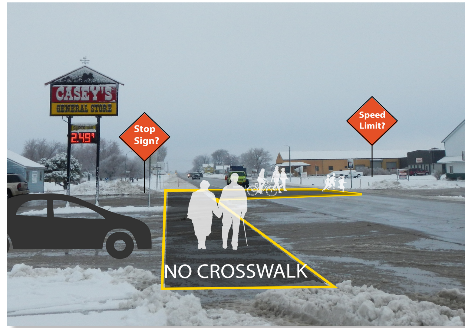
Barrier: Busy traffic at Highway 30 and Idaho Street.