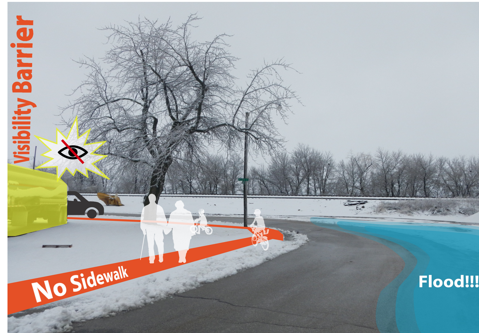
Barrier: The corner of Arizona Street is on the floodplain. The corner is very sharp and parked trucks can block the view. Also, the sidewalk is not continuous.