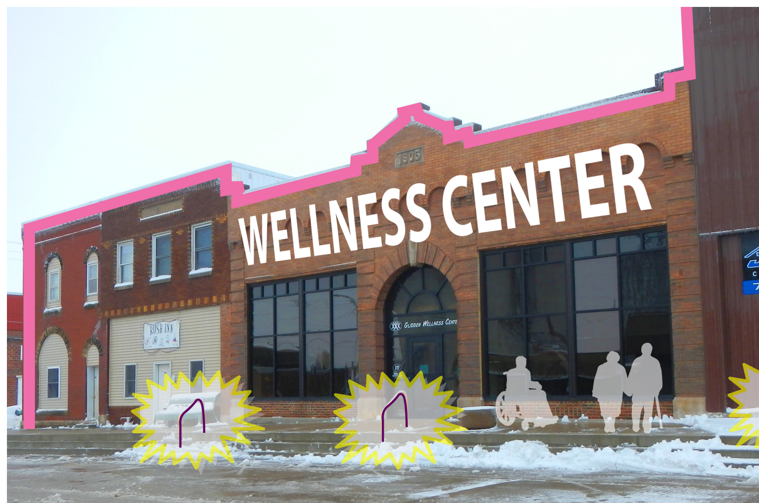
Asset: Main Street buildings are well maintained. The handrails are very helpful.