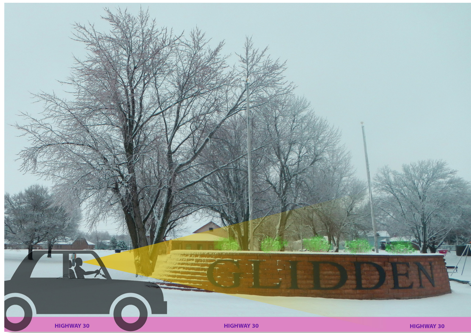
Asset: Glidden sign captures visitors' eyes on the Highway 30.