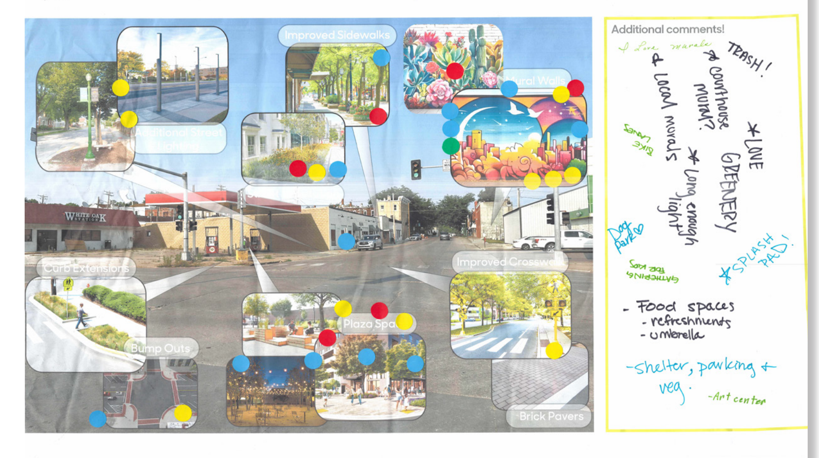
Community Input from the Design Workshop