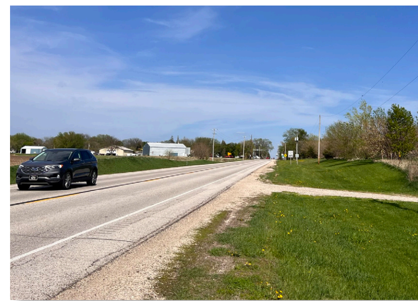
A) Existing Trail Route A was the preferred route based on community feedback from the design workshop and community input sessions. The trail route includes a trail along HWY 3, and highlights the scenic beauty along the cemetery, and the existing county park connecting north around the quarry to the Three Rivers Trail.