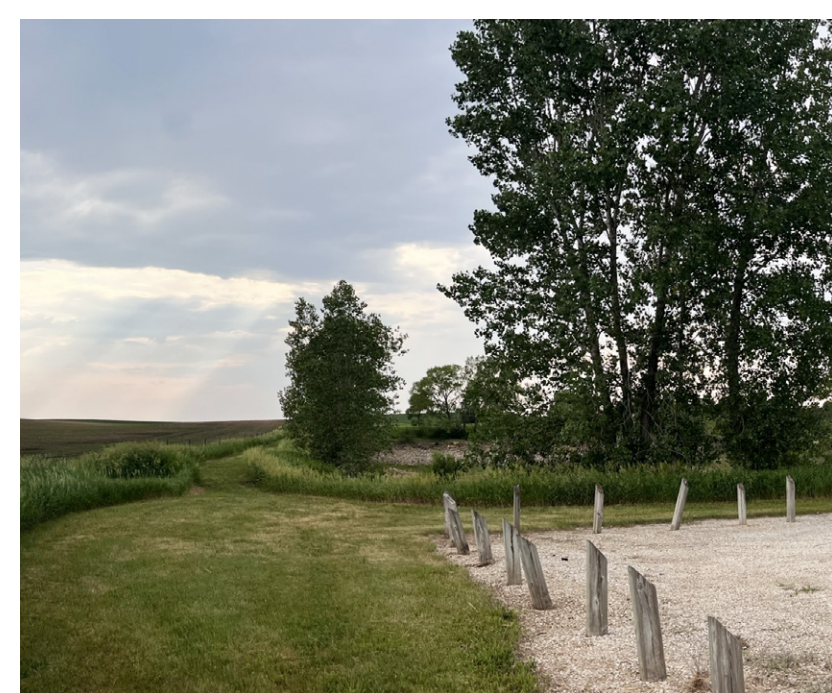
B) Existing Trailhead amenities including shade, bike tune-up stations, and improved trail conditions to enhance the user experience were suggested at the design workshop. One location for a new trailhead is outside city limits at the county park.