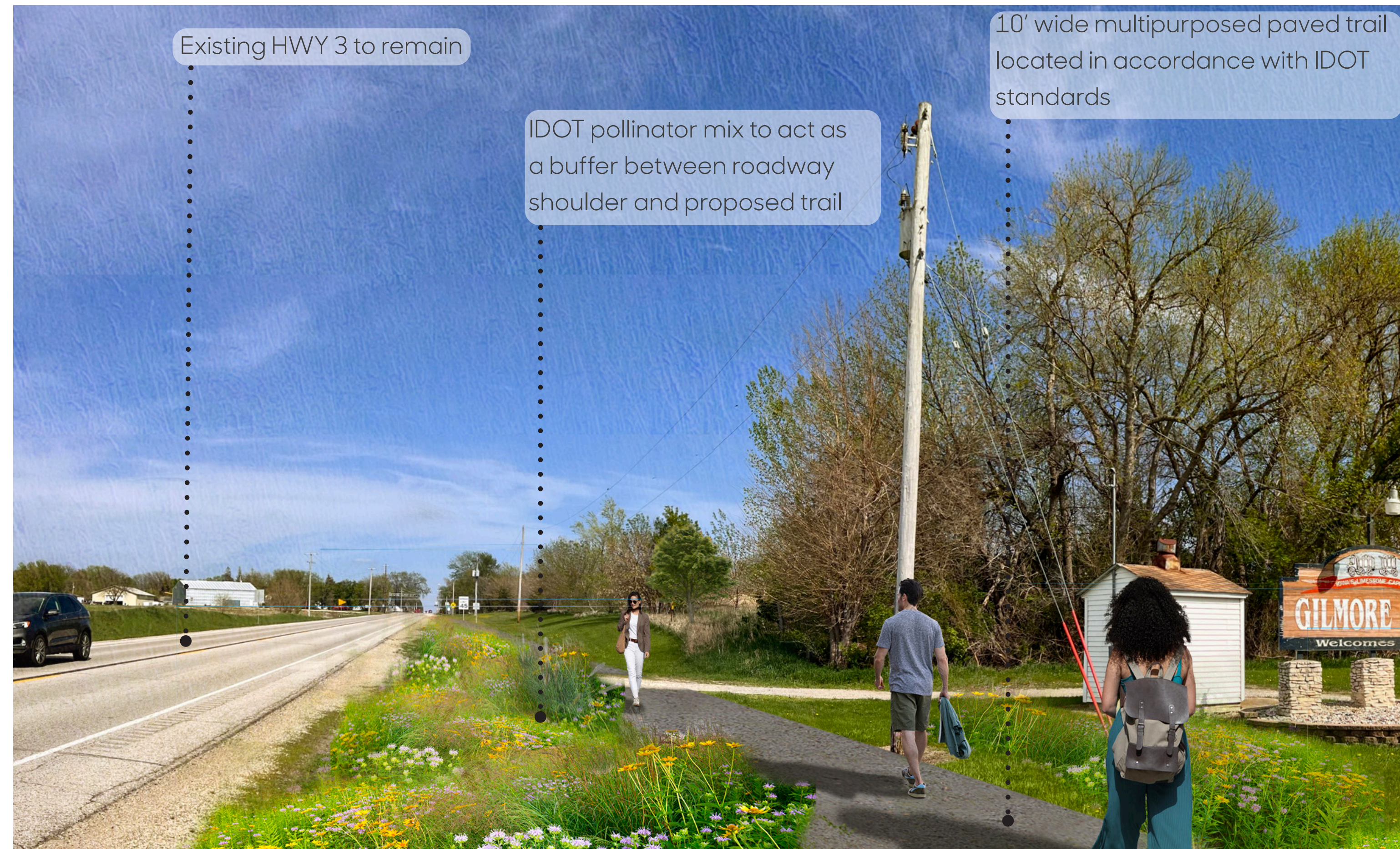
A) HWY 3 Proposed