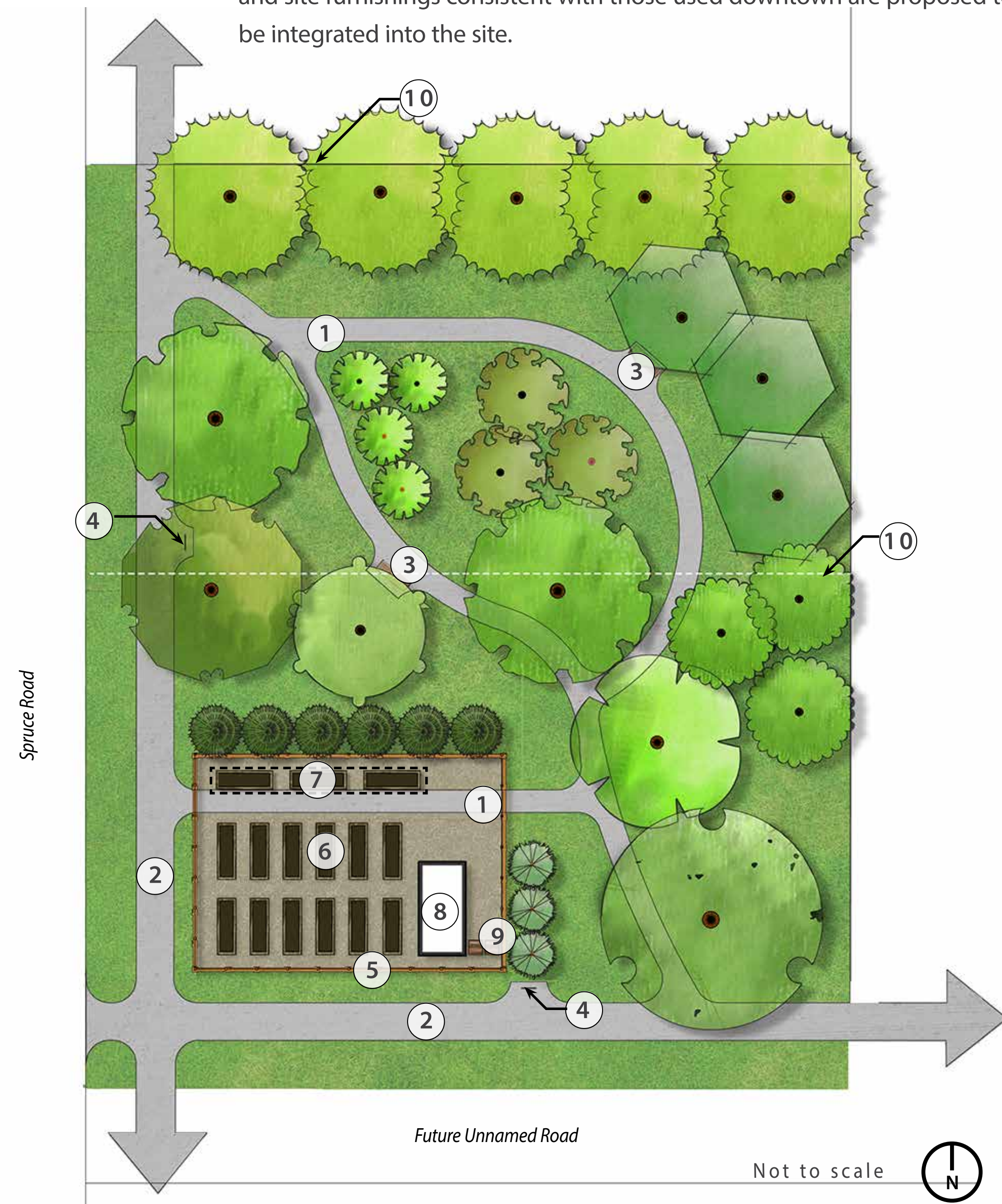
Conceptual plan of community garden and arboretum.