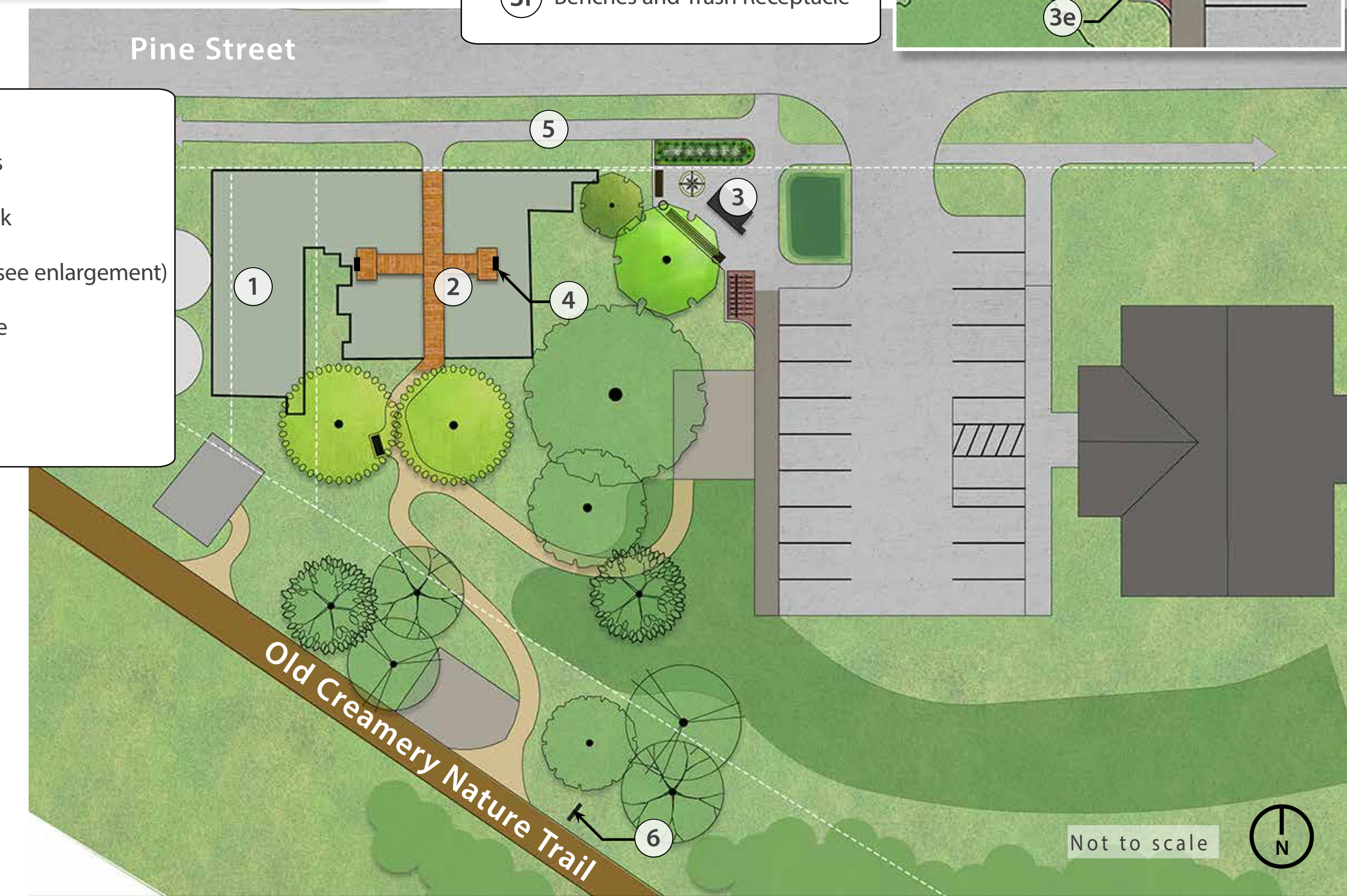
Conceptual plan of the old creamery site and library greenspace. Refer to trails visioning report and plans for additional information.