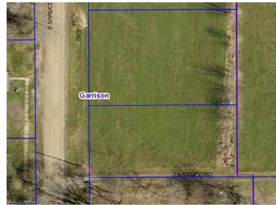
Existing aerial of proposed location for a new community garden and arboretum.

In this proposal, the area surrounding the community gardens is planted with the different tree species after which the streets of Garrison are named. Each tree would be identified by a label hanging from its branch. An ADA-accessible path winds is proposed to meander through the site, and site furnishings consistent with those used downtown are proposed to be integrated into the site.