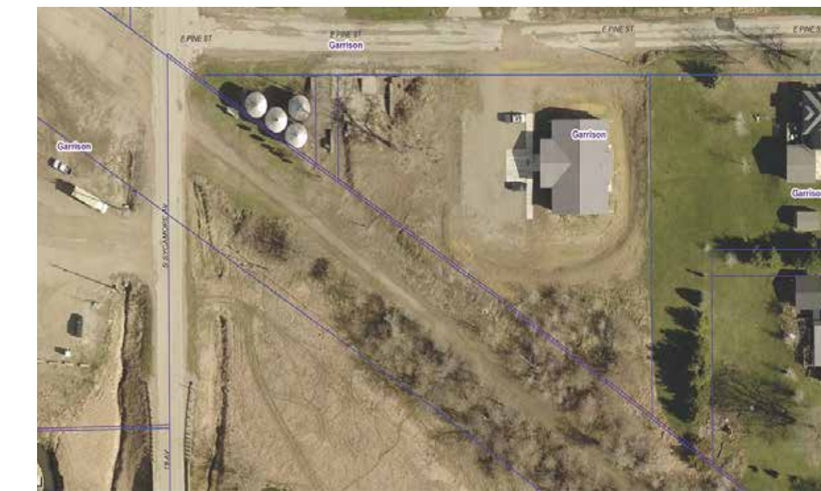
Existing aerial plan view.

Currently there are two school bus stops in Garrison. This concept proposes combining the two into one and relocates it near the library, because many children mentioned that they like to go there especially after school. The concept plan details the proposed elements of this area.