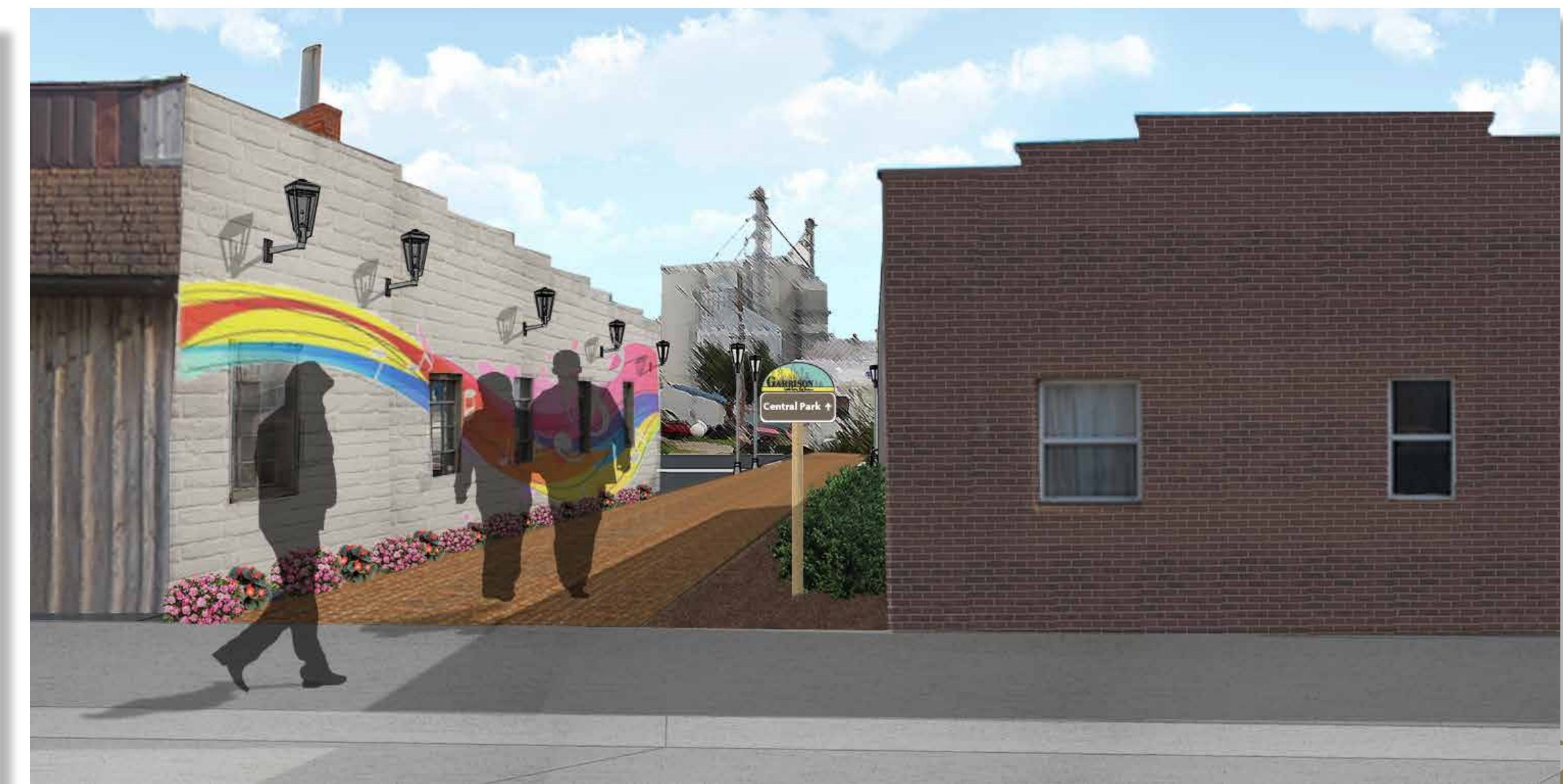
Conceptual photo edit 8.