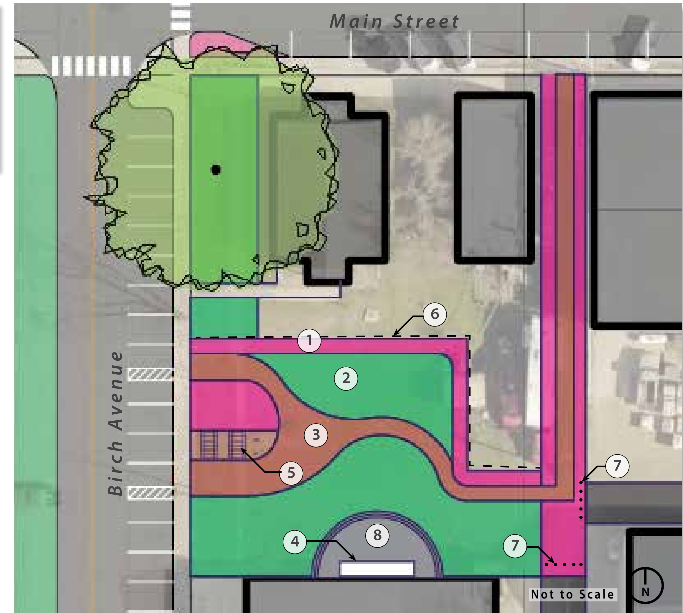
Conceptual plan of Central Park.