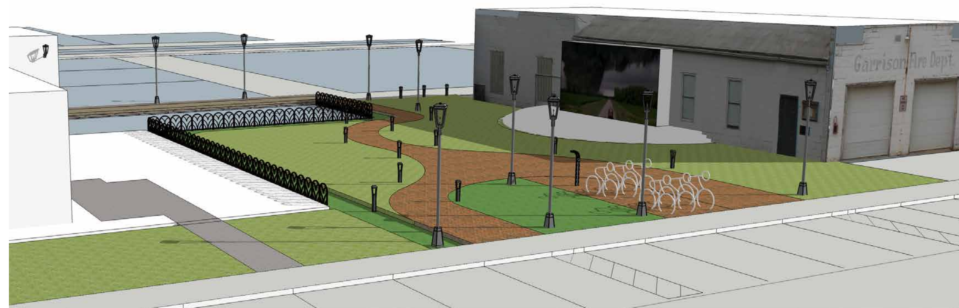
Conceptual sketch of the proposed Central Park with only hardscape feature shown.