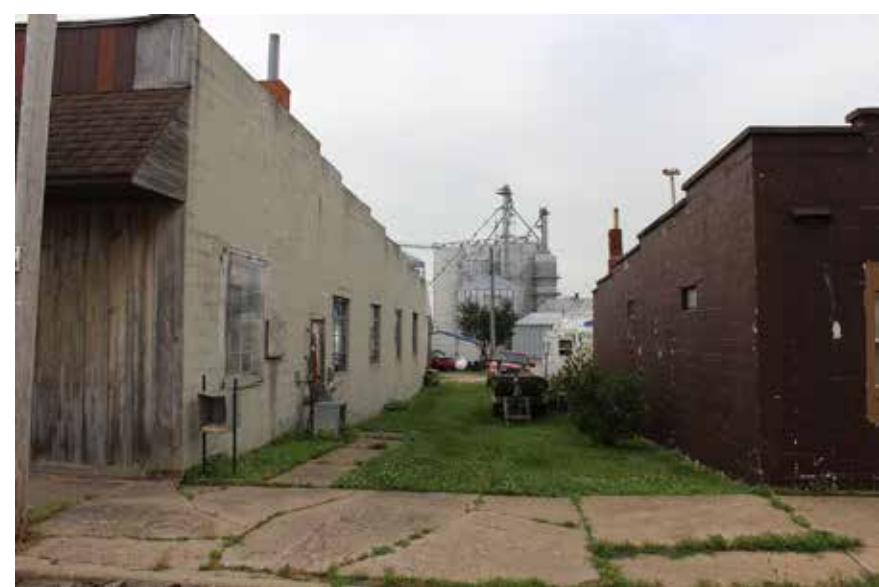
Existing image of alleyway from downtown.