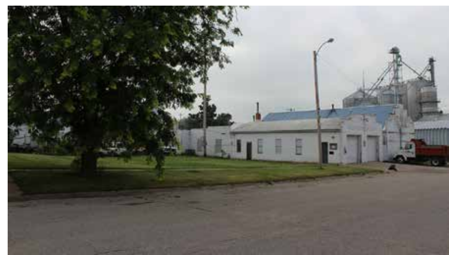
Existing image of Central Park location.