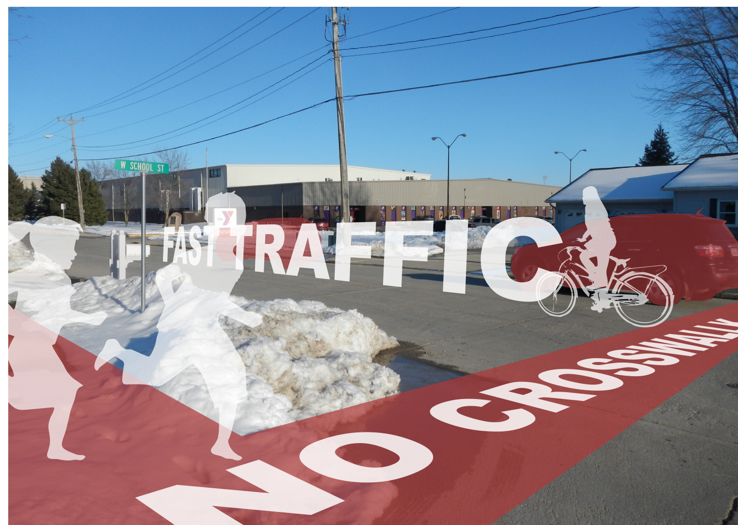
Children think it is risky to go between the school and the YMCA because there are no crosswalks.