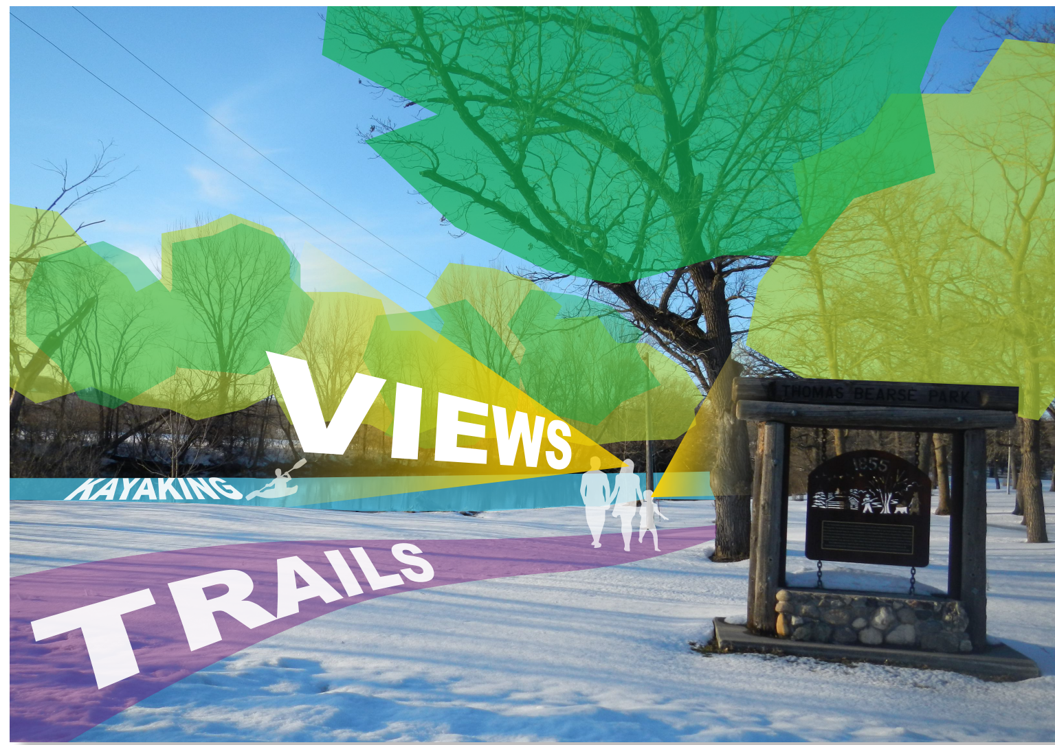
A popular destination, Thomas Bearse Park provides river access and scenic trails.