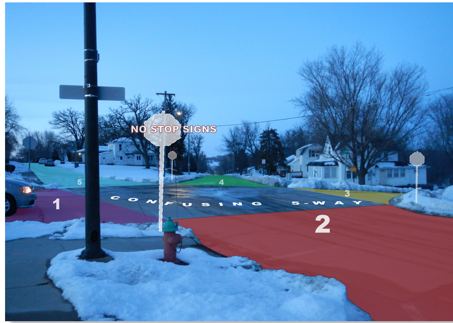
The lack of stop signs at the five-way stop leads to confusion.