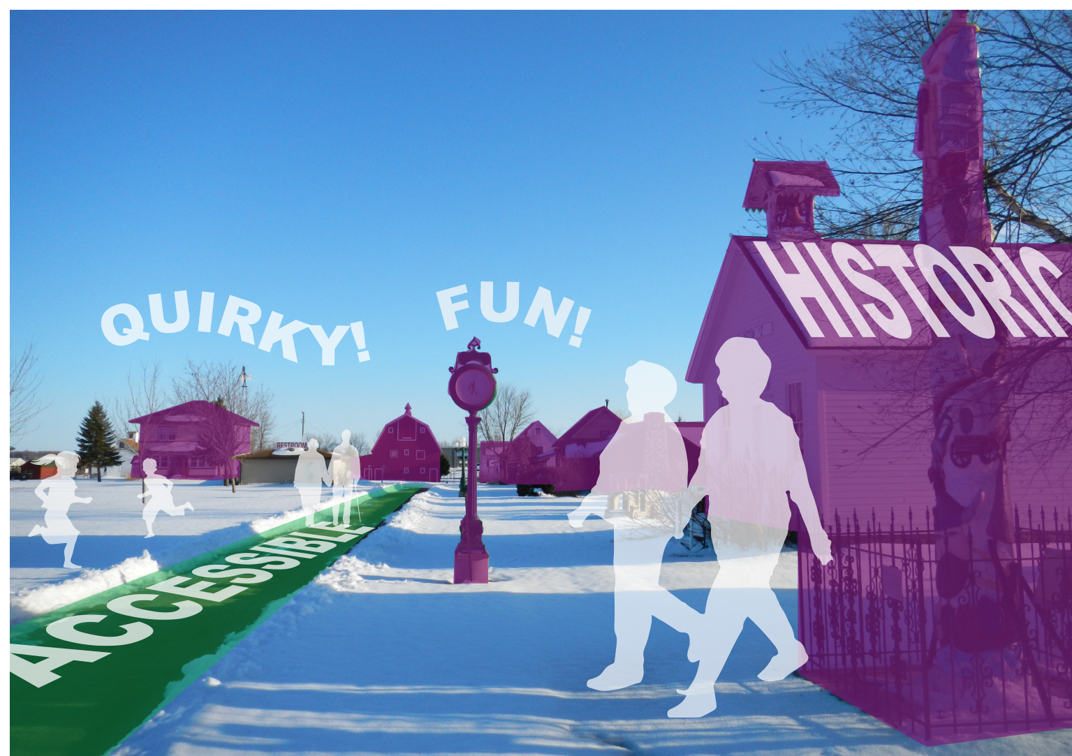
An important destination, Heritage Park hosts festivals, concerts, and community activities.