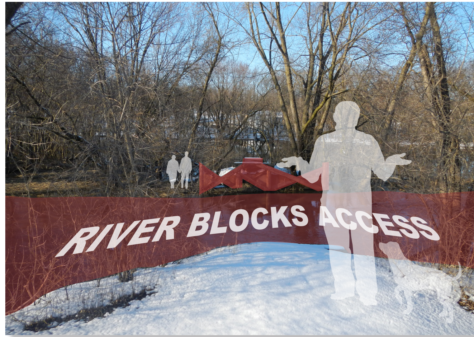
The absence of a bridge at the end of 7th Street creates disconnect between the north neighborhoods and the rest of town.