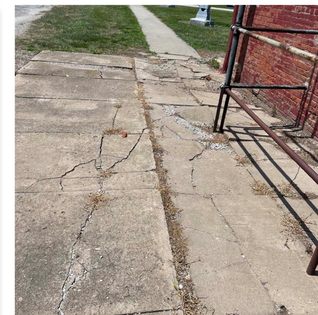
Most of the existing sidewalks in Farragut are deteriorating and need improvement.