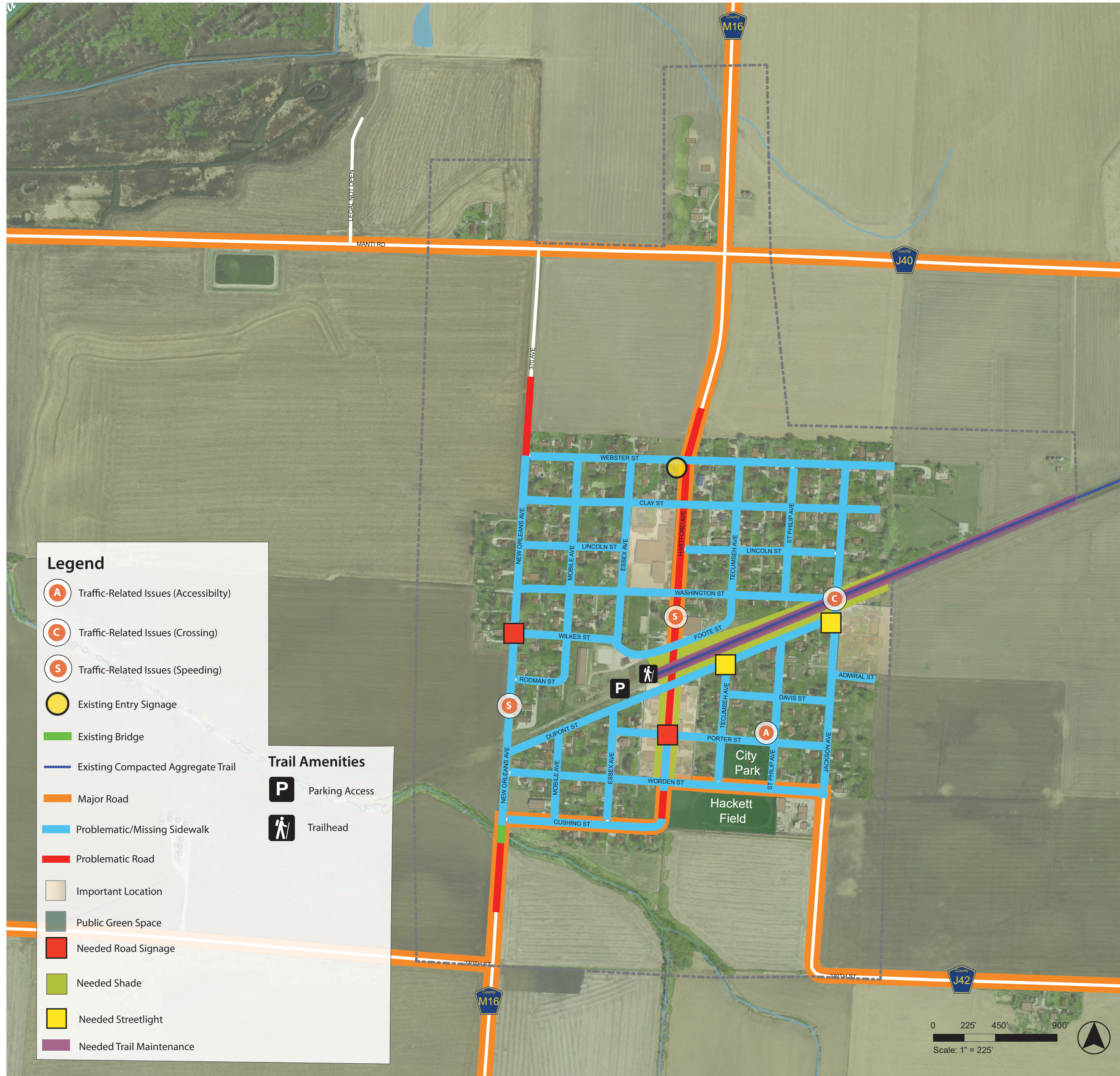
A map of Farragut highlighting and analyzing existing transportation infrastructure.