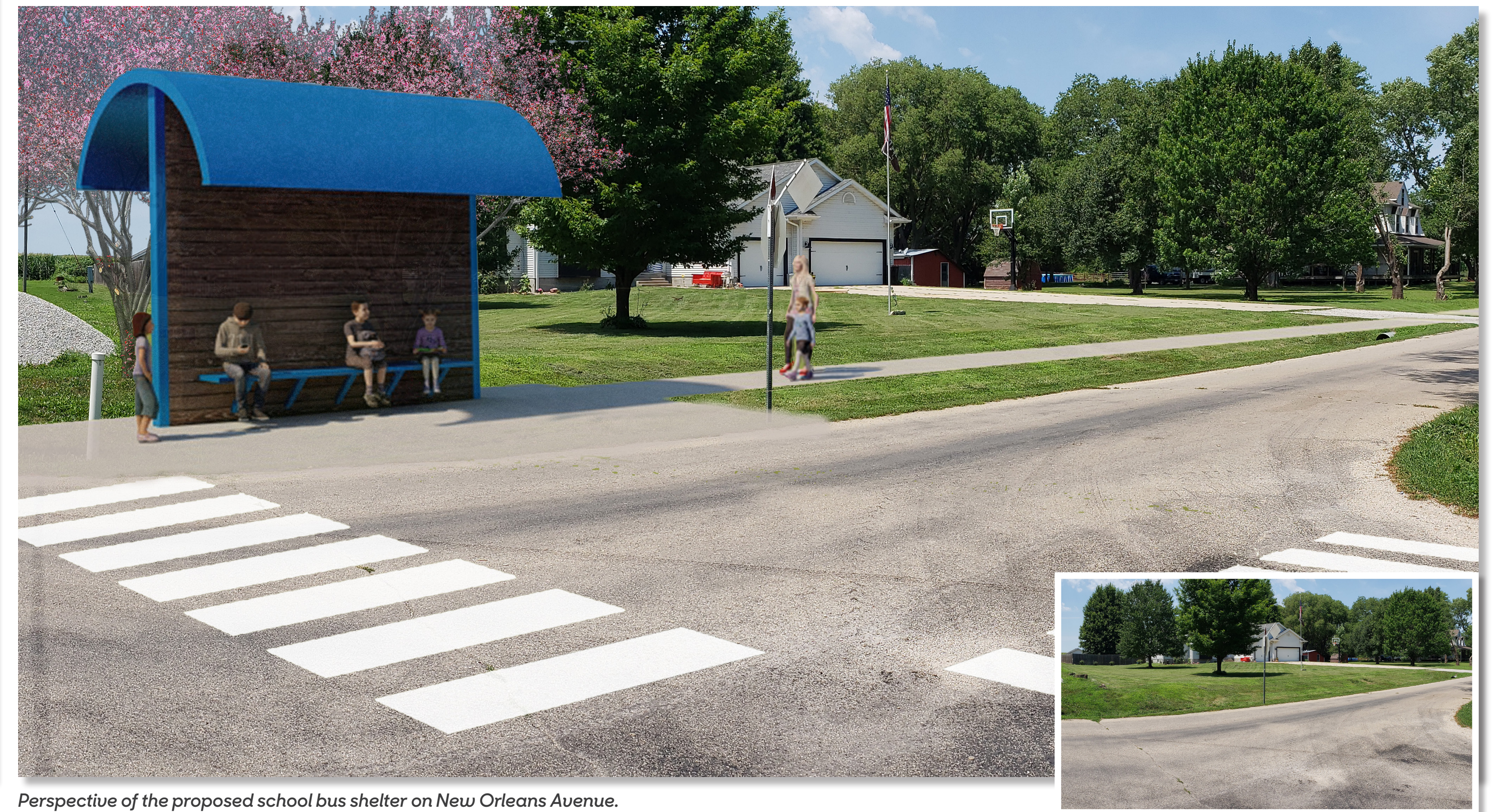
Perspective of the proposed school bus shelter on New Orleans Avenue.