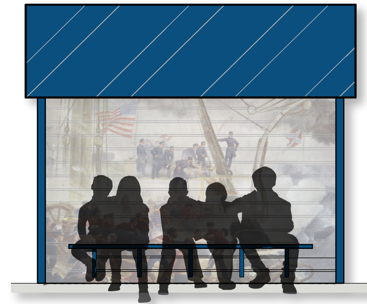
Elevation of the proposed school bus

In addition to the bus stop shelter, other amenities include marked crosswalks, improved sidewalks, added sidewalks, signage, and ornamental plantings around the paved bus stop area.