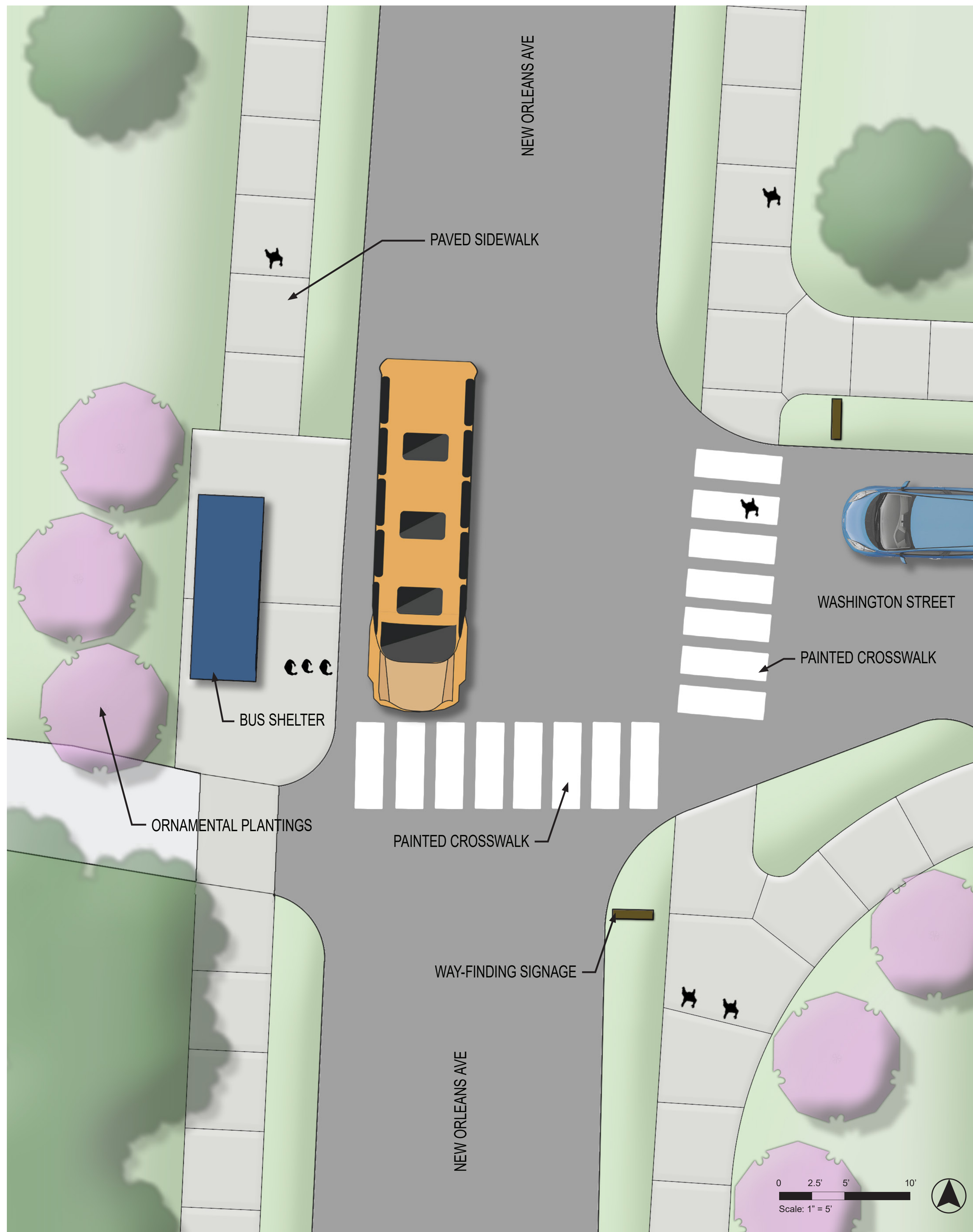
Plan view of the proposed school bus shelter at the corner of New Orleans Avenue and Washington Street.