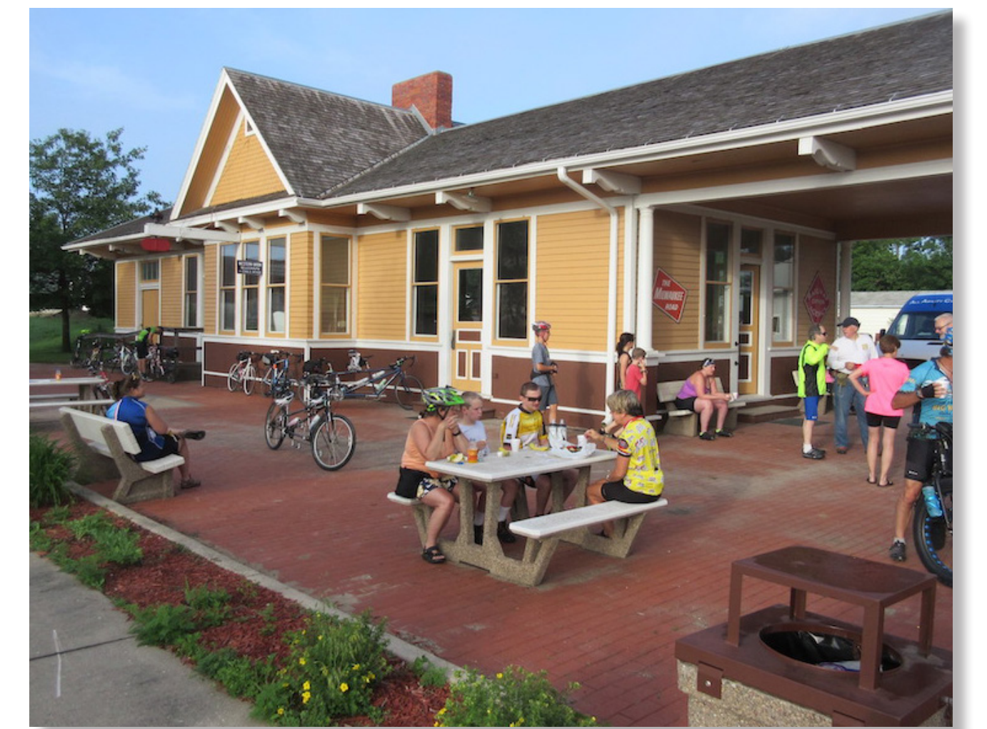
Trailhead seating area with open shelter gathering area.