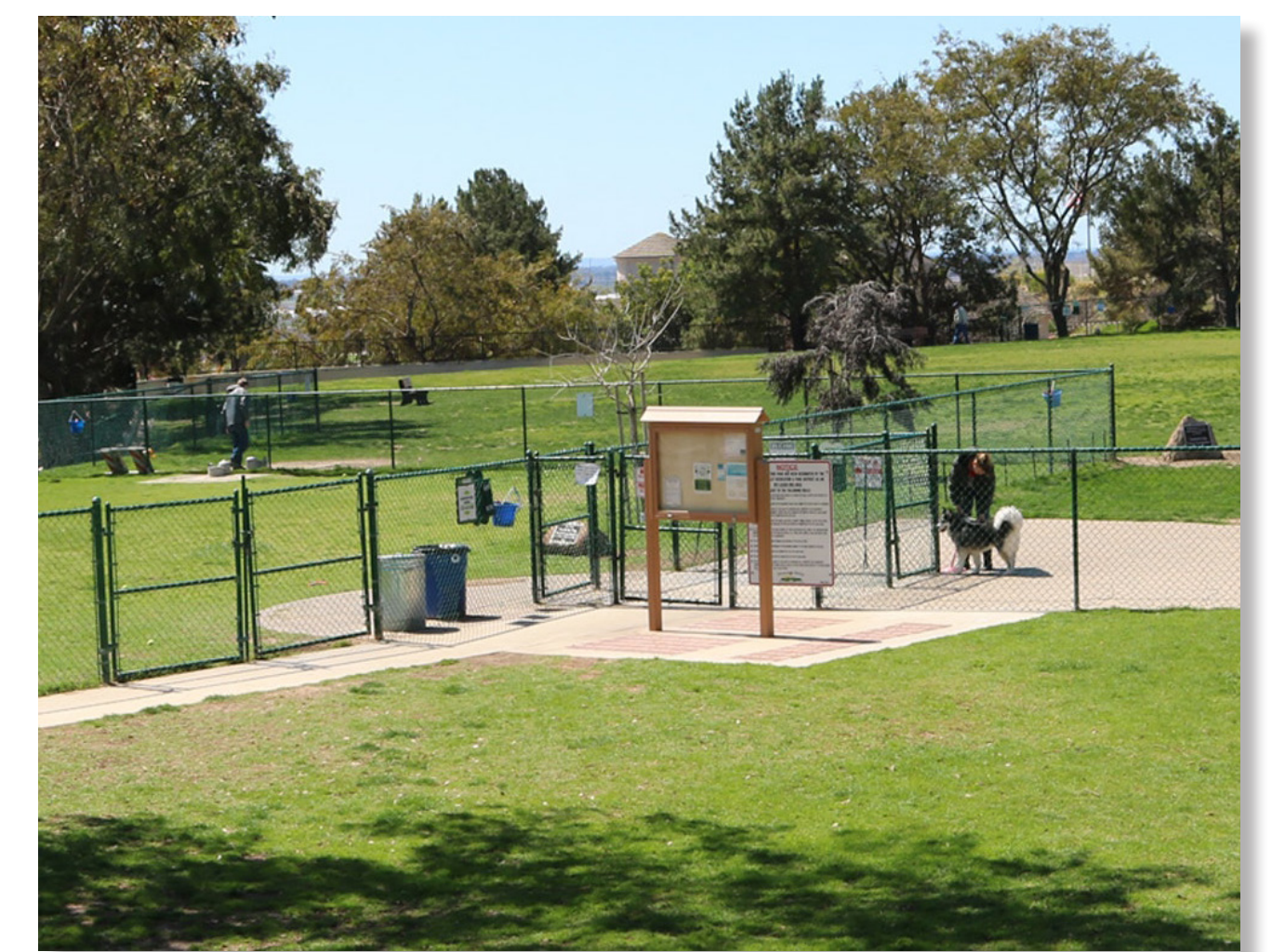
Dog park amenities for both large and small dogs.