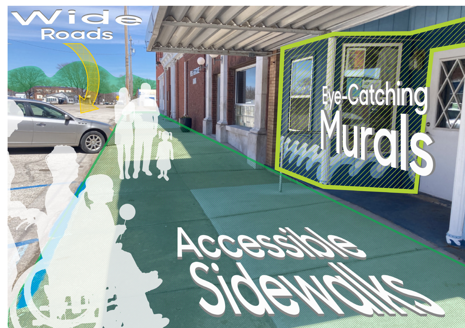
Downtown features an accessible and artful economic center that showcases the life of a small town.