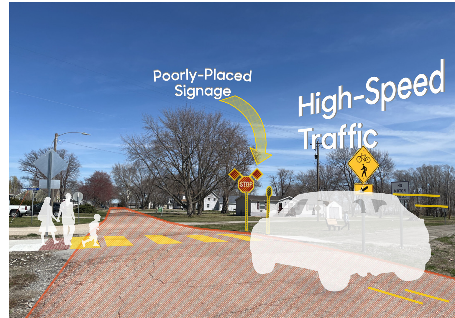
The intersection of Washington Street and Jackson Avenue is an uncomfortable and concerning crossing point for trail goers and motorists alike.