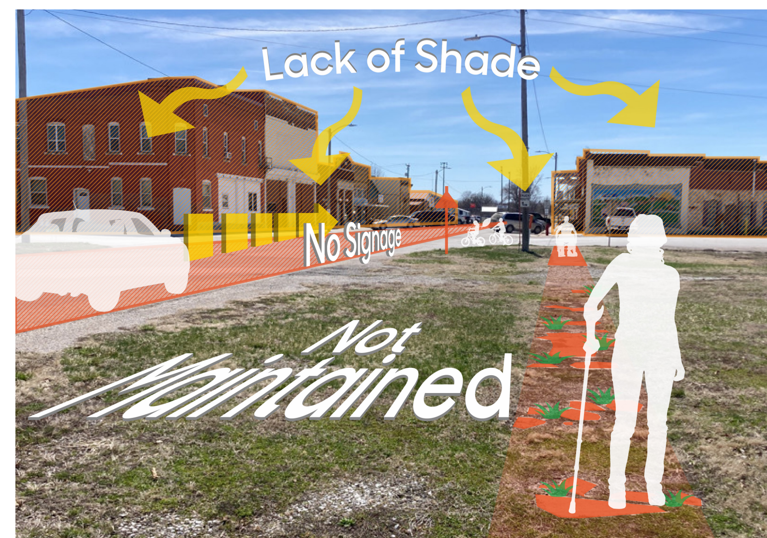
Hartford Avenue's exposed and worn entrance to downtown impedes the city's potential vibrancy.