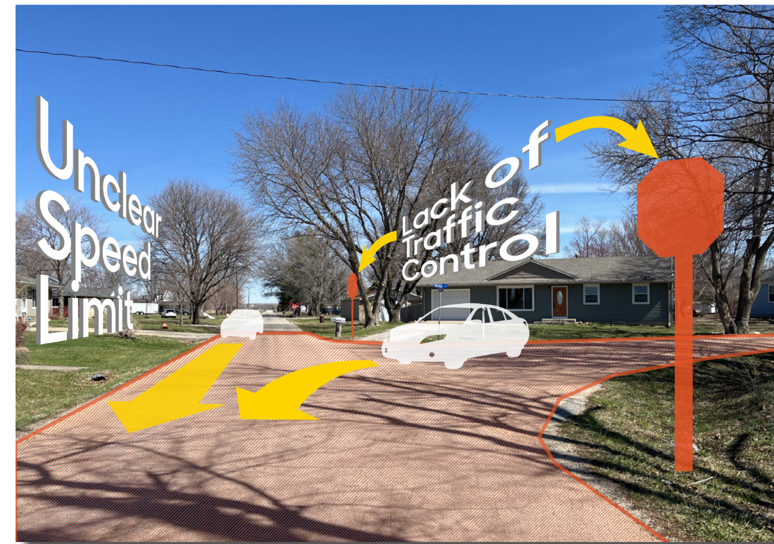
The intersection of New Orleans Avenue and Wilkes Street is confusing to navigate without proper traffic controls.