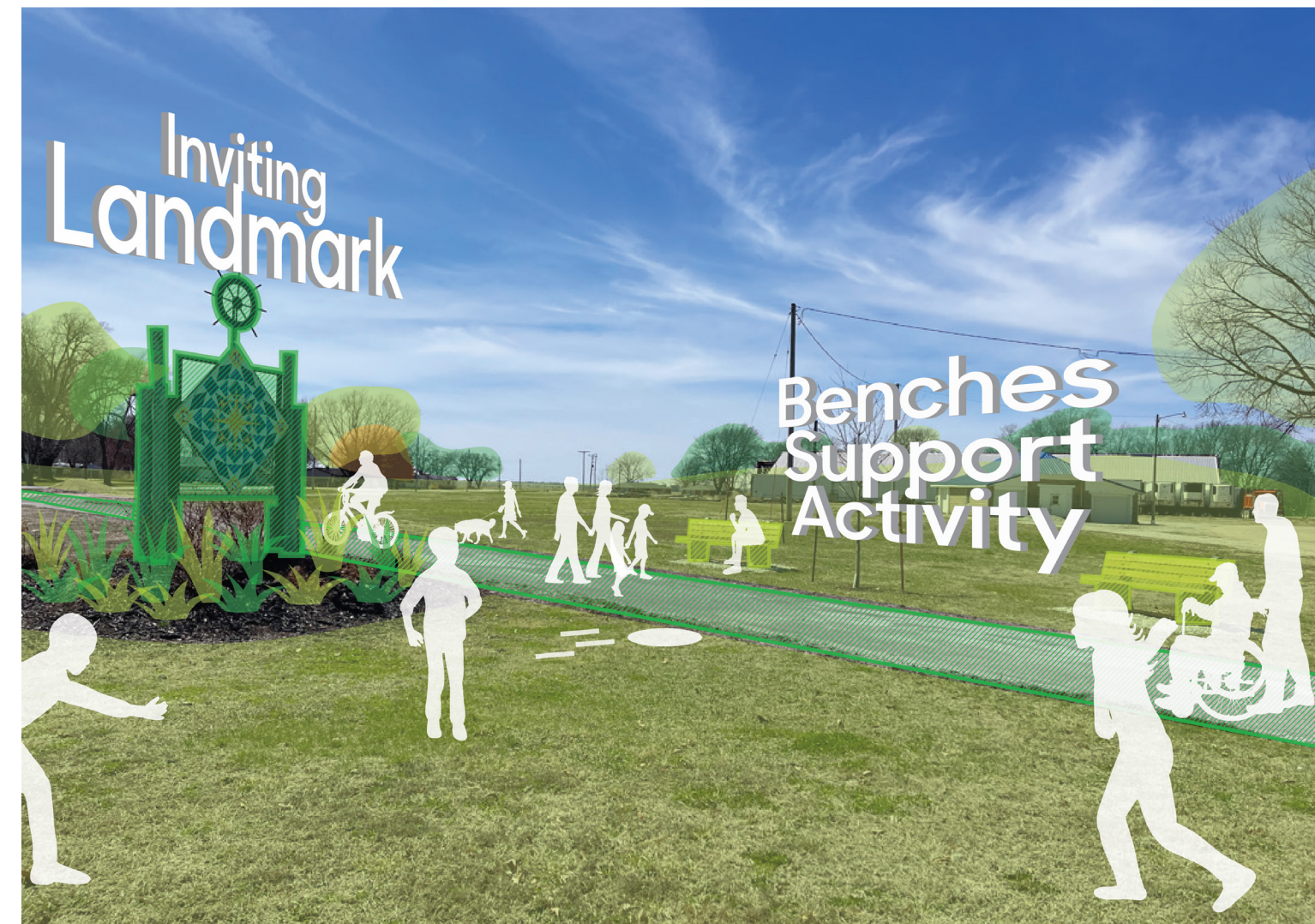
The trail provides an active and healthy social environment and connections to nature.