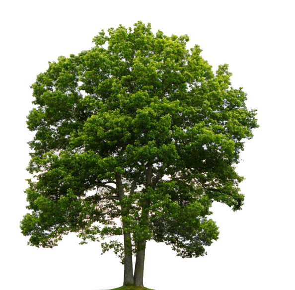
Swamp White Oak (Quercus bicolor)

The stately oak gives a grand stature & presence to any site. Swamp white oak takes on the appearance similar to other white oaks, while adapting to occasional flooding.