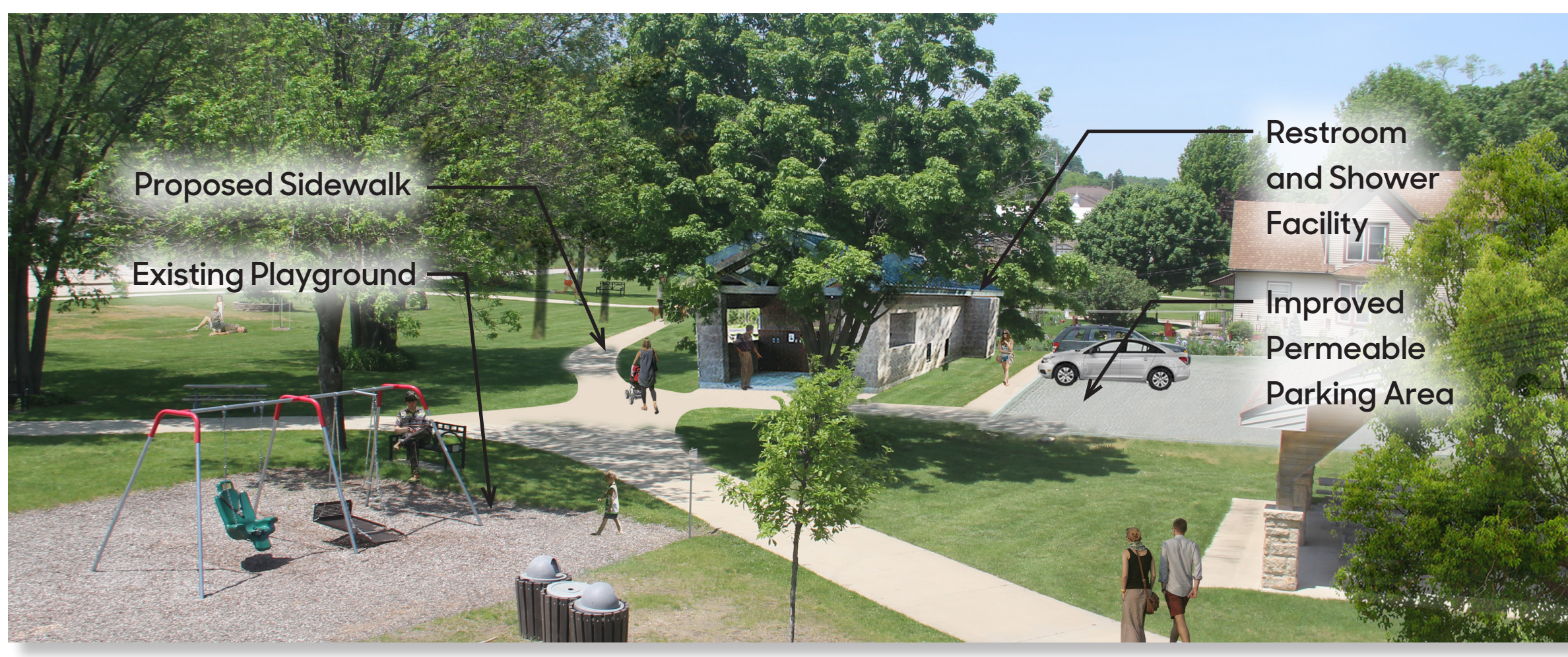
Perspective B - Proposed Restroom Looking from Playground

Similar to the Bald Cypress, the tamarack or larch is endemic to more northern climates. It is notable for adaptability to flood zones and vibrant yellow color in the fall.