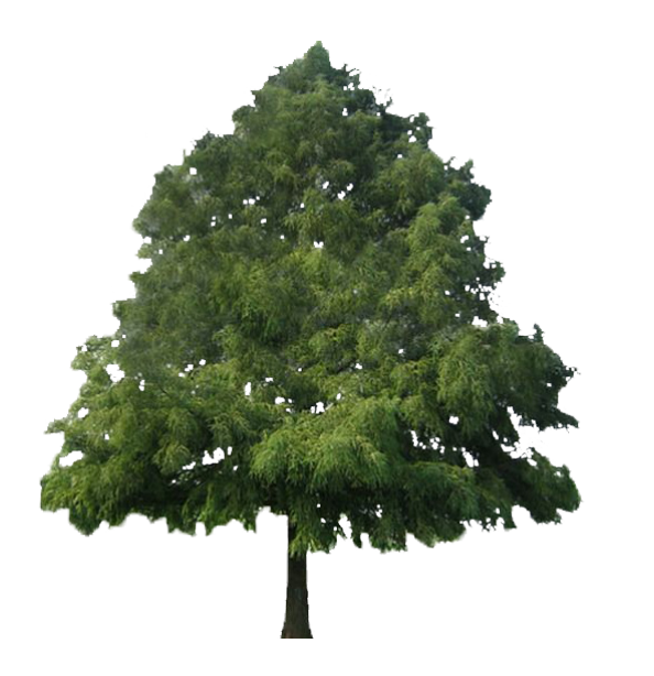
Bald Cypress (Taxodium distichum)

The stately oak gives a grand stature & presence to any site. Swamp white oak takes on the appearance similar to other white oaks, while adapting to occasional flooding.