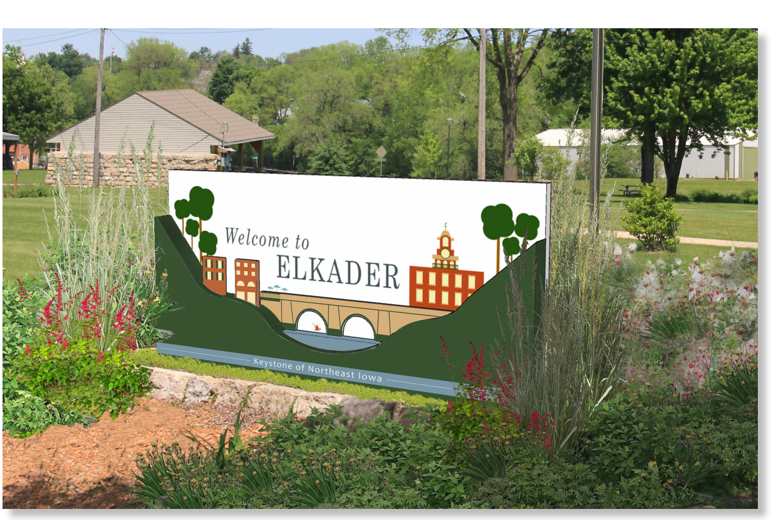
Perspective A - Proposed Community Entry Sign