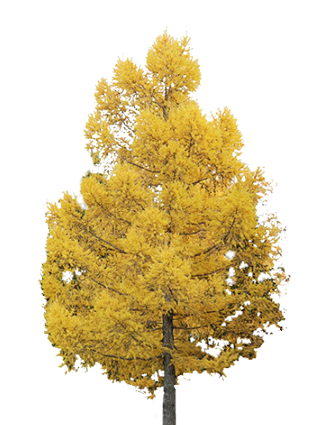
Eastern Tamarack (Larix laricina)

Black Tupelo is a unique species perfect for use as a street tree or in a rain garden, providing ample shade. It can be featured as a specimen, turning a beautiful shade of orange in the fall.