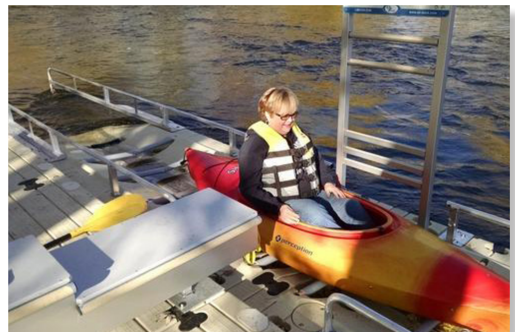
ADA-Accessible Boat Launch

Providing more biking and walking connections throughout Elkader will add both recreational and active transportation opportunities to residents and visitors. Creating a new pedestrian bridge across the river will reduce congestion on the Bridge Street Bridge, allow students to walk to school more efficiently, and create an access point for recreational trail users. At the terminus of the bridge, a trail will connect to the water access point and continue along Main with enhanced crosswalks and street amenities.