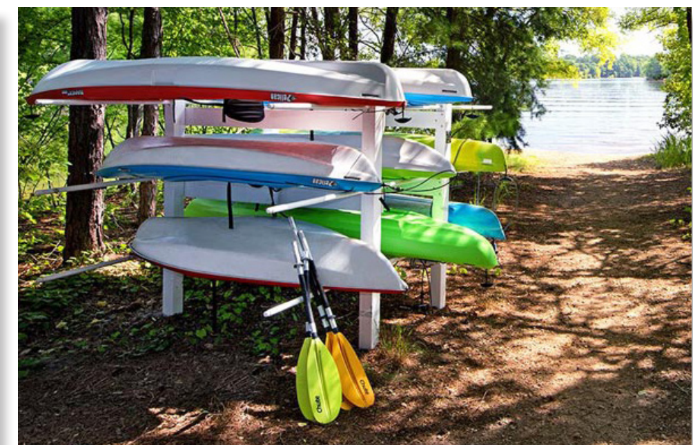
Boat Storage Rack