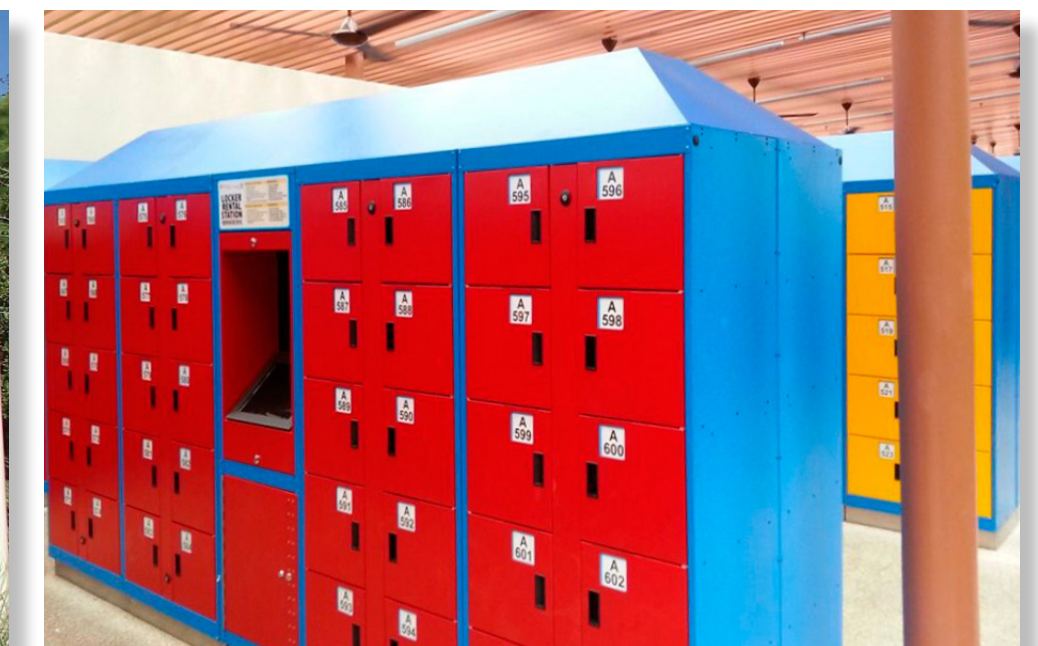
Recreation Storage Lockers