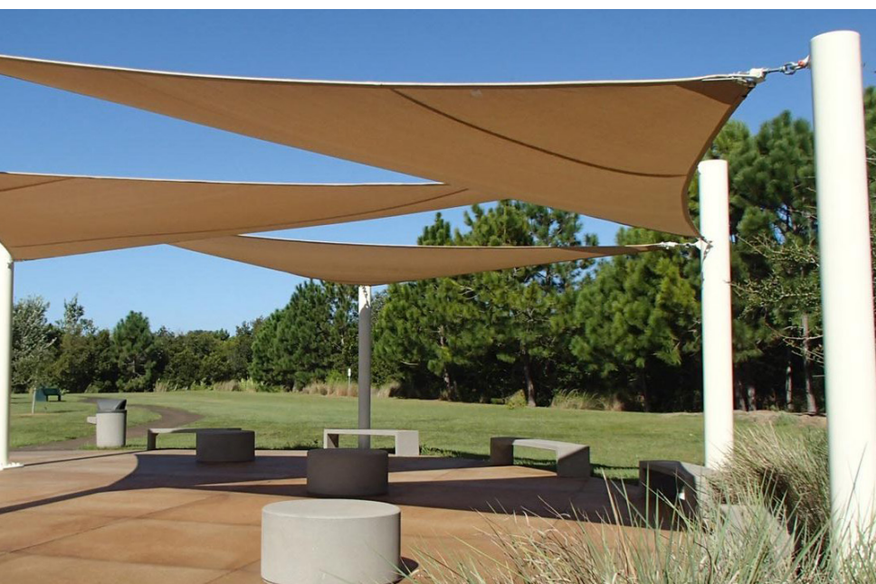
Canvas Shade Structures

Whitewater Park provides a great recreation area for both Elkader residents and visitors. The current park meets the needs of its users, but adding amenities such as boat storage, changing and locker facilities, enhanced trail connections to the park, and more shade throughout, will make the park an even bigger attraction. The images below show a few of these new amenities.