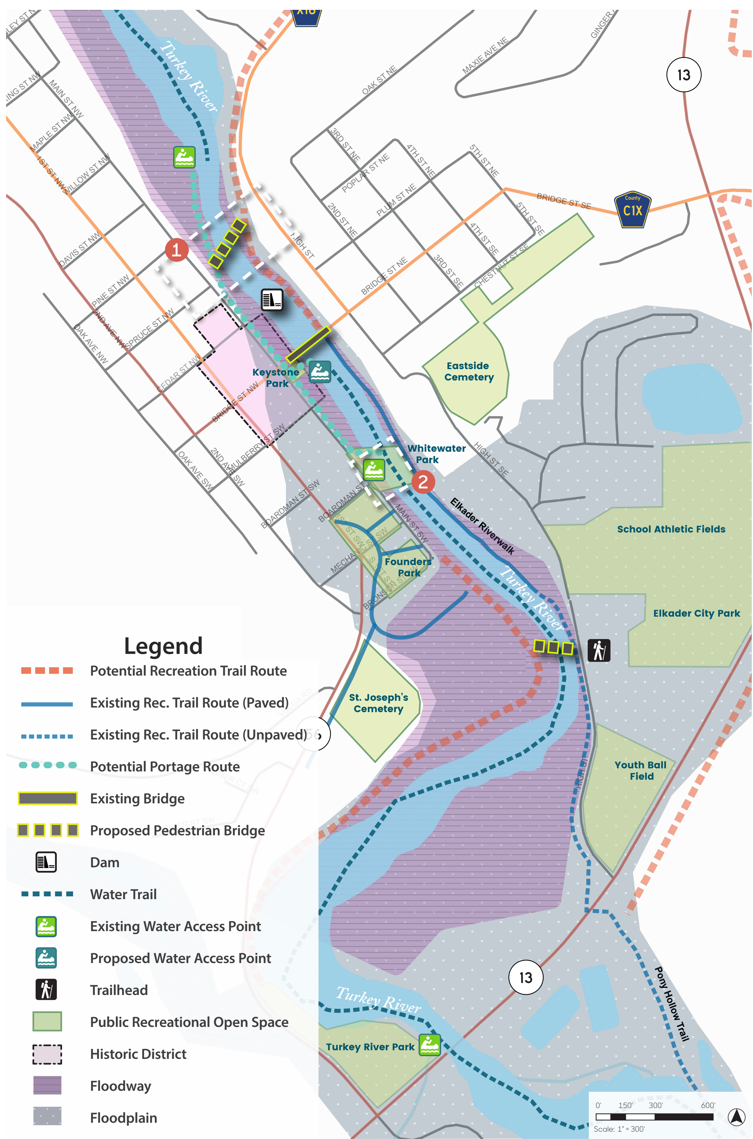
Map of Elkader's Water Trails and Amenities